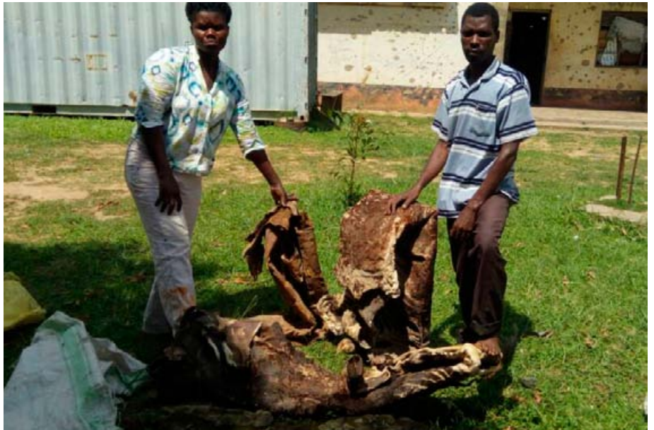
2 traffickers arrested with 3 okapi skins in West Nile area.

ed in west of the country with 4 tusks. 7 of them were intercepted in the act when they were getting into a car to transport the ivory, concealed in a plastic sack, to the place of transaction. Later they denounced an Army Officer, who they hired