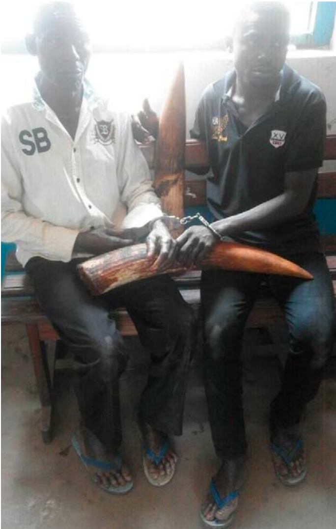
3 ivory traffickers arrested with 30 kg of ivory on the north part of the country.

■ 3 ivory traffickers arrested with 30 kg of ivory on the north part of the country. The PALF team had to combat multiple corruption and traffic in influence attempts threatening to release the traffickers. The well-organized notorious criminals