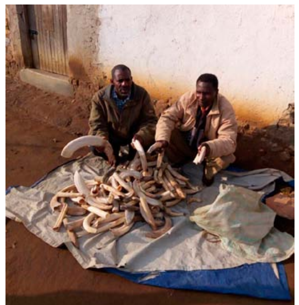
2 traffickers arrested with 127 hippo teeth