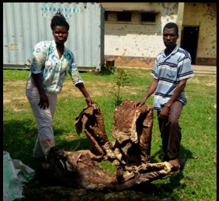
2 traffickers were arrested with 3 okapi skins in Uganda.