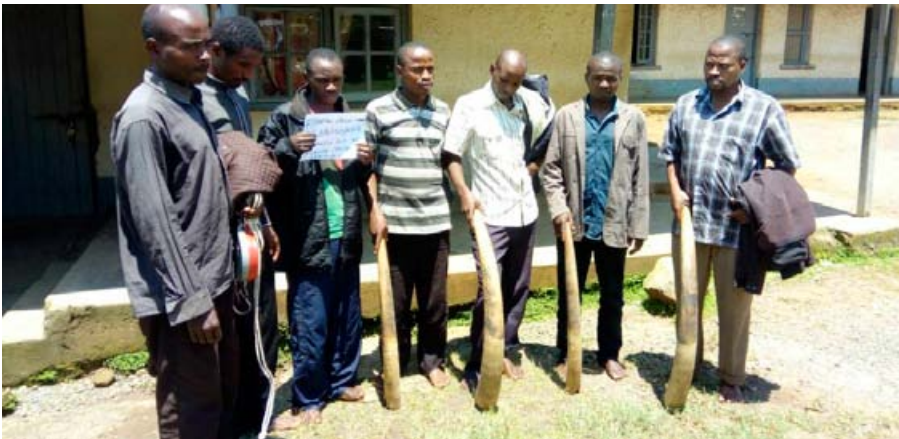
8 ivory traffickers including an army officer arrested in Uganda with 4 tusks.

in a plastic sack, to the place of transaction. Later they denounced an Army Officer, who they hired to poach the elephants in Kibale National Park. 3 ivory traffickers including an imam of the town's mosque arrested with 4 very large tusks in northern Uganda. The imam is from South Sudan and uses his links for cross border trafficking. Religious authorities feature often in our operations especially this year exposing the cover of crime and greed behind the fake appearance of morality. 2 ivory traffickers arrested in Kampala with 6 tusks. They were intercepted in front of the bank with the ivory concealed in a polyethylene bag, when they wanted to pick up money for the transaction.