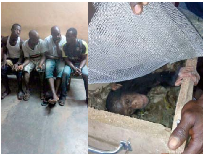
Another baby chimp rescued and 4 traffickers arrested.

■ 2 traffickers arrested with a baby mandrill and 40 kg of pangolin scales in the capital city. They