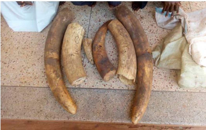
3 ivory traffickers including an imam of the town's mosque arrested with 4 very large tusks in northern Uganda

in the north of the country. He was arrested when he got into a car and intended to transport the hippo ivory to the place of transaction. The hippo teeth were collected in Murchison Falls National park, the amount represents about 10 massacred hippos.