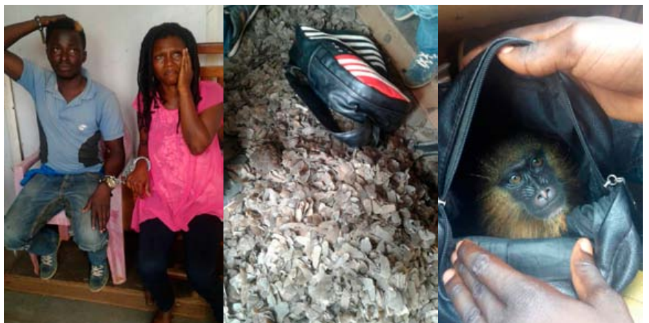
2 traffickers arrested with a baby mandrill and 40 kg of pangolin scales in the capital city.