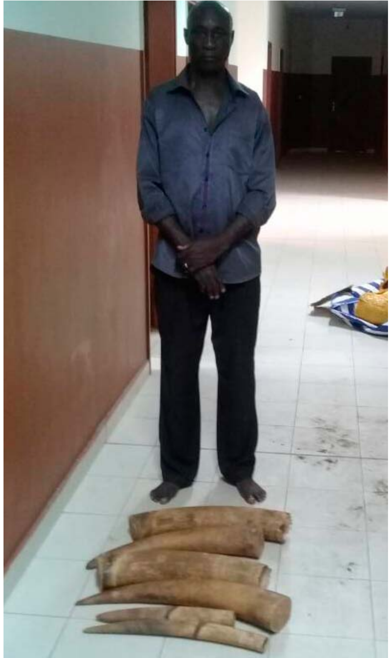
A Senegalese ivory trafficker arrested with 4 tusks in the capital city.