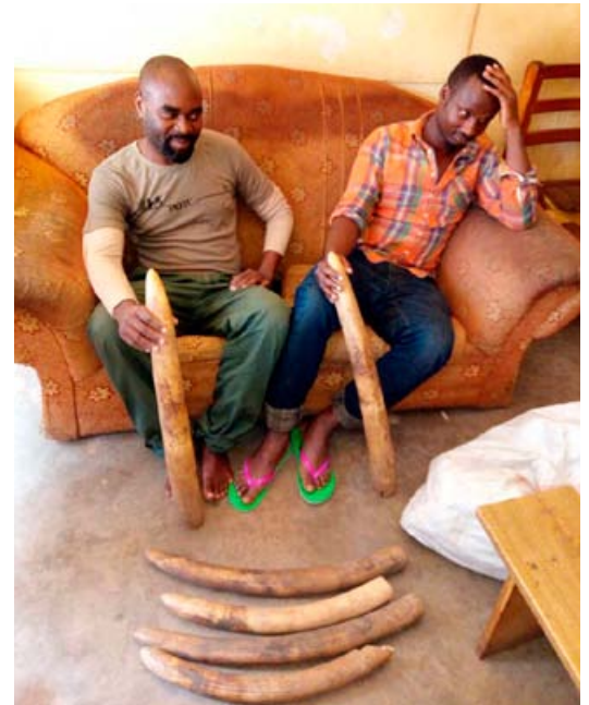
2 ivory traffickers arrested in Kampala with 6 tusks.