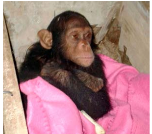
A baby chimp rescued and 3 traffickers and an accomplice arrested in Cameroon