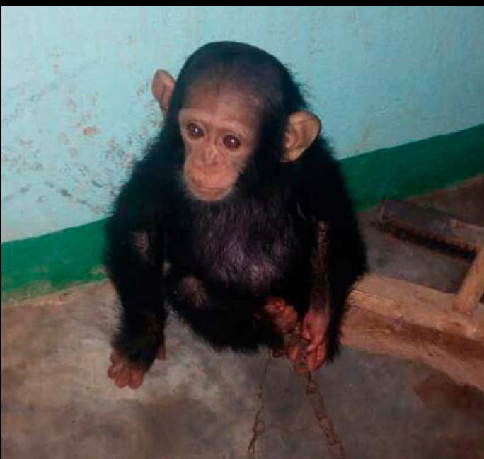
A baby chimp was rescued and an ape trafficker was arrested in Cameroon. The trafficker is known to deal with live primates, concealed the baby chimp in a bag.