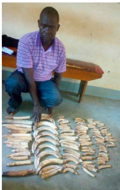
A trafficker arrested with 102 hippo teeth in the north of the country