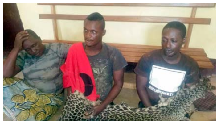
4 traffickers arrested with 2 leopard skins