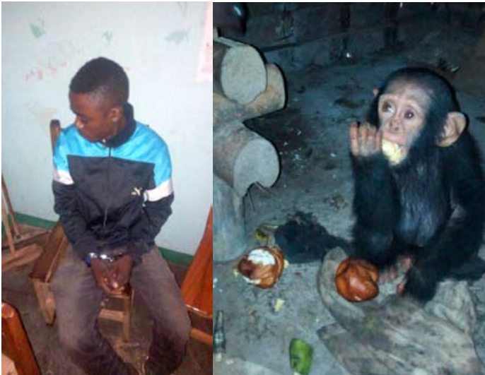
A baby chimp was rescued and an ape trafficker arrested in the south of the country.

■ 7 traffickers arrested and 2 chimps and a mandrill rescued in a crackdown on primate trafficking. A baby chimp was rescued and an ape trafficker arrested in the south of the country. The trafficker is known to deal with live primates, concealed the baby chimp in a bag. The 10-month-old orphaned baby chimp, named Farah, was strong and was handed to Ape Action Africa for lifetime care. This was the second baby chimp rescue of LAGA in a short period of time.