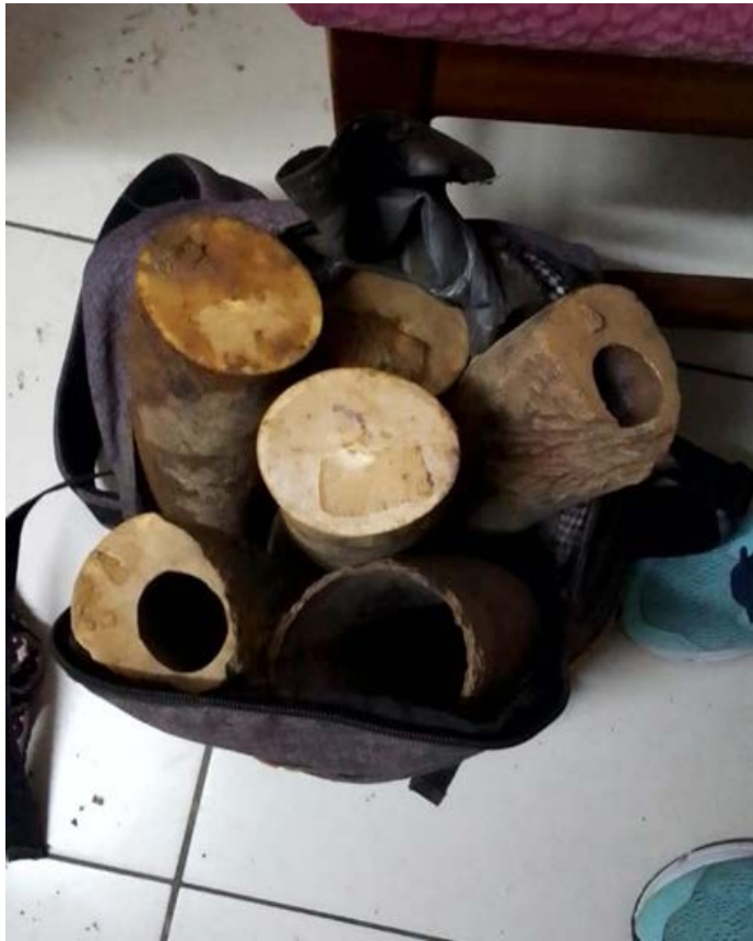
A trafficker arrested with 2 elephant tusks in Gabon

2 traffickers arrested with 2 tusks and a half in Togo. The two reside in Ghana and their trafficking operation has consisted of moving ivory cross-border on a motorbike with no matriculate number and concealed in bags of plantains. They used routes frequented by smugglers to get contraband across the borders.