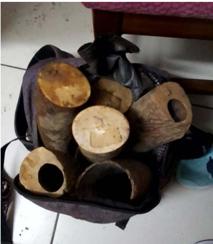
A trafficker arrested with 2 elephant tusks.