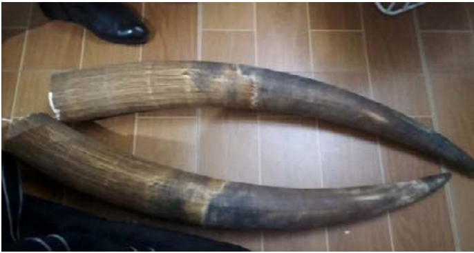
2 traffickers arrested with 2 elephant tusks