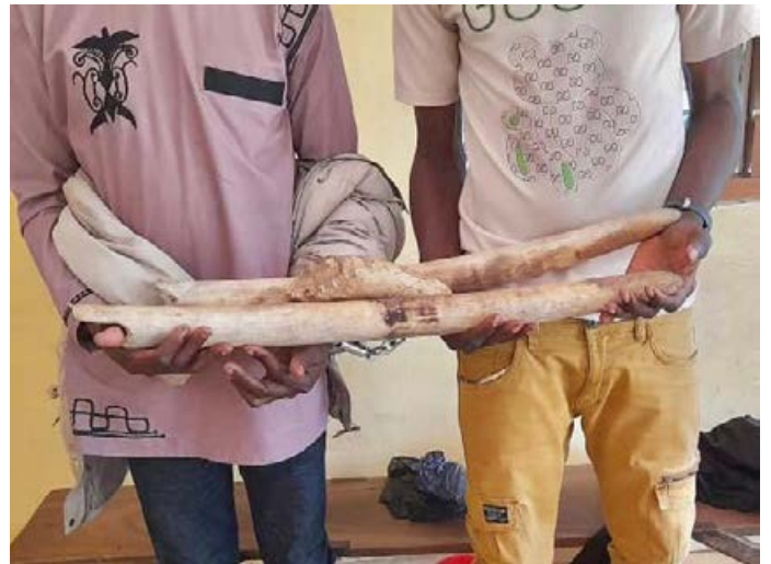
2 traffickers arrested with 2 tusks and a half in Togo