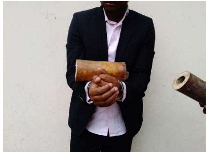
A trafficker arrested with an elephant tusk cut into 6 pieces in Congo

A trafficker arrested with an elephant tusk cut into 6 pieces in Congo. He was arrested during an attempt to sell the ivory. He is linked to an ivory trafficker arrested in September and sentenced to two years in prison. He arrived at the scene of transaction in a taxi, carrying a multicolour shopping bag in which the tusks were concealed.