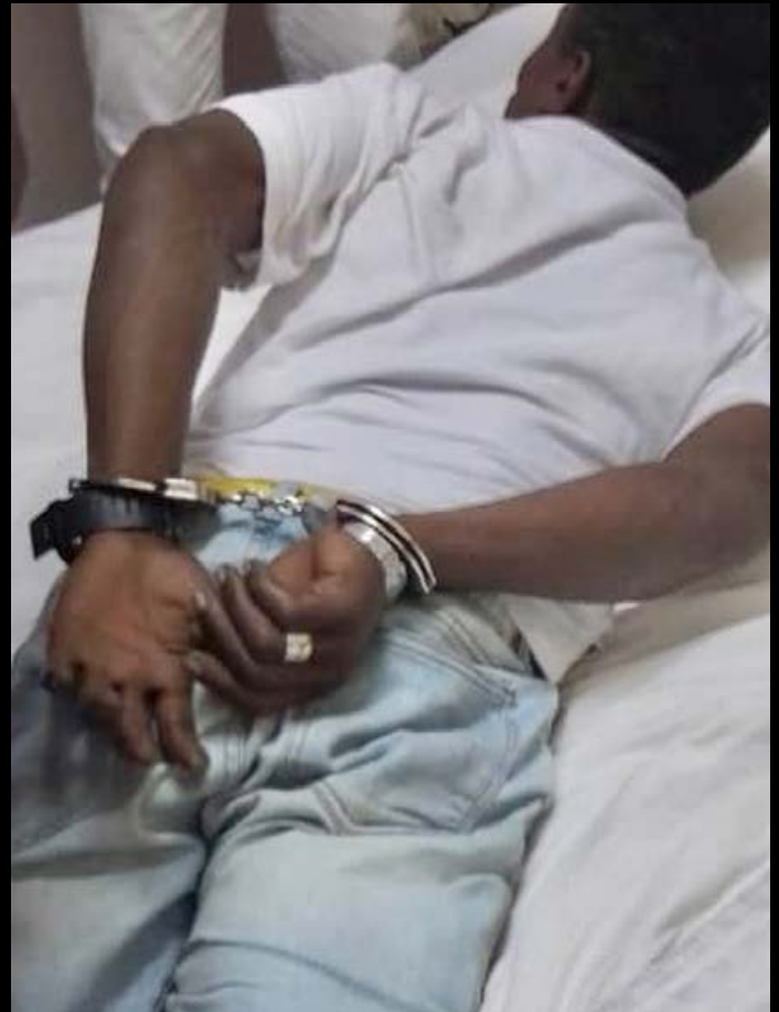
A trafficker arrested with 2 elephant tusks in Gabon