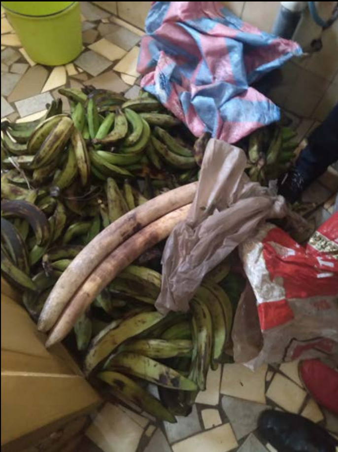
2 traffickers arrested with 2 tusks and a half in Togo