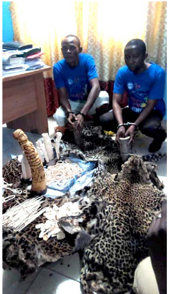
2 ivory traffickers arrested in Brazzaville with almost 400 pieces of ivory.