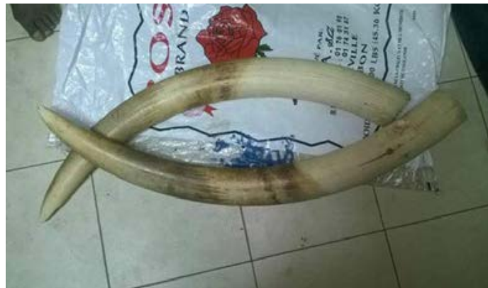
3 ivory traffickers, one of them retired police officer, arrested with 2 tusks in Libreville.

Central Africa. He held a series of meetings in Congo, including with CIDT – CV4C Team leader, Independent Forest Monitoring projects, the EU officer for Environment, DFID – Forest Governance, Markets & Climate Programme Team Leader and others.