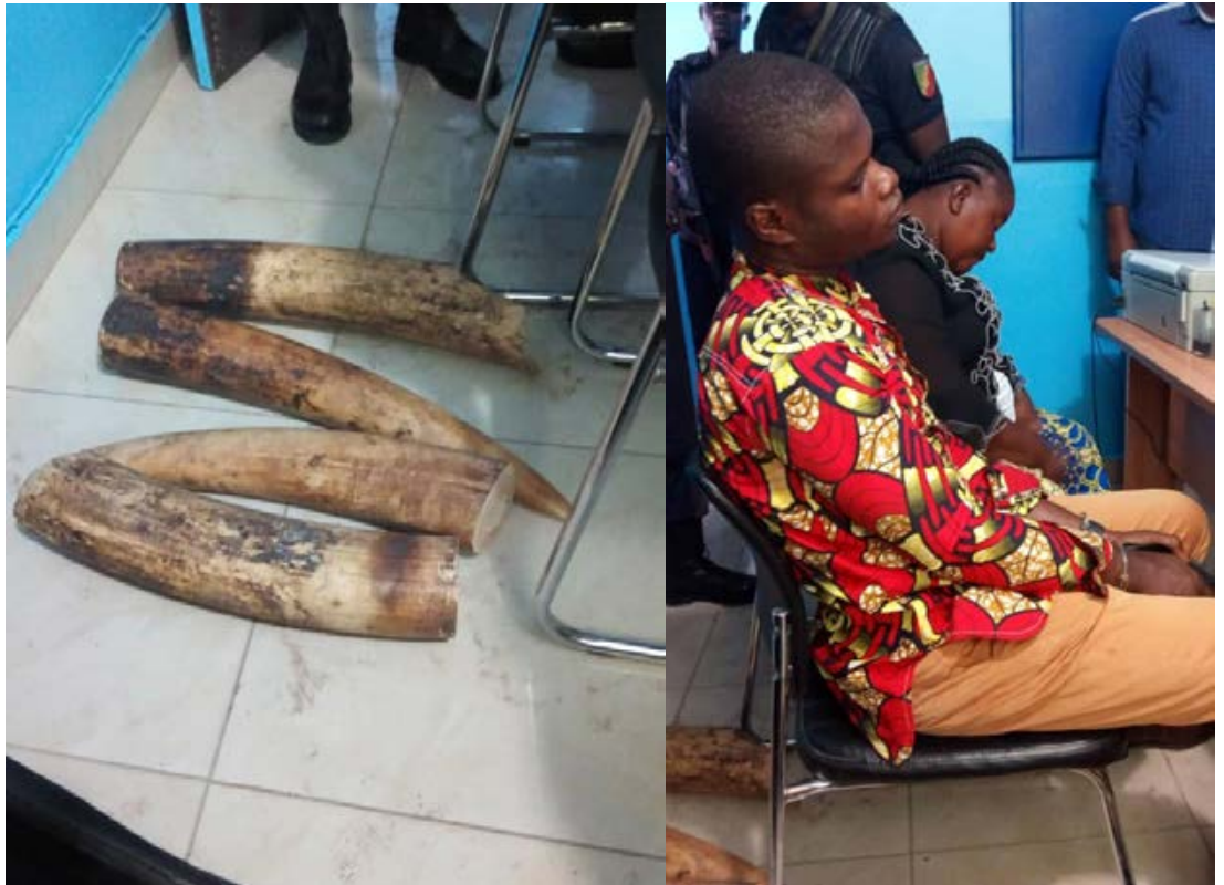
2 traffickers arrested with 2 large tusks.

ment Officer, conducted mission to Congo to support the project management and to strengthen PALF team by support given to Coordinator in ensuring team health, respect and cooperation, understanding and using emotional intelligence, handling and dealing with stress, conflict management, lack of respect, establishing authority and others.