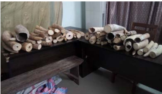
3 traffickers were arrested in Benin including a head of a large trafficking ring with 252 kg of ivory.

3 ivory traffickers, one of them retired police officer, were arrested with 2 tusks in Gabon. They brought the ivory to the place of transaction in a car concealed between the front and rear seats in a rice bag. Two of them have been trafficking ivory for 10 years.