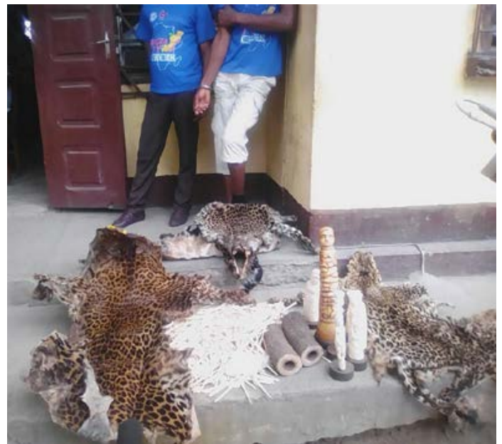
2 ivory traffickers were arrested in Congo with almost 400 pieces of ivory.