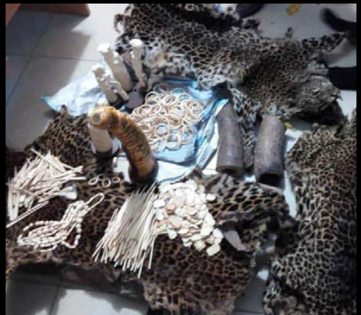
2 ivory traffickers arrested in Congo with almost 400 pieces of ivory