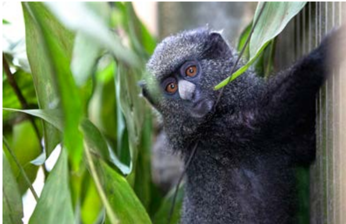
A Spot-nosed Monkey rescued and two traffickers arrested in Congo.

2 traffickers, one of them a corrupt military officer, arrested with 28 African Grey Parrots, an Allen's Swamp Monkey and a Spot-nosed Monkey in Congo. One of the traffickers is a military officer in the Republican Guard. The animals were held in a tiny cage in horrible conditions and kept outside of a bar that belongs to the military officer. He used his status to protect his illicit activities including the illegal trade in African grey parrots.