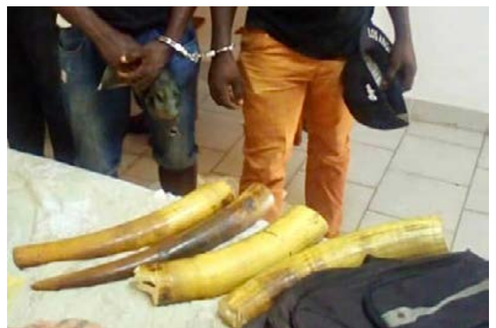
4 traffickers arrested with 2 elephant tusks in Gabon.

A trafficker arrested with 2 elephant tusks in Côte d'Ivoire. More carved ivory, 17 elephant tail bracelets and 8 rings, a leopard tooth, a full elephant tail and more treated elephant hair discovered during a house search. Cash registry shows he has been active for more than two decades.