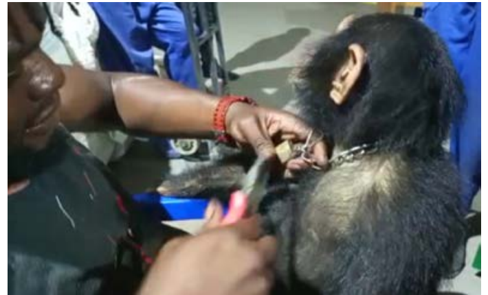
An investigation started by the Investigations Team and handed over to Conserv Congo led to arrest of a trafficker in Kinshasa, DRC. A chimpanzee was rescued. It took sustained effort to cut the chain free.

Jane Goodall Institute brought in a team of veterinarians who took charge of the animals and flew them to the Tchimpounga Sanctuary for appropriate care and support.