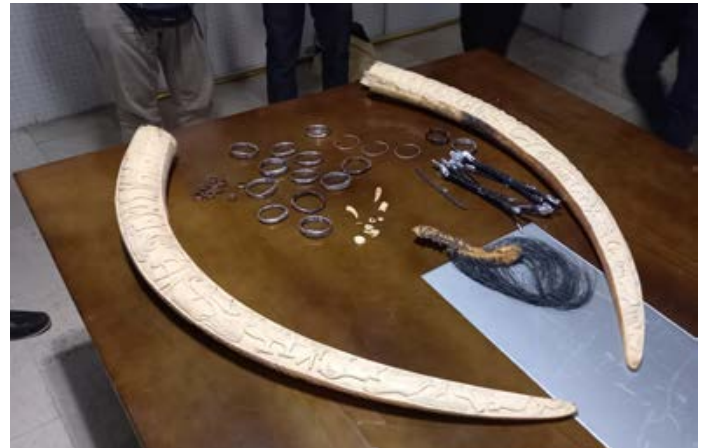
A trafficker arrested with 2 elephant tusks in Côte d'Ivoire.

A trafficker arrested with 86kg of pangolin scales and a young baboon rescued in Cameroon. The animal was found leashed around the waist and tied to a tree at the premises of the trafficker. He bought