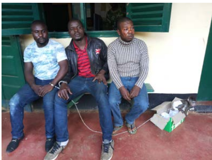
3 traffickers arrested in Cameroon and a baby drill rescued.

4 traffickers arrested with 2 elephant tusks in Gabon. A Cameroonian and a Nigerian were first arrested in Port-Gentil as they attempted to sell the ivory. They denounced a third trafficker to be owner of the ivory. He was arrested a few days later in the same town. During his interrogation he denounced a fourth trafficker who was also arrested.