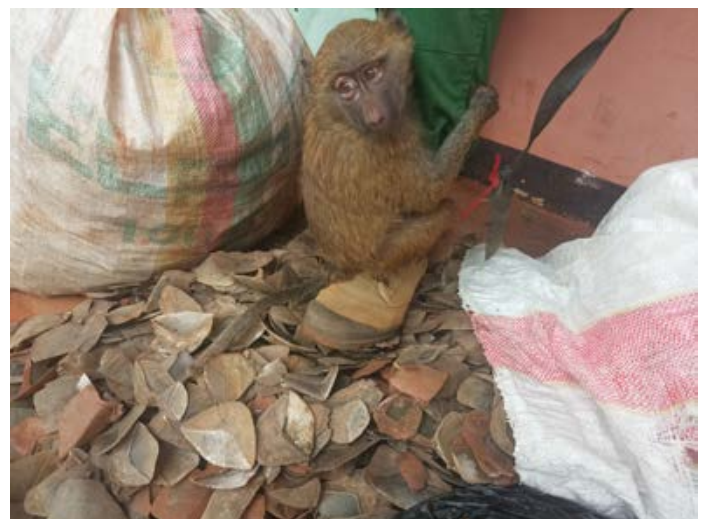
A trafficker arrested with 86kg of pangolin scales and a young baboon rescued.