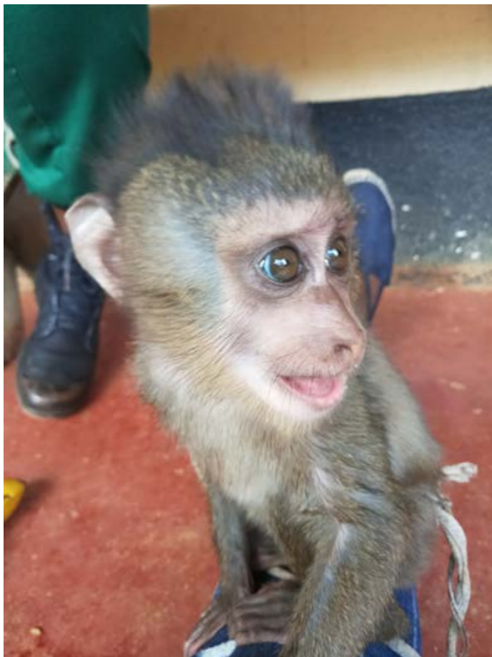
3 traffickers arrested and a baby drill rescued.

■ A trafficker arrested with 86kg of pangolin scales and a young baboon rescued. The animal was found leashed around the waist and tied to a tree at the premises of the trafficker. He bought the young baboon from a poacher who trapped and killed the mother. The scales are from giant pangolins which is more threatened with extinc-