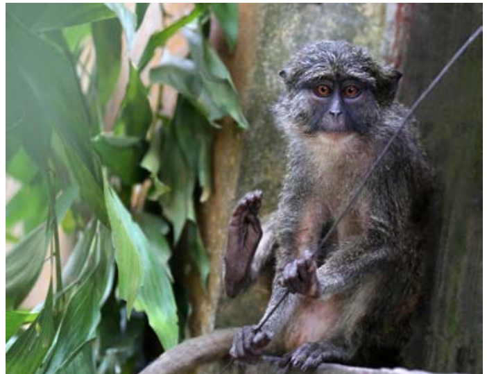
Allen's Swamp Monkey