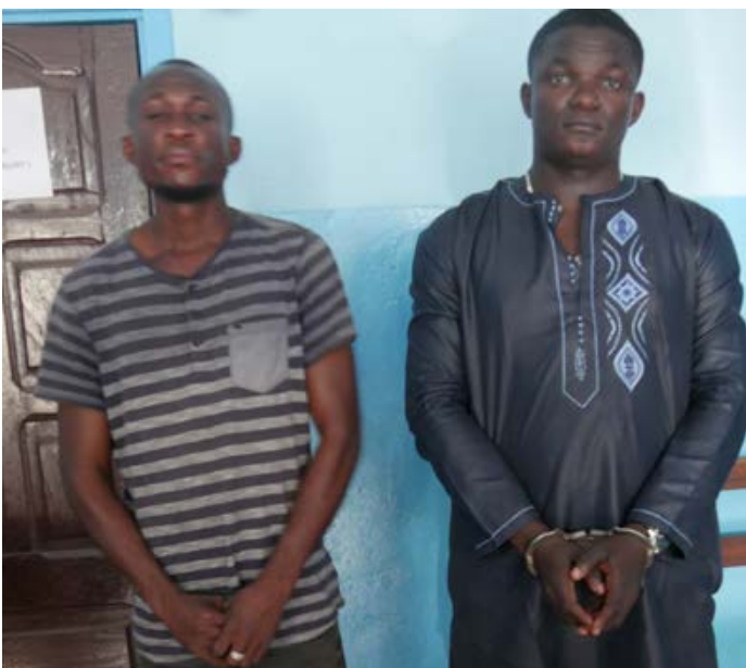
2 traffickers, one of them a corrupt military officer, arrested with 28 African Grey Parrots, an Allen’s Swamp Monkey and a Spot-nosed Monkey.