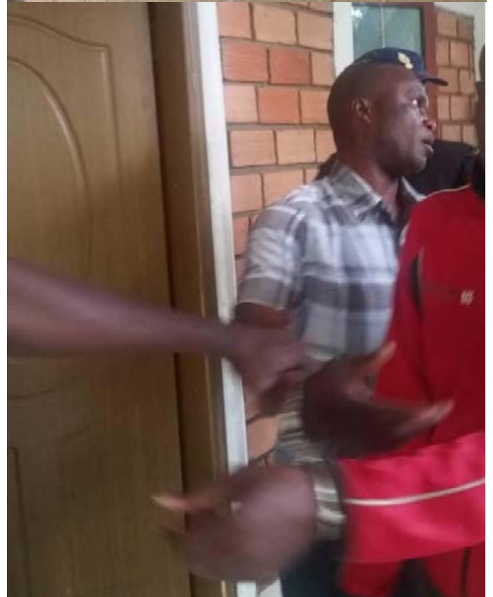
A military man arrested with live mandrill