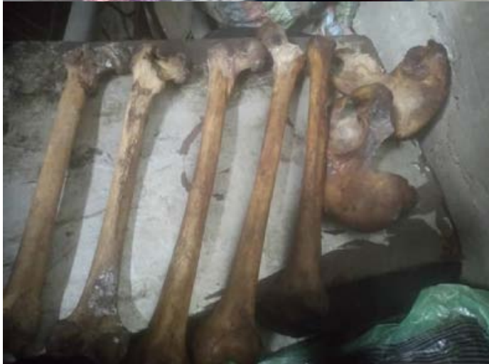
2 human bone traffickers arrested.