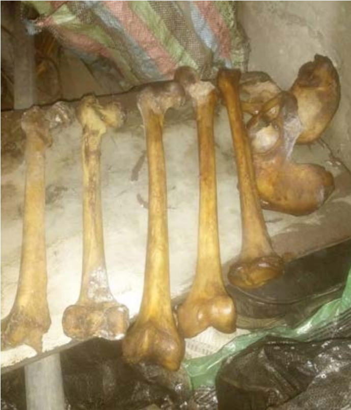
2 human bone traffickers were arrested in the Republic of Congo.

2 human bone traffickers were arrested in the Republic of Congo. 2 others on the run, one of them a corrupt police officer, after pulling out guns during the arrest. PALF and all the EAGLE network projects, as activists, do our best to fight any injustice to our ability. Human sacrifice and illegal trade in human parts for black magic is one of such horrible problems.