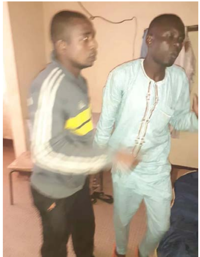
2 ivory traffickers, one of them a repeat offender, were arrested with 2 tusks weighing 20kg in Cameroon.

An ivory trafficker arrested in the Republic of Congo with two tusks. He transported the contraband by boat and bus from Likouala, where the elephant was massacred.