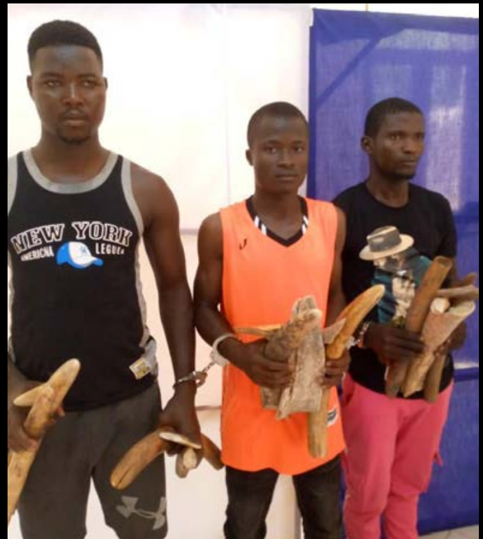
3 traffickers arrested with 8 elephant tusks and some pieces of ivory in Togo