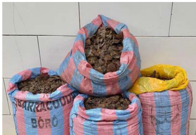
3 traffickers arrested with 110kg of pangolin scales in Côte d'Ivoire.

in Cameroon) and camped there holding our investigator captive, refusing to cross over from the wild and lawless side of the river. It needed tremendous courage and initiative of our Head of Operations to cross the river on a canoe and confront the trafficker saving our investigator from possible kidnap or harm.