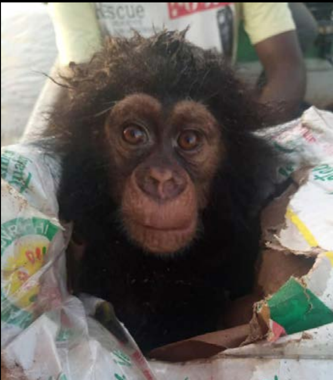
A trafficker arrested with a baby chimp in Cameroon.