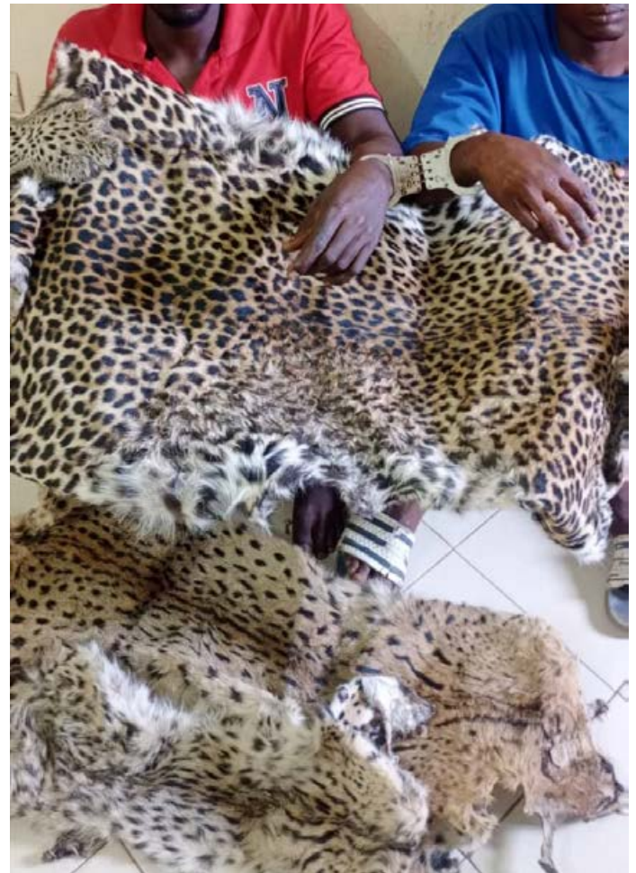
2 traffickers, including a Guinean national, arrested in Senegal with a leopard skin, hyena skin, and two serval skins

2 traffickers, including a Guinean national, arrested in Senegal with a leopard skin, hyena skin, and two serval skins in an action against cross border trafficking between the two countries. When they arrived the scene of transaction and as police closed in on them, they dropped the bag containing the contraband. One of them took to his heels and tried to escape but was chased down by the arresting team who soon rounded him up.