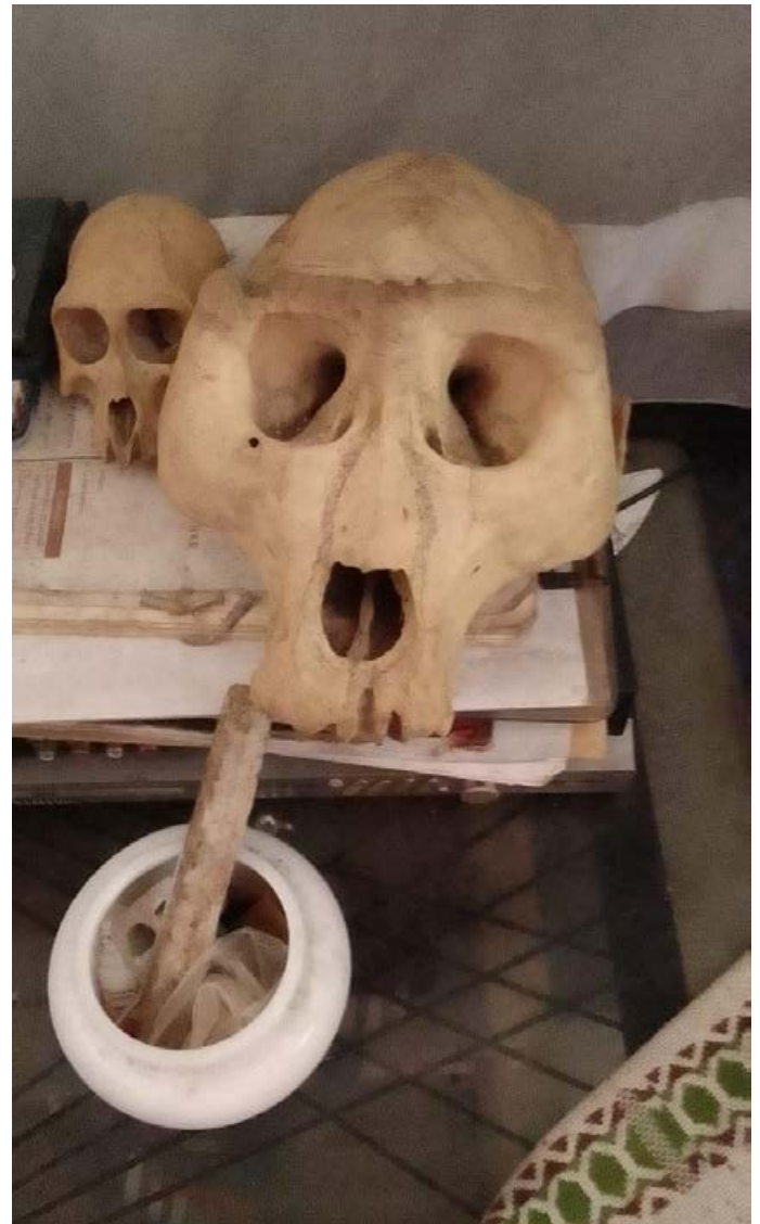
2 traffickers arrested with 7 elephant tusks, a leopard skin and a gorilla skull in Congo.