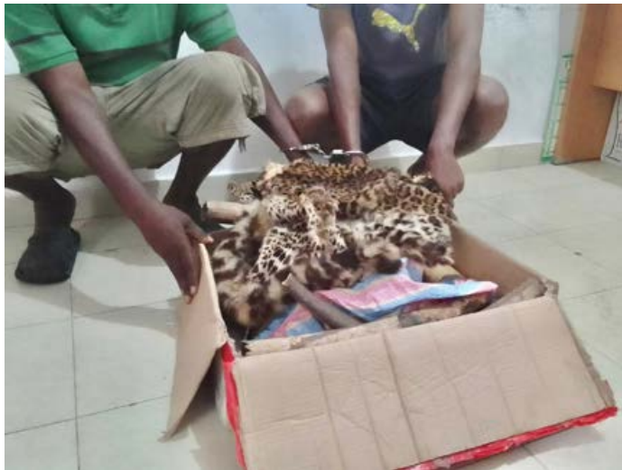
2 traffickers arrested with 7 elephant tusks, a leopard skin and a gorilla skull in Congo.

2 traffickers arrested with 7 elephant tusks, a leopard skin and a gorilla skull in Congo. The contraband that was concealed in cardboard boxes was transported in a cab to the place of transaction by the traffickers. While in the cab and like professional traffickers, they carried out a thorough inspection of the place of transaction before alighting. They were anxious and nervous. They were arrested during an attempt to sell the contraband.