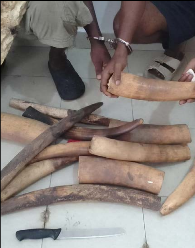
2 traffickers arrested with 7 elephant tusks, a leopard skin and a gorilla skull in Congo.