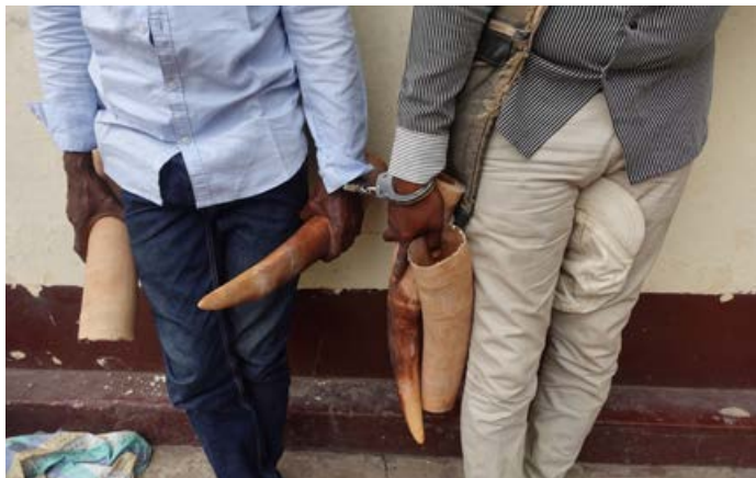
2 traffickers arrested with 2 elephant tusks in Congo.

2 traffickers arrested with 2 elephant tusks in Congo. The experienced traffickers worked together in a simple plan to sell the ivory. The first trafficker who was supposed to sell the ivory, was arrested during his attempts. An interrogation was carried out immediately after the arrest. He revealed the identity of the other trafficker and a follow up mission led to his arrest.