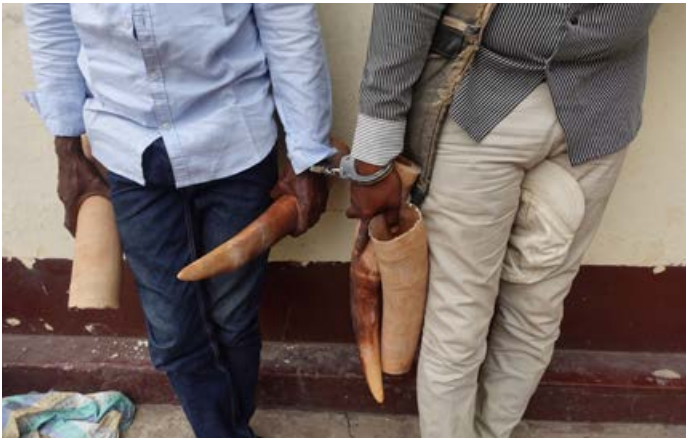
2 traffickers arrested with 2 elephant tusks in Congo.

tivity of the other trafficker and a follow up mission led to his arrest. The tusks were hidden in a rice bag which was transported on foot by one of the traffickers, to the place of transaction. He kept a close watch of his surroundings.