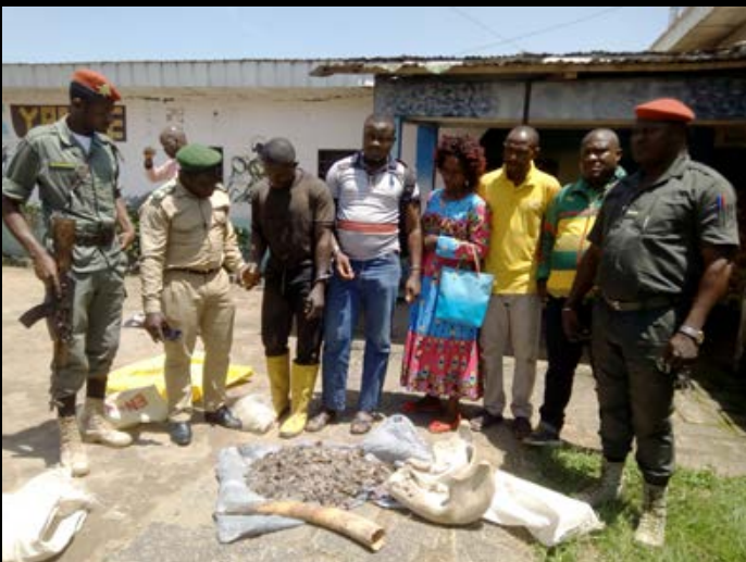
4 traffickers were arrested with an ivory tusk, pangolin scales and elephant bones in Cameroon