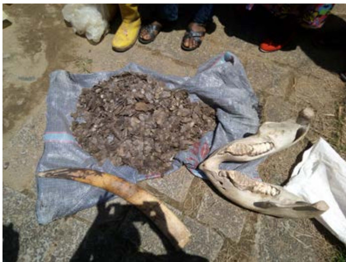
4 traffickers were arrested with an ivory tusk, pangolin scales and elephant bones in Cameroon

■ 3 traffickers arrested with 35kg of pangolin scales at the East of the country. First two traffickers were arrested with a bag containing the pangolin scales and were taken to the gendarmerie brigade alongside two bikes they had used for transporting the contraband. The third one escaped leaving behind his bike. When he realized that the bike had been impounded, he arrived to