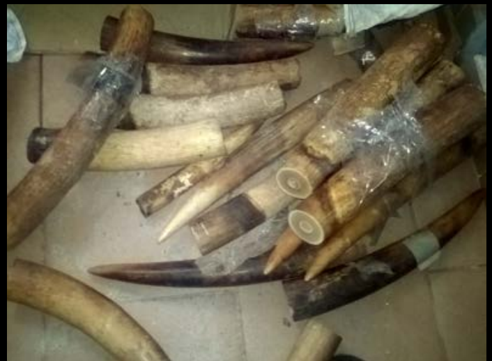
4 ivory traffickers were arrested in Gabon with 27 kg of ivory, one of them a Nigerian trafficker, a head of a large ivory trafficking ring, another one a corrupt gendarme at the Naval Brigade,