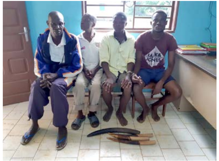
4 ivory traffickers, one of them a notorious Nigerian trafficker, arrested with 4 tusks in the North-East of the country.

African Republic to meet with WWF, WCS, and African Parks, where he discussed cooperation in fighting wildlife crime. He also spent several days in Brazzaville and to supported PALF project in management.