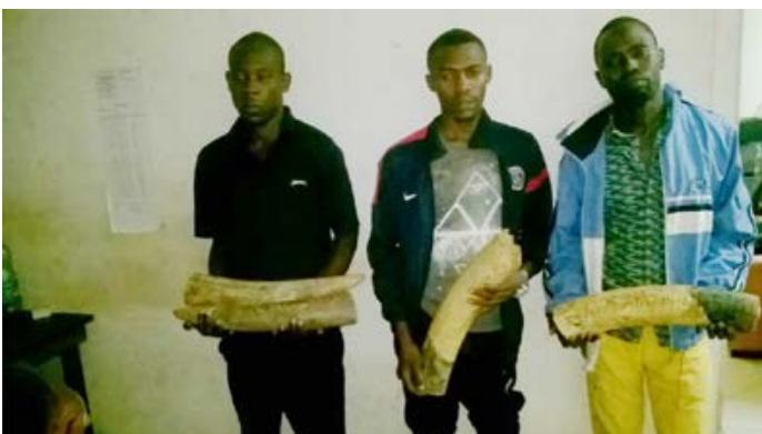
3 traffickers arrested with 2 ivory tusks, one of them Nigerian, in the East of the country.