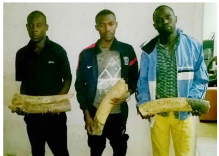
3 traffickers were arrested with 2 ivory tusks, one of them Nigerian, in Gabon

5 ivory traffickers, arrested in January 2018 in Congo, were prosecuted. 3 of them were sentenced to 3 years in jail, while the two others to 1.5 year suspended. 2 ivory traffickers, arrested in February 2018 in Congo, one of them former military officer, were prosecuted and sentenced to one year in jail both.