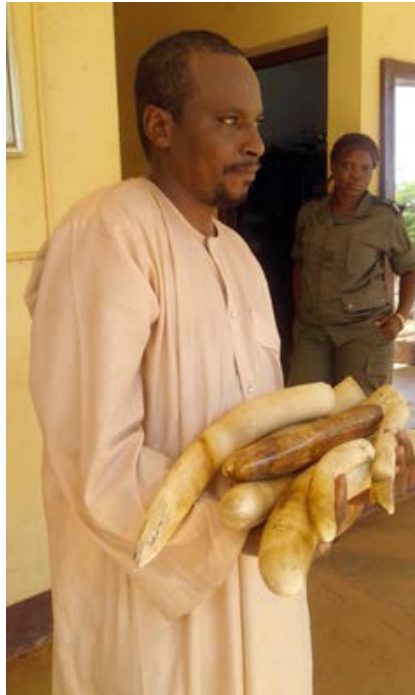
An ivory trafficker was arrested with 7 ivory tusks and hippo teeth

■ 4 traffickers arrested with an ivory tusk, pangolin scales and elephant bones. They used motor-bikes to transport the contraband as it is very flexible and easy to use for escape when threatened. They were arrested shortly after they began negotiations to sell the contraband, originating from the Santchou wildlife reserve that has been depleted of its wildlife resources and now is in a very bad state. One of the traffickers has been known by the conservator of the reserve as a major target for arrest. He was very alert and attempted to escape when he realized the team was moving in for the operation.