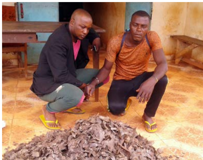
3 traffickers were arrested with 35kg of pangolin scales at the East of Cameroon.

13 ivory traffickers were arrested in 4 operations in Gabon including a corrupt gendarme. 4 ivory traffickers were arrested at a coast town on the South of the country. First a Nigerian trafficker was arrested during an attempt to sell 27 kg of ivory. As a head of a large ivory trafficking ring operating in coastal area he had been in a target of investigations for several months. He denounced three more criminals, including a corrupt gendarme at the Naval Brigade, who was providing poachers with ammunition. A logging company officer was arrested trafficking two tusks in the centre of the country. An ivory trafficker was arrested with 2 ivory tusks, elephant hairs and leopard teeth. 3 traffickers were arrested with 2 ivory tusks, one of them Nigerian, in the East of the country. The Nigerian trafficker, well known to authorities as a long-term criminal, was arrested in a hotel room when he was waiting for his client. He quickly denounced two more traffickers involved in the case, they were arrested afterwards in their houses. 4 ivory traffickers were arrested with 4 tusks in the North-East of the country. First of them, a notorious Nigerian trafficker, was arrested in the act with the contraband. After arriving to the police station, he denounced three other traffickers involved in the illegal activity.