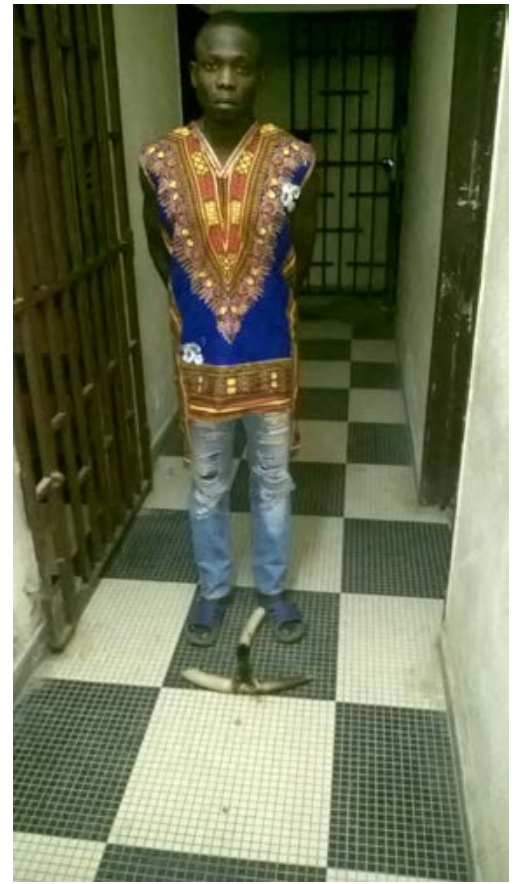
A logging company officer arrested trafficking two tusks in the centre of the country.

during an attempt to sell the contraband, which was concealed in his backpack. Later he admitted killing the elephant.