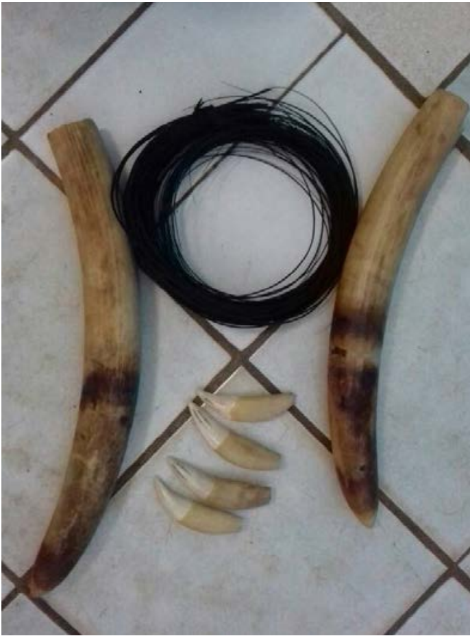
An ivory trafficker arrested with 2 ivory tusks, elephant hairs and leopard teeth.