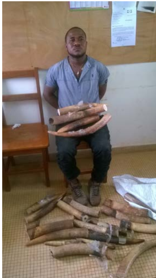
4 ivory traffickers including a corrupt gendarme arrested at a coast town on the South of the country. The Nigerian head of the ring with the contraband

■ 4 ivory traffickers including a corrupt gendarme arrested at a coast town on the South of the country. First a Nigerian trafficker was arrested during an attempt to sell 27 kg of ivory. As a head of a large ivory trafficking ring operating in coastal area of South Gabon he had been in a target of investigations for several months. He was arrested while attempting to traffic a large amount of ivory, concealed in a box. He denounced three more criminals, including a corrupt gendarme at the Naval Brigade, who was providing poachers with ammunition. The two poachers, one of them from Mali, were arrested as well, and more ammunition was found during a house search.