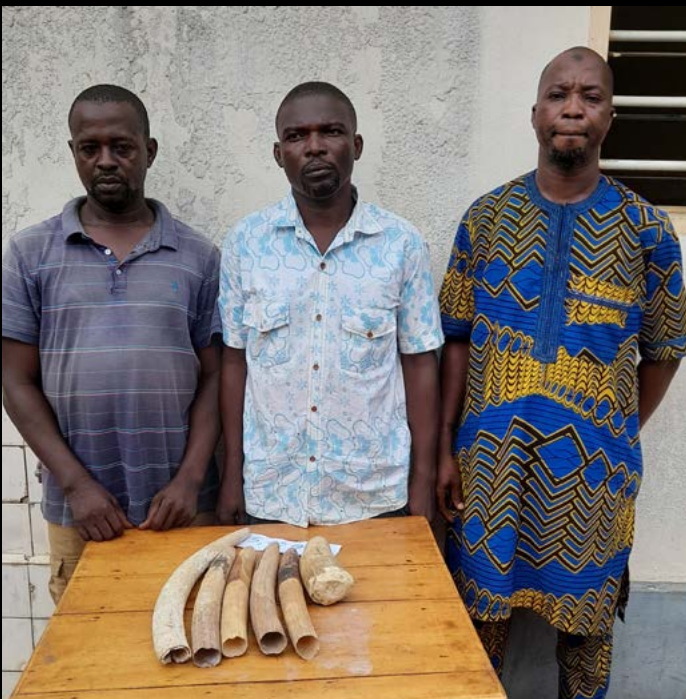
3 traffickers arrested with 6 elephant tusks in Togo