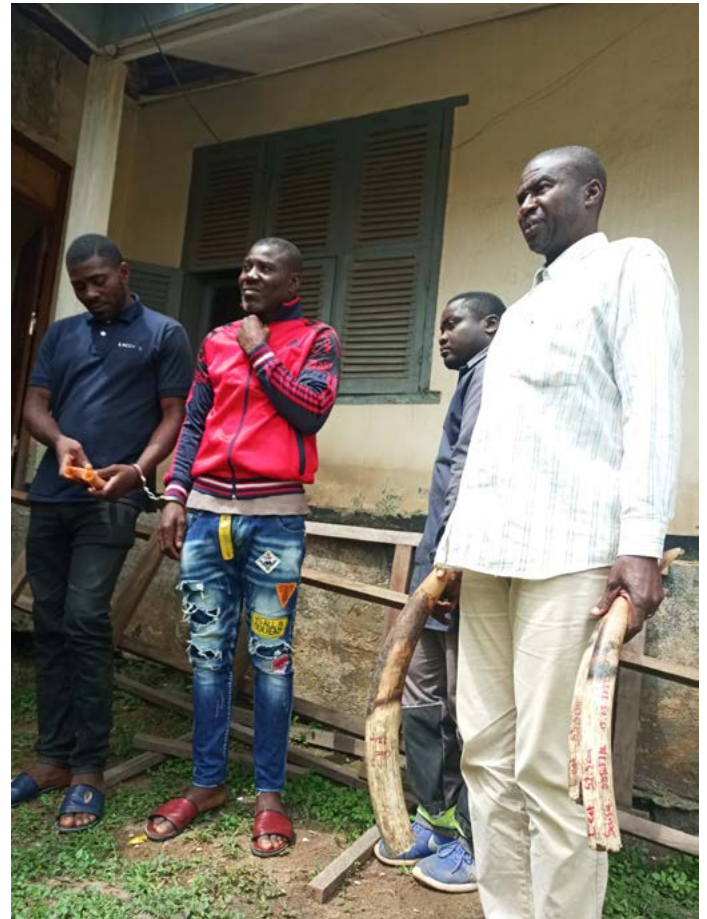
6 traffickers arrested with 5 elephant tusks and chimpanzee meat in a crackdown on a criminal ring in the south of the country.