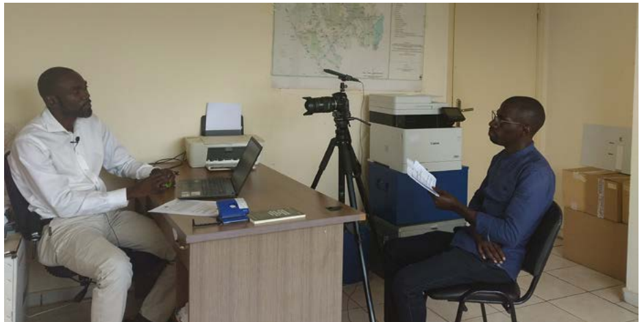
The Activities Coordinator granted an interview to Euronews, an international TV news channel, on wildlife trafficking and law enforcement efforts in Gabon.