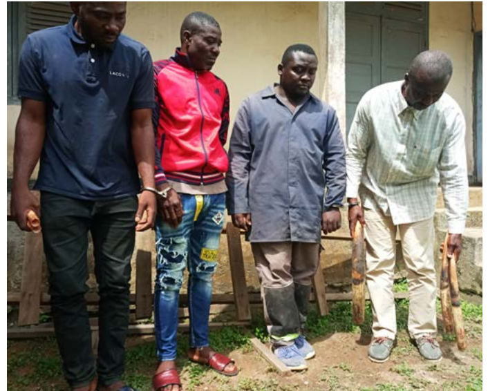
6 traffickers arrested with 5 elephant tusks and chimpanzee meat in a crackdown on a criminal ring in the south of Cameroon.

Burkina Faso by an international trafficking ring. One of the traffickers who is based in Burkina Faso organized the smuggling of the contraband out of the country. In Togo, one of them received the tusks and the others were responsible for selling them. The