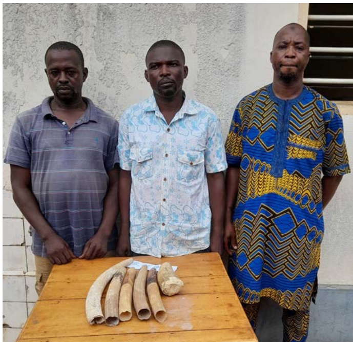
3 traffickers arrested with 6 elephant tusks in Togo.

3 traffickers arrested with 6 elephant tusks in Togo. The elephant tusks were smuggled all the way from