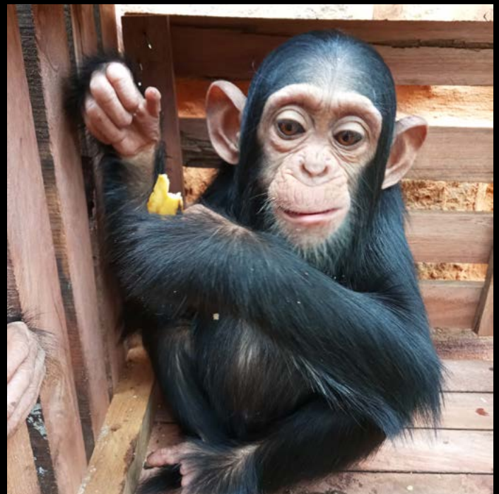
A traditional chief arrested and 2 baby chimps rescued in Cameroon