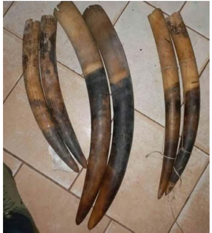
An ivory trafficker was arrested with 6 tusks in Gabon.

4 traffickers were arrested with 20 kg of hippo teeth and skulls and 20 packages of ammunition in Senegal. One of them was already wanted for 18 different crimes. First two traffickers were arrested in the act when trying to sell the hippo ivory, concealed in a rice bag. They were also carrying 5 packs of ammunition of caliber 12. A house search in their village was carried out in an area with high security risk. It was supported by two army units. It led to an arrest