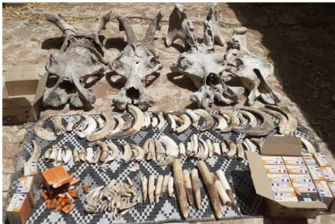
4 traffickers were arrested with 20 kg of hippo teeth and skulls and 20 packages of ammunition in Senegal.