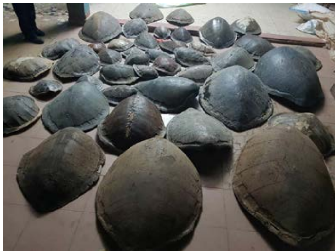
A trafficker arrested with 41 sea turtle shells and 3.5 kg of sea horses.

killing hundreds of them by breaking the shell by a pickaxe to puncture the lungs suffocating them to death. Several of them were Hawksbill Turtles, a critically endangered species. Sea horses trafficking is an overlooked crime, common in coastal African countries. They are sold as souvenirs or trafficked to China where they are sold in the "traditional medicine" business.