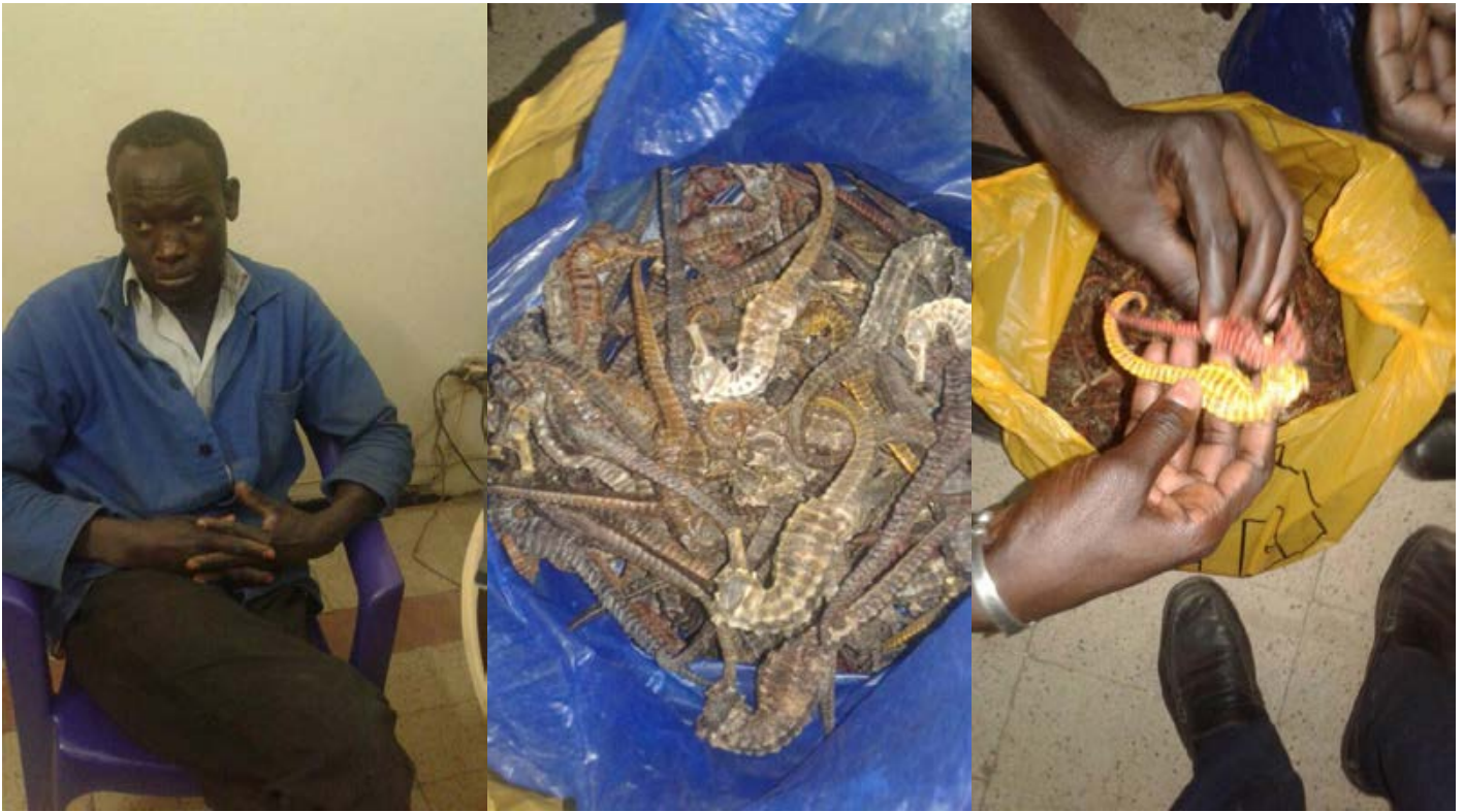
A trafficker arrested with 41 sea turtle shells and 3.5 kg of sea horses.