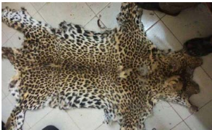
A Guinean trafficker arrested with a leopard skin and 4 skins of bushbuck.

killing hundreds of them by breaking the shell by a pickaxe to puncture the lungs suffocating them to death. Several of them were Hawksbill Turtles, a critically endangered species. Sea horses trafficking is an overlooked crime, common in coastal African countries. They are sold as souvenirs or trafficked to China where they are sold in the "traditional medicine" business.