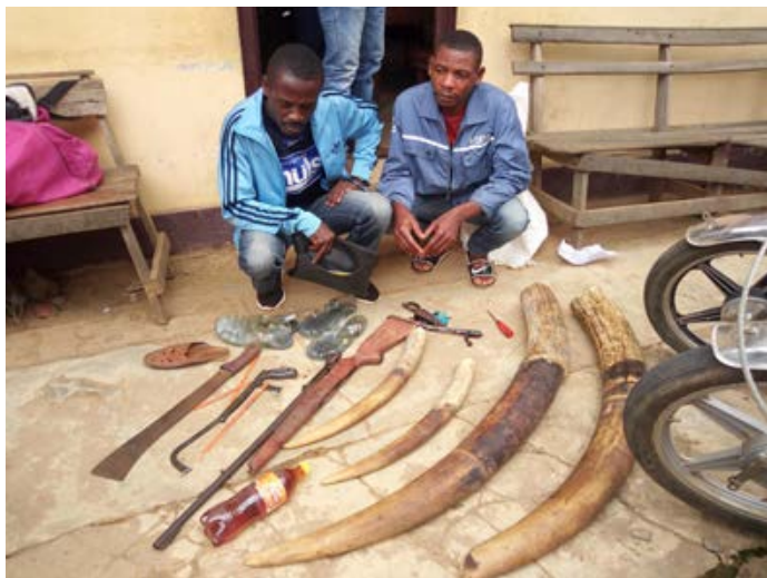
3 traffickers arrested with 4 ivory tusks.