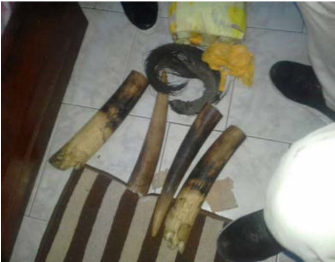
3 ivory traffickers arrested in the capital city with 2 tusks cut to 4 pieces and an elephant tail.