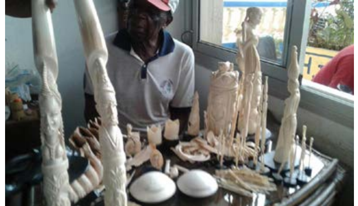
2 traffickers arrested with 121 carved ivory objects,

work principally in the field of GIS, Geography, and data. The aim of the workshop was to come out with a GIS platform that all can use to combatting trafficking and equally participate in providing data for the platform.