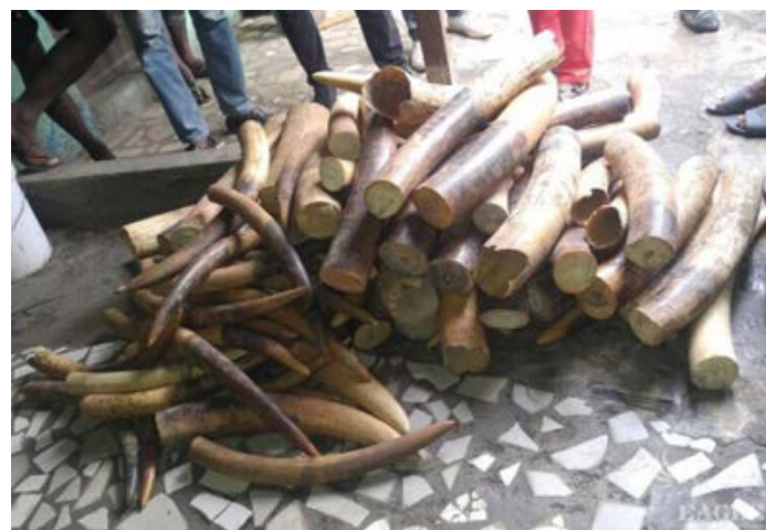
Moussa Ouedraogo arrested, the right hand of Tran Van Tu, the kingpin arrested in January in Ivory Coast for the trafficking of ivory concealed in timber to Asia.