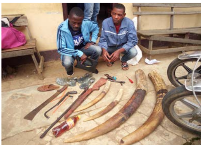
3 traffickers were arrested with 4 ivory tusks in Cameroon

The Ivorian Minister of Water and Forestry signed the Memorandum of Understanding with EAGLE Ivory Coast.