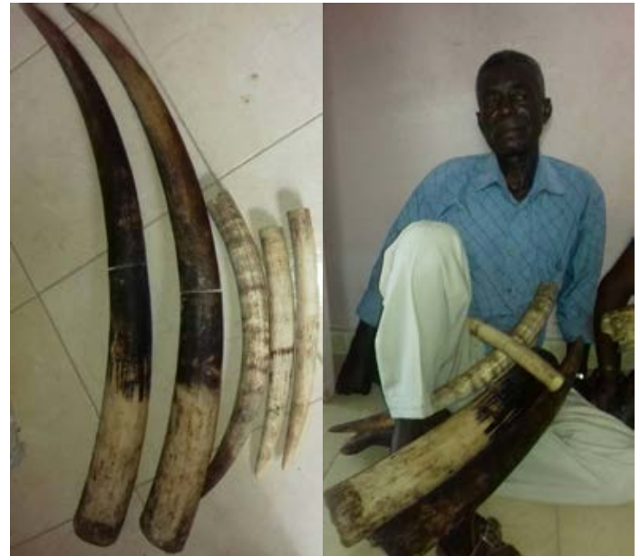
An ivory trafficker arrested with 5 tusks in the west of the country.

he was arrested again and sentenced 1 year in jail. He still has to serve 7 months.