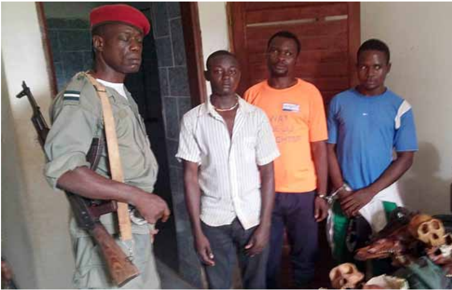
3 ape traffickers arrested, one of them is a notorious ivory trafficker

all kinds of protected species. He differs from the specialized traffickers as he sold various species. Once again fresh chimpanzee heads were recovered pointing to the parallel illicit trade in ape skulls alongside the bushmeat trade in apes.