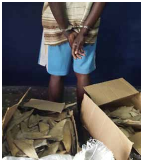
A wildlife trafficker arrested in well organized operation in Gabon's Port Gentile with 65 kg of shark fins.