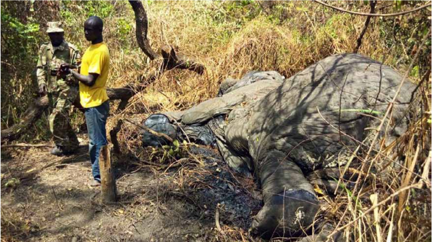
The handcuffed traffickers took the team to the carcass of one of the killed elephants - inside the Karuma reserve.