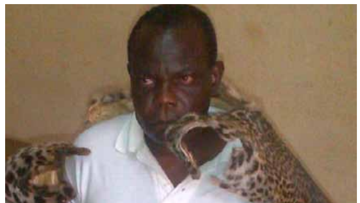
a Beninese ivory trafficker was arrested attempting to sell two leopard skins.