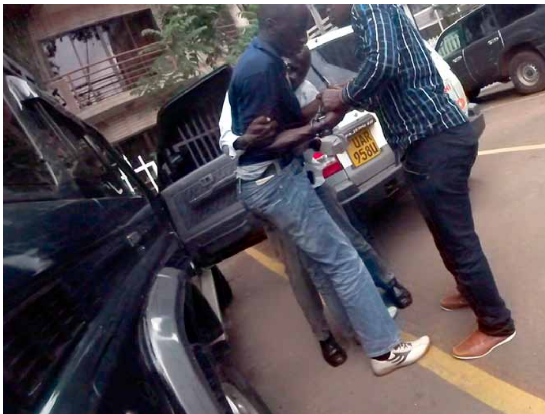
6 ivory traffickers were arrested with 22.5 kg of ivory in Uganda. Two of them, a corrupt Army Major and Army Corporal - both attached to airport authorities were arrested in a swift operation, carried out by EAGLE Uganda team and Police.

A state house bullet proof car with bullet proof vest inside was seized later from one of the military personnel and a sixth member of this ring was arrested. During the operation the Major tried to escape by jump-