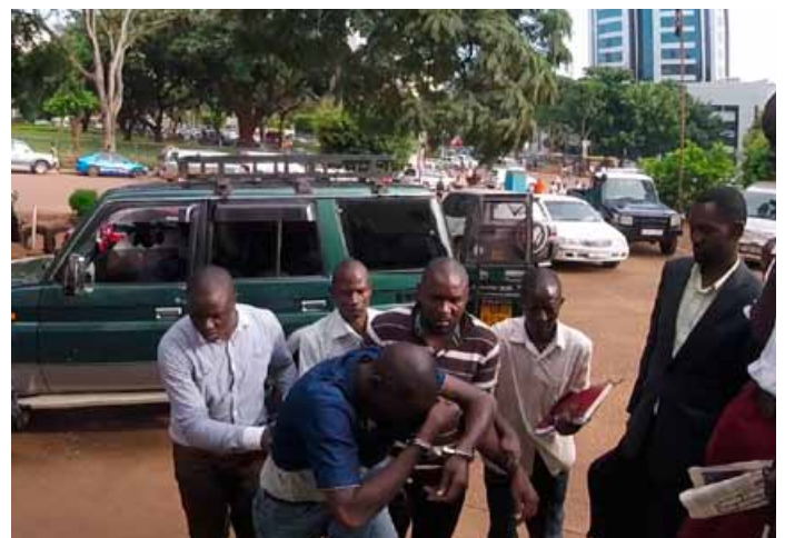
6 ivory traffickers were arrested with 22.5 kg of ivory in Uganda, a corrupt Army Major among them

EAGLE Uganda team and Police. Later 3 more accomplices were arrested - a driver from the presidential state house and a former accountant of the state owned company handling airport luggage among them. This is a landmark case exposing and combating the corruption and complicity that enables the international illegal ivory trade. The sixth member of