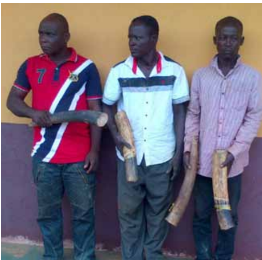
3 ivory traffickers with 15 kg of ivory were arrested