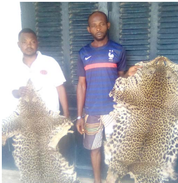
2 traffickers arrested with 2 leopard skins in Congo

They arrived the place of transaction on a motorbike with a suitcase. The skins were concealed under dresses in the suitcase.