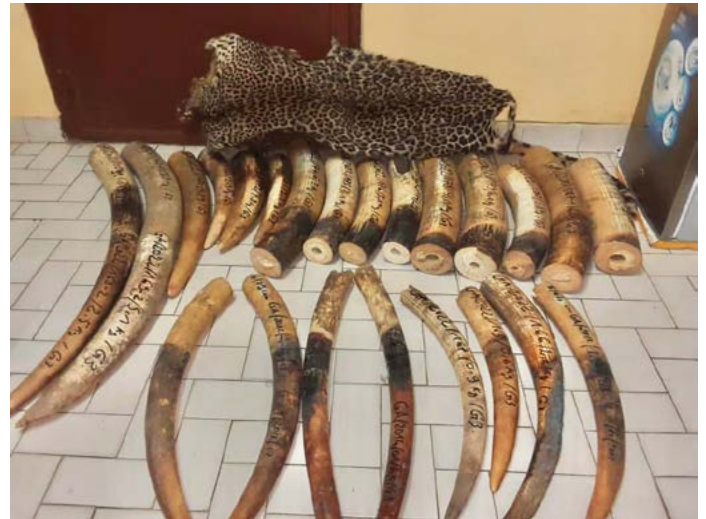
3 traffickers arrested in Gabon with 81 kg of ivory and a leopard skin

2 traffickers arrested with 2 leopard skins in Congo. They were arrested during an attempt to sell them.