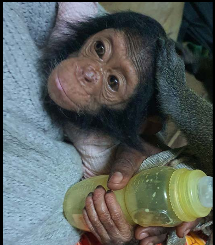
A trafficker arrested in Gabon with a baby chimpanzee and a moustache guenon