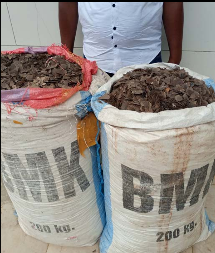
2 traffickers arrested in Côte d'Ivoire with 153 kg of pangolin scales