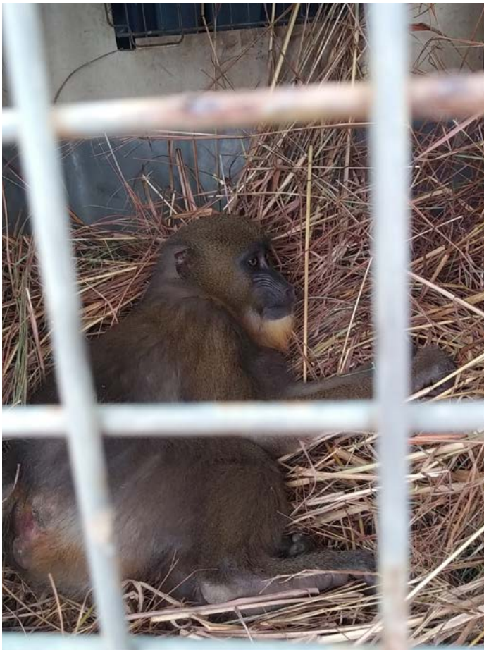
A mandrill rescued. She had been living in terrible conditions, in a very small cage, for at least a year ↓ →