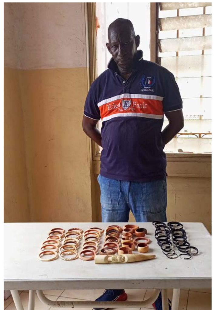
A trafficker arrested with 35 ivory bracelets, 20 elephant tail bracelets and a tiny tusk in Senegal