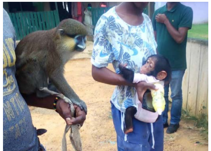
A trafficker arrested with a baby chimpanzee and a moustache guenon