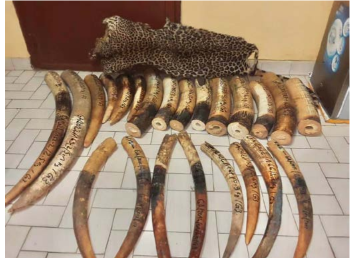
3 traffickers arrested with 81 kg of ivory and a leopard skin

shotgun, to be presented to a State Council in Libreville.