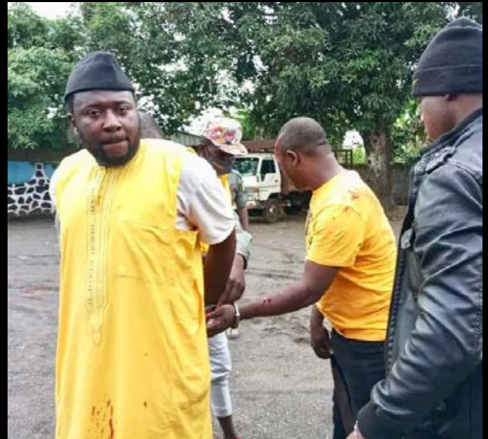
2 human bones traffickers were arrested in Cameroon.