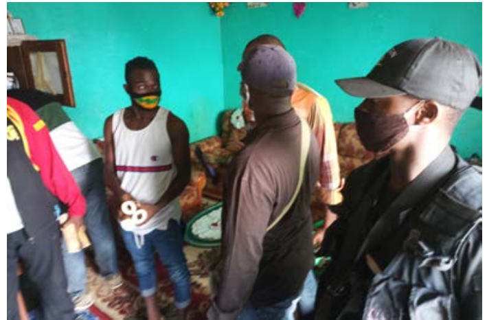
2 traffickers arrested in the East of the country with 2 ivory tusks.

are a part of a network stretching to CAR and connected to Congo.