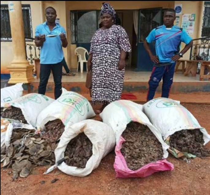
3 pangolin scales traffickers were arrested in Cameroon with 380 kg of pangolin scales