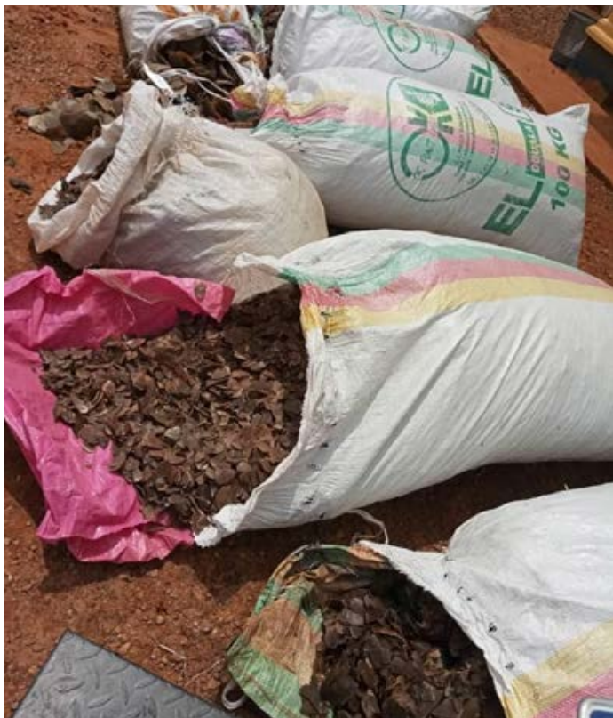
3 pangolin scales traffickers were arrested in Cameroon with 380 kg of pangolin scales