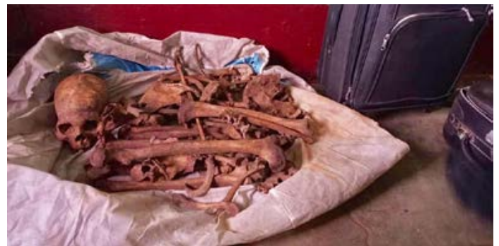
2 human bones traffickers were arrested in Cameroon.

discovery of a network of human bones traffickers and arresting 2 members of the ring with almost two full human skeletons packed inside two suitcases. This is the second crackdown on a separated ring of human bones traffickers two months in the same town. The two belong to a network that uses internet to advertise their products under code names and search for clients who they claim included clients from abroad. One of the traffickers travelled from Ambam near the South border to the West to carry out the transaction. The three top TV channels in