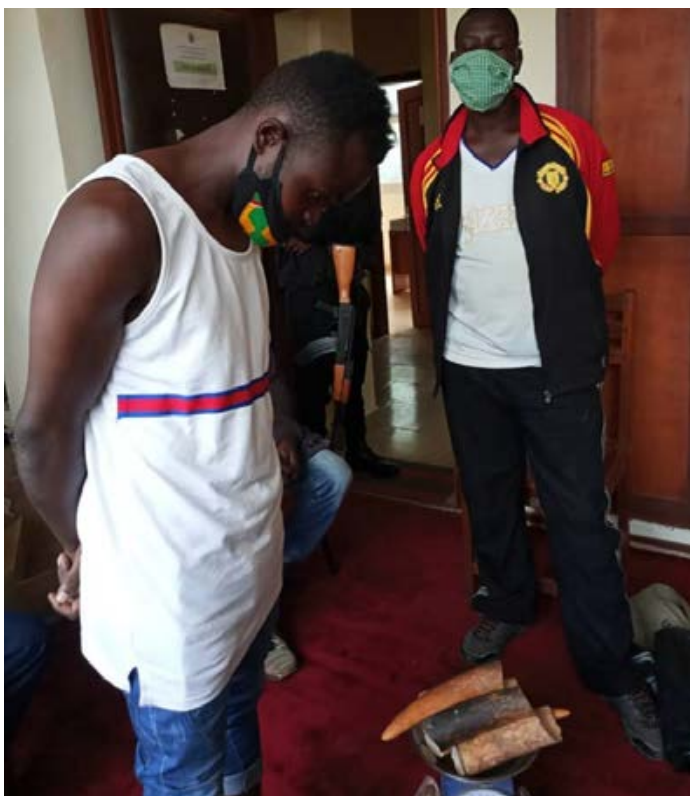
2 traffickers were arrested in Cameroon with 2 ivory tusks

2 human bones traffickers were arrested in Cameroon. Investigations on wildlife trafficking led to the