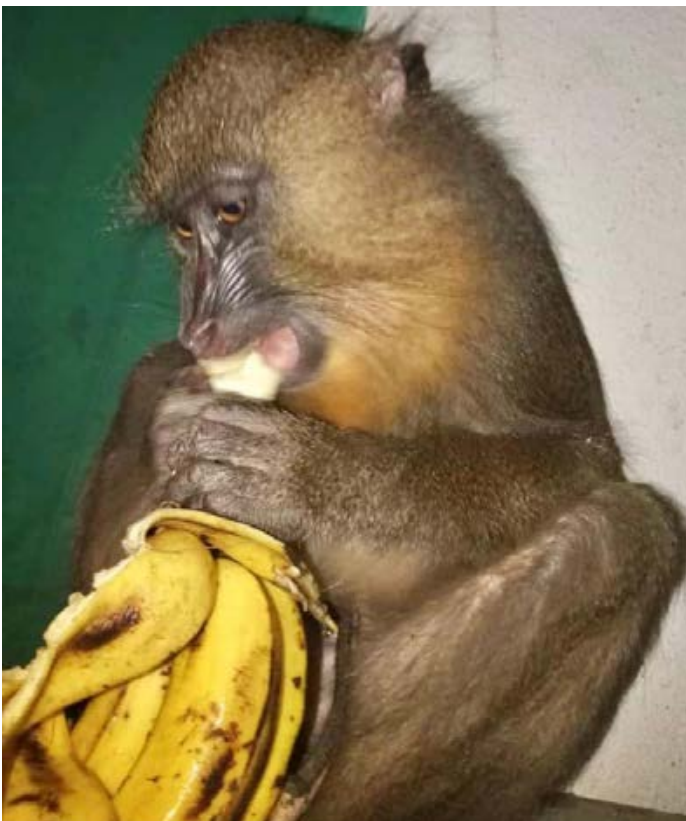
A trafficker arrested and a mandrill rescued. He is a city council worker with connections to high officials in a popular seaside resort town in Cameroon.

and Equatorial Guinea borders raising possibility that some of the contraband is coming in from these countries. This seizure alone represents up to 1 600 killed pangolins (depending on the species).