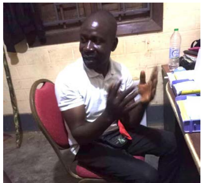
A pangolin scales trafficker arrested with 3 leopard skins and 331 kg of pangolin scales