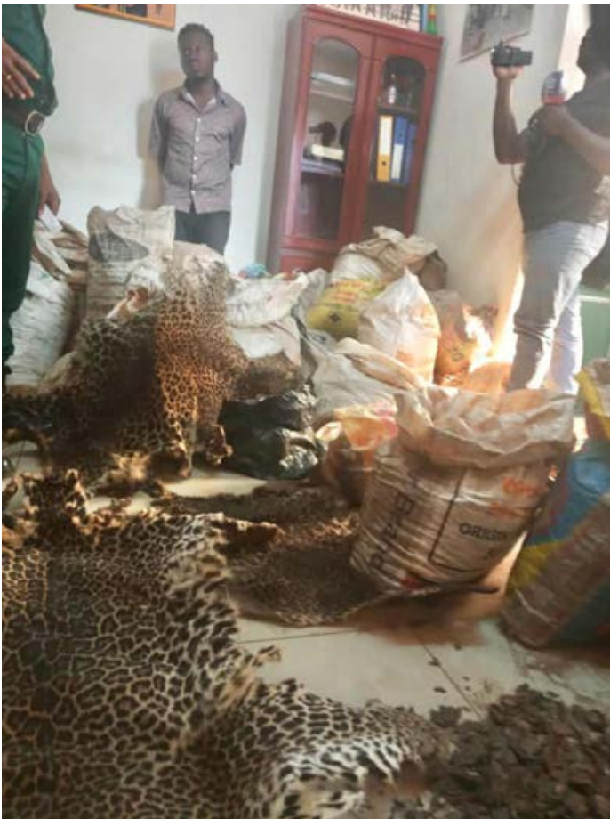
A pangolin scales trafficker arrested in Cameroon with 3 leopard skins and 331 kg of pangolin scales

3 traffickers arrested in Côte d'Ivoire with 2 tusks. The traffickers were arrested in their car on a small discreet street where they were about to carry the transaction. They arrived with the tusks concealed in a bag inside the trunk of the car. They confessed trying to sell the tusks weighing 23 kg to another trafficker who is on the run.