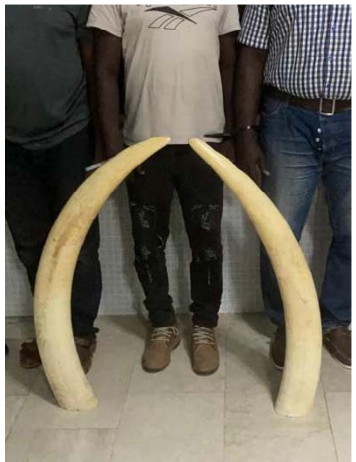
3 traffickers arrested in Côte d'Ivoire with 2 tusks