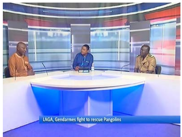
The LAGA Deputy Director (left) during prime time news on the seizure of 331 pangolin scales in Cameroon