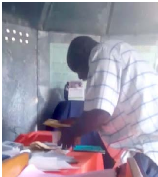
The bribing attempt of public official documented on video