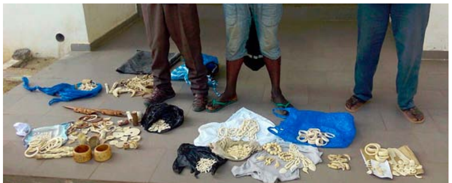
3 ivory traffickers arrested with more than 180 pieces of carved ivory

velopment Officer was prepared for the beginning of the next month to address management gaps, and train the coordinator and the assistant of coordinator in management of the project and intensify the recruitment process.