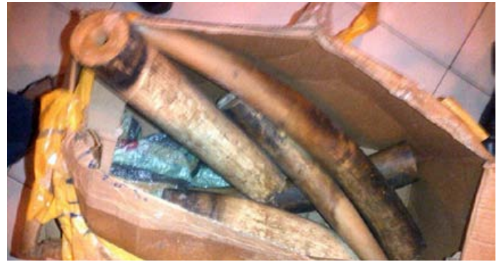
2 ivory traffickers were arrested with 4 tusks