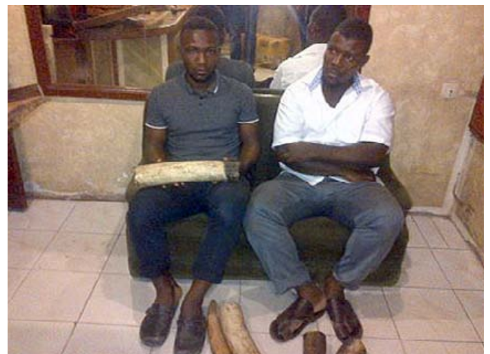
2 ivory traffickers were arrested with 4 tusks