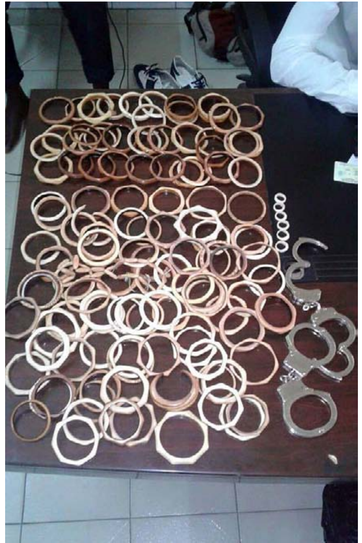
3 ivory traffickers arrested with 135 ivory bangles.