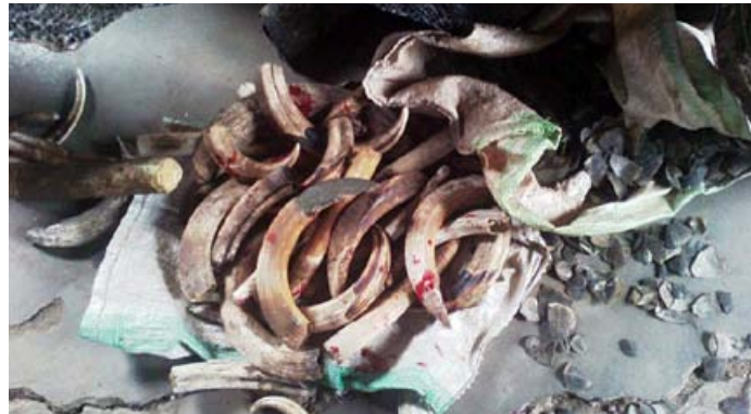
3 traffickers arrested with 25 kg of hippo ivory,

the trafficker. The bribing attempt was documented on video, the official was arrested and will be prosecuted by special anti-corruption court.