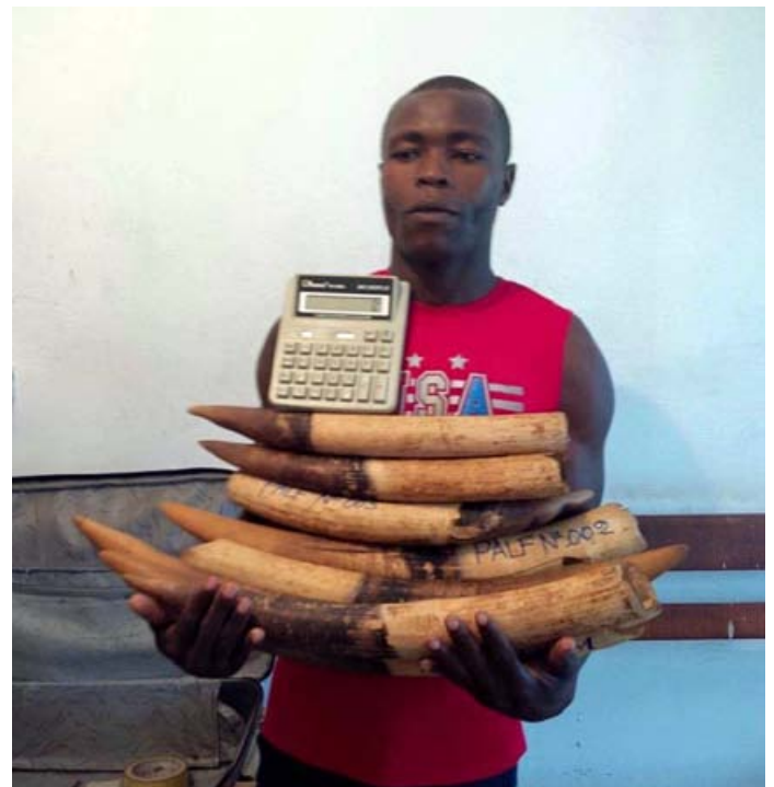
2 ivory traffickers arrested with 8 elephant tusks of very young animals in Congo

3 ivory traffickers were arrested in Benin with more than 180 pieces of carved ivory like bracelets, pendants, combs and medallions. They were arrested in the act during an attempt to sell the contraband in a restaurant in the centre of the town. The traffickers