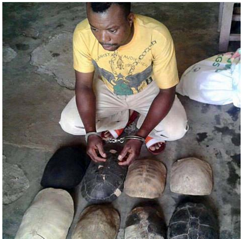
A trafficker arrested with 8 sea turtle shells.