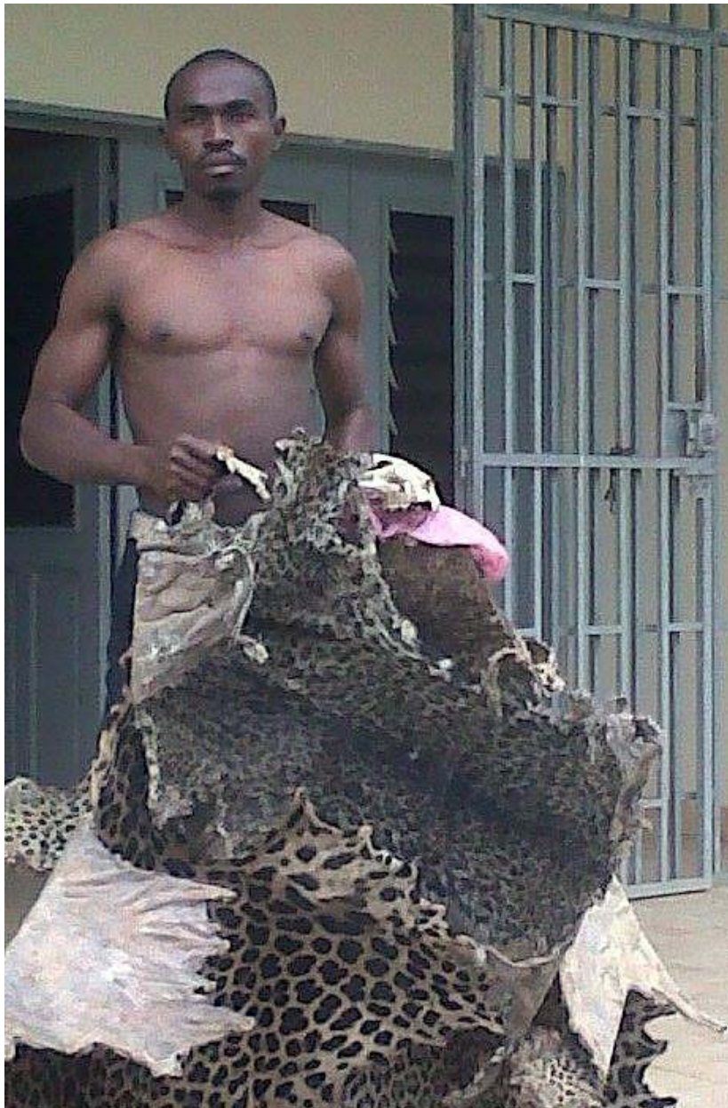
A trafficker arrested in Gabon with 3 leopard skins, a head and 7 teeth