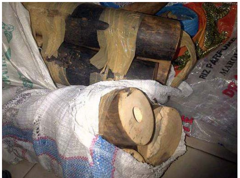
Huge elephant tusks as the ones seized (each weighed about 25 kg) are high value tusks compared to smaller ones and difficult to find them seized.