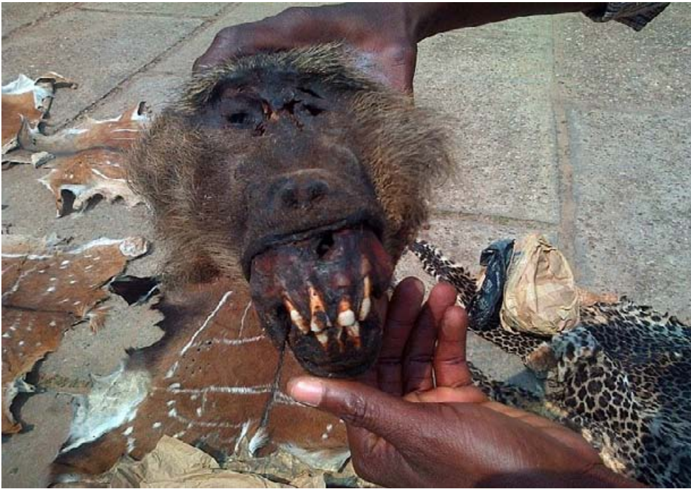
3 wildlife traffickers were arrested with contraband of mainly totally and partially protected wildlife species including baboon heads.

work of the EAGLE Exchange Program, a Gabonese legal adviser trained legal advisers in Benin and two from Guinea. The two Guinean legal advisers were in the country under the auspices of the same programme. The legal department was trained by legal advisor from Gabon together with two legal advisers from Guinea during the first week of July within the EAGLE Network exchange program.