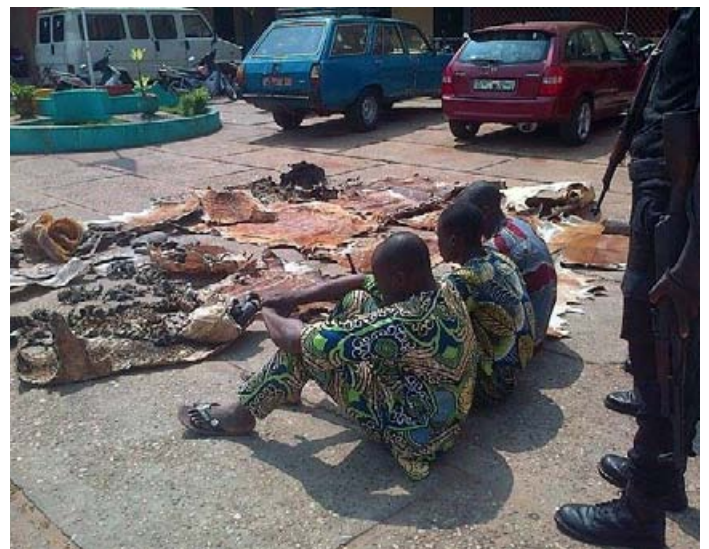
3 wildlife traffickers were arrested with 4 elephant feet, 2 leopard skins and scales of 2 pangolins in Benin.