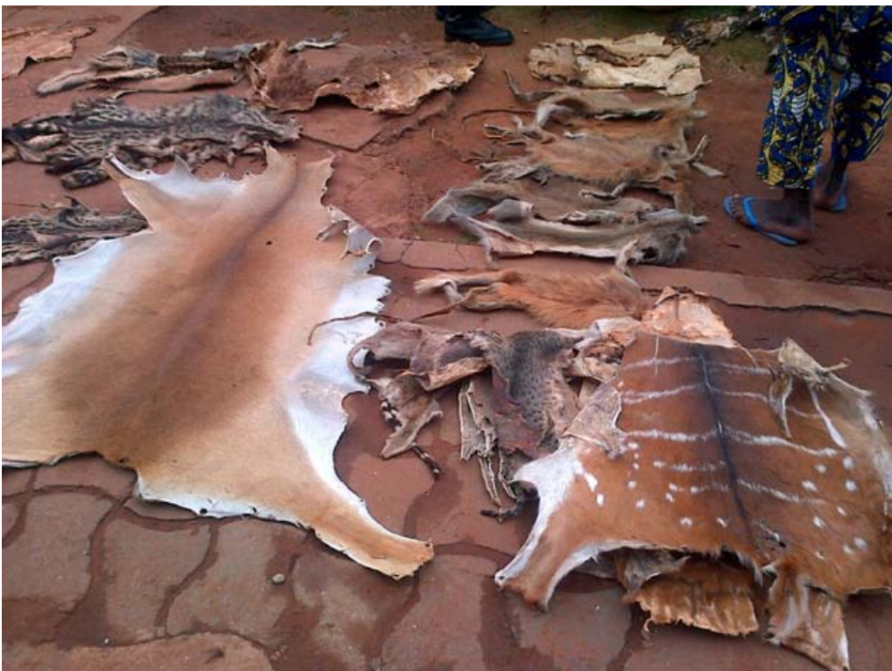
2 traffickers arrested with 15 chameleons, 10 genets skins, 2 python skins and more than 50 antelopes skins, all together more than 175 pieces.