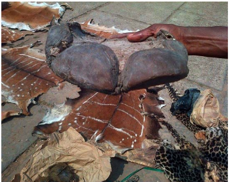
3 wildlife traffickers were arrested with 4 elephant feet, 2 leopard skins and scales of 2 pangolins.