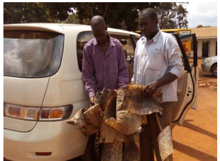
2 traffickers arrested during an attempt to sell seven pieces of python skin and three skins of monitor lizard.