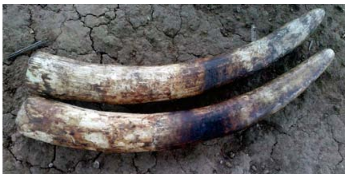
An ivory trafficker arrested with 2 elephant tusks, weighting 4,4 kg.