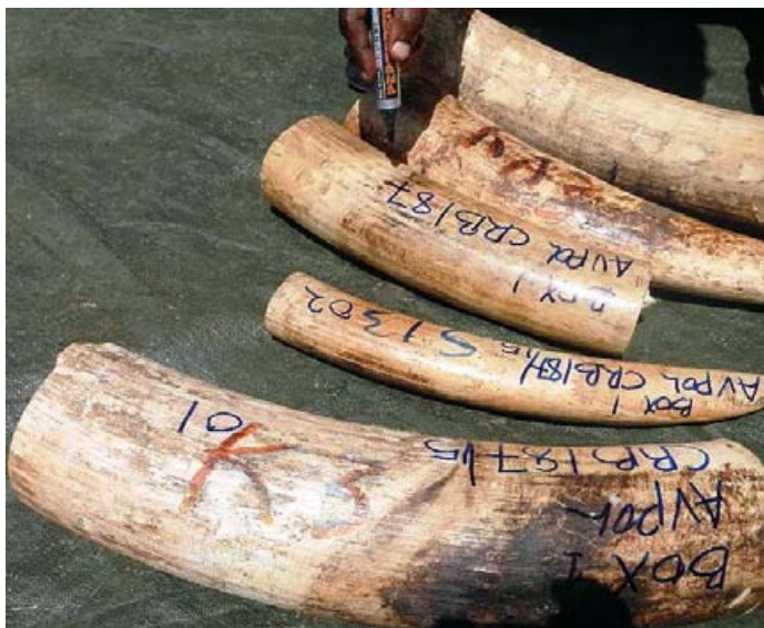
Approximately one tonne of ivory seized at the Entebbe International airport.