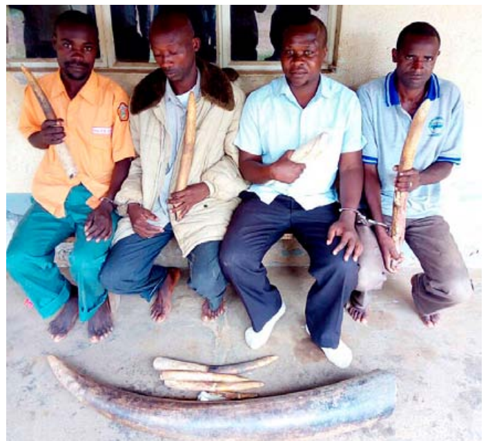
4 traffickers were arrested with one large and 8 small tusks in Uganda

A major trafficker arrested with okapi skin and 2 ivory tusks in Uganda. Having connection to criminal rings in Central and West Africa, he had traded okapi skins in the past highlighting the illegal trade in such an endangered animal. The Okapi, often called "forest giraffe" is an endangered relative of the giraffe that can be found only in Ituri forest in DRC.