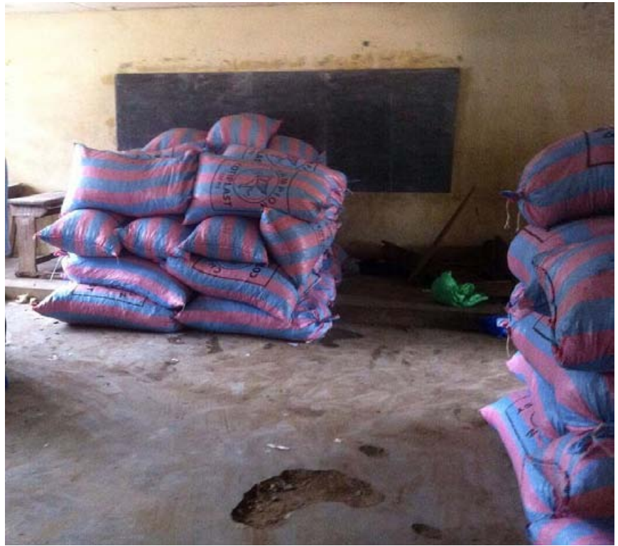
8 traffickers arrested and 3 tons of pangolin scales seized in a crackdown on an international trafficking network. Some of the contraband was concealed in a primary school with the logic that such an innocent location would never be searched.