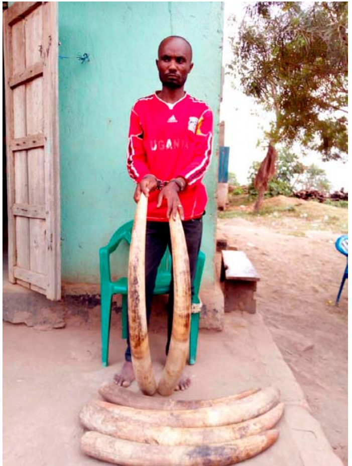
An ivory trafficker arrested with 54 kg ivory in west of the country

■ An ivory trafficker arrested with over 33 kg ivory in West of the country. After several Christian priests arrested, the team got a member of the Illuminate