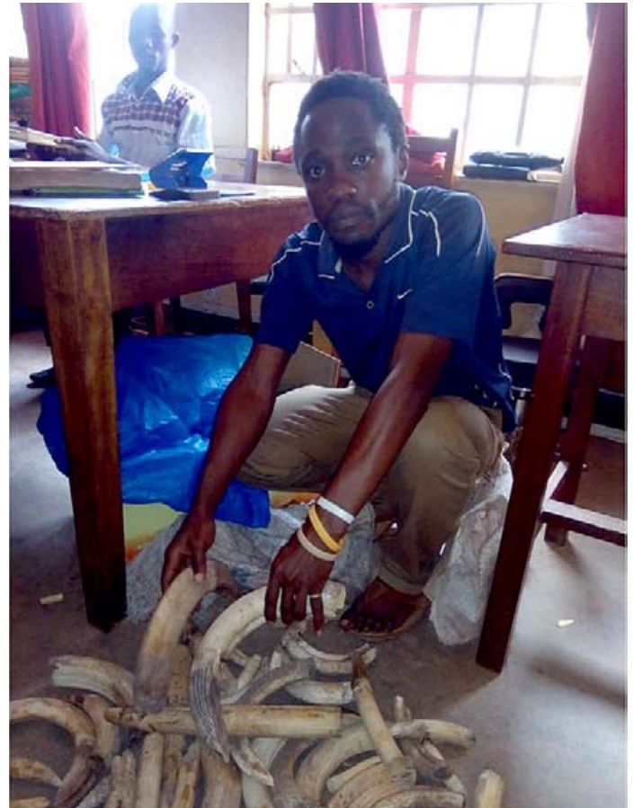
A trafficker arrested with 38 hippo teeth in Kampala.