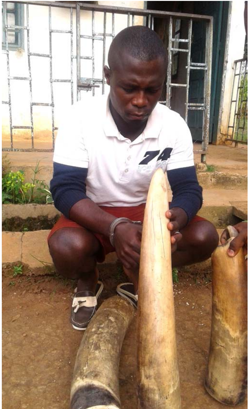
A trafficker arrested with 2 ivory tusks, weighing 18 kg in an area infamous for corruption and complicity between wildlife criminals and local authorities.