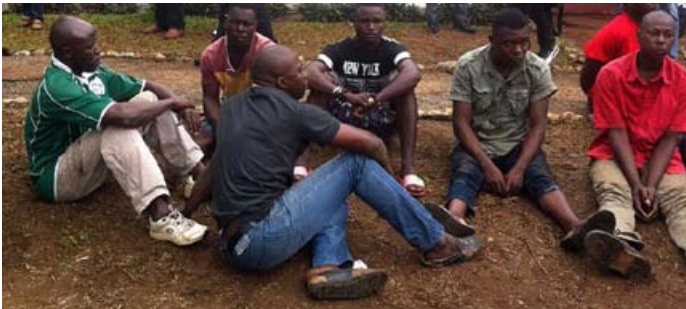
8 traffickers arrested with 3 tons of pangolin scales in Ivory Coast

8 traffickers arrested with 3 tons of pangolin scales in a crackdown on an international trafficking network in Ivory Coast. The young team showed high level of performance giving more hope for the fast development of our latest replication. Investigation continues on international links with at least 6 other countries including China. Some of the contraband was concealed in a primary school with the logic that such an innocent location would never be searched. Thousands of pangolins had to be killed for this shipment alone, and this criminal network was regularly carrying such a magnitude of pangolins' slaughter.