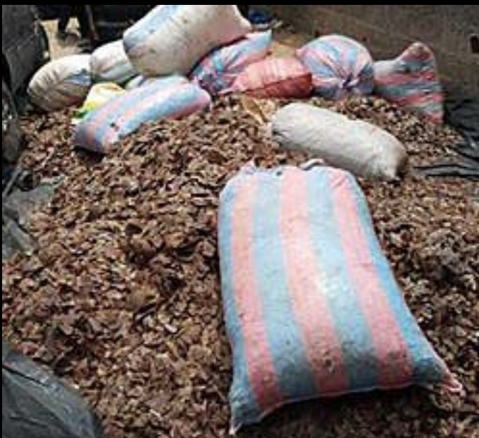
8 traffickers arrested with 3 tons of pangolin scales in a crackdown on an international trafficking network in Ivory Coast.