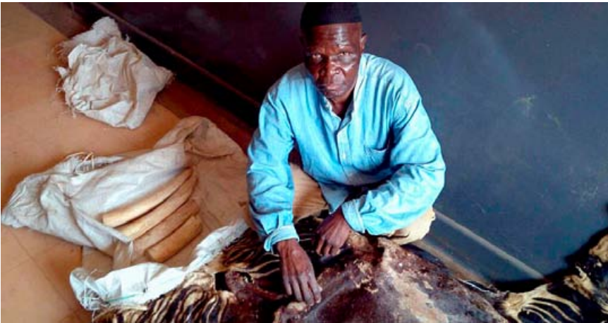
A major trafficker arrested with okapi skin and 2 ivory tusks.

cult. He was regularly trafficking ivory, supplied to him by a corrupt official of UWA. He was already arrested twice for trafficking in wildlife. In 2015 he was arrested and convicted for ivory trafficking, and the same year for providing a hyena liver which was intended to reportedly poison some high ranking government officials.