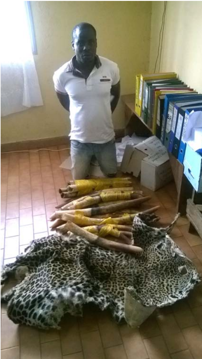
An ivory trafficker arrested with 17 elephant tusks and a leopard skin