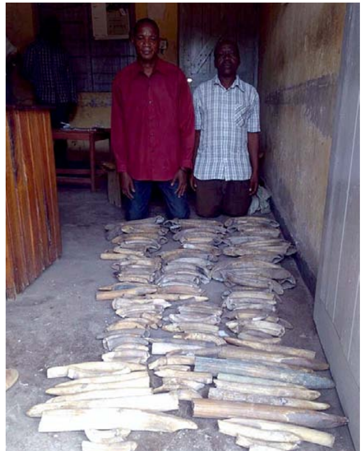
2 traffickers arrested in the West of the country with 140 hippo teeth