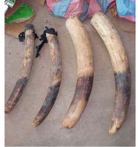
5 ivory traffickers arrested with 4 tusks in northern part of the country.