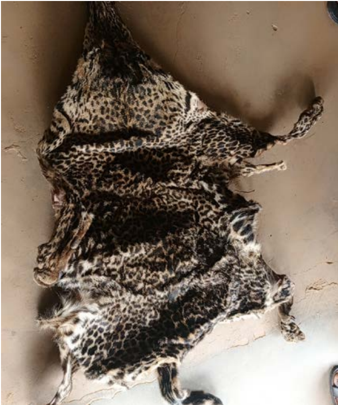
2 traffickers arrested with a leopard skin in Congo.

2 traffickers arrested with a leopard skin in Congo. They arrived the scene of transaction on a motorcycle with one of them firmly grasping a backpack containing a jute bag. On arrival, he removed the jute bag that concealed the leopard skin. He was arrested. He denounced another trafficker at the police station who was later apprehended.