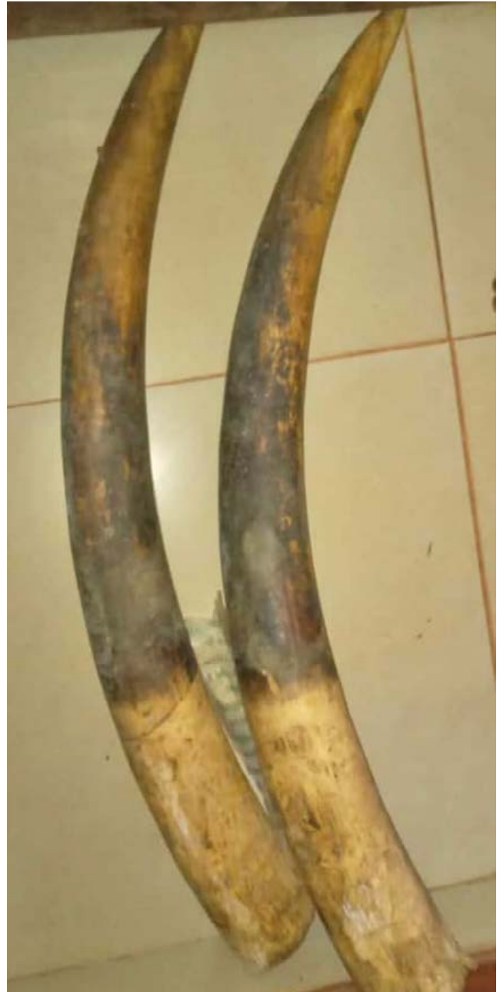
3 traffickers arrested with 2 elephant tusks in Gabon.

3 traffickers, including a Malian national, arrested with 2 elephant tusks in Gabon. Two traffickers were arrested attempting to sell two elephant tusks. On arrival near the place of transaction, they hid a bag containing the tusks to ensure everything was safe before continuing with a deal. They would later go and fetch the bag and were arrested in the act. The Malian national who was not very far from the place of transaction was arrested shortly after, following an interrogation of the arrested traffickers who denounced him. One of the traffickers is a worker in an environmental consultancy firm called Green Consultech. The firm, as guardians of the environment, offers services including legal compliance and environmental impact studies. He apparently used his