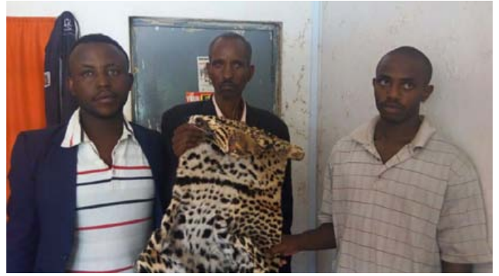
3 Rwandese traffickers crossing the border with a leopard skin were arrested.