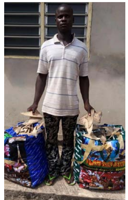
A trafficker arrested with 80 kg of shark fins.

judge of the 7th cabinet of the court of Lome; the Representative of the administration (an official of the National Agency for Environmental Management: ANGE) court in wildlife matters; the Director and the Head of the Operations of OCRTIDB; the representative of INTERPOL and the representative of the West African Development Bank.