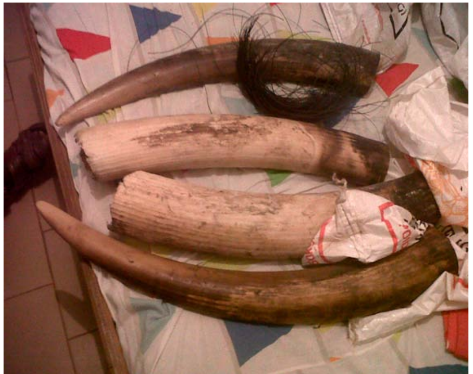
3 ivory traffickers arrested with 40.5 kg ivory in Gabon.