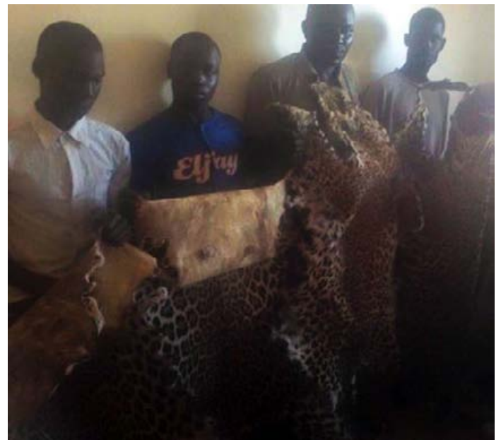
4 traffickers arrested in Uganda with 4 leopard skins, 2 of them corrupt members of different kind of defence forces.

A trafficker arrested in Togo with 80 kg of shark fins. TALFF team and the Togolese authorities done great work in intercepting this Ghanaian based in Nigeria