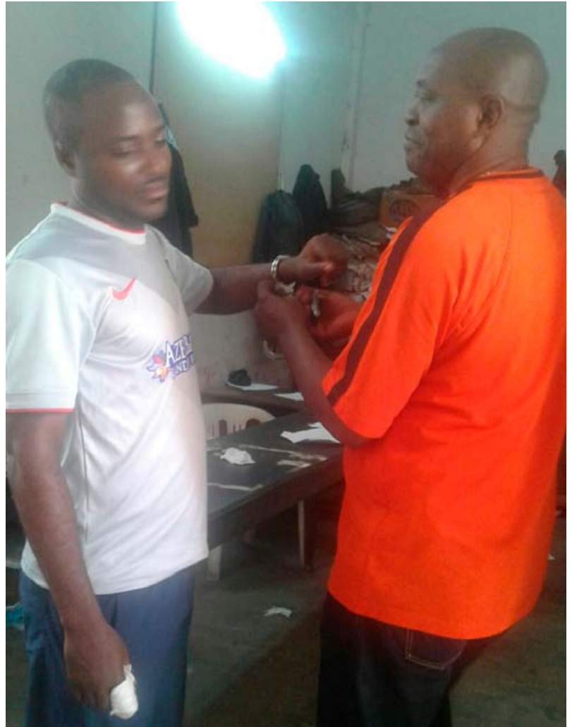
One of the 3 cybercriminals arrested after advertising for sale two lion cubs and two cheetah cubs through the internet.