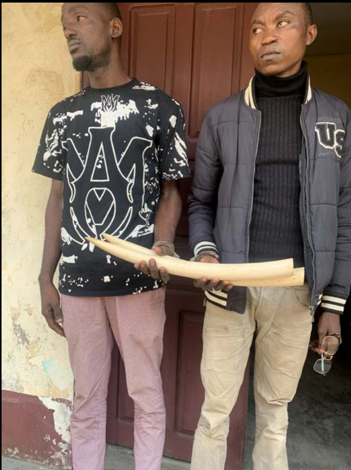
2 ivory traffickers arrested with 2 elephant tusks in Cameroon.