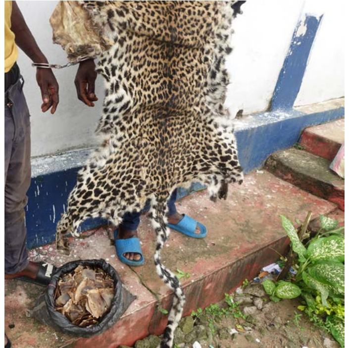
2 traffickers arrested with a leopard skin and scales of giant pangolin in Congo.