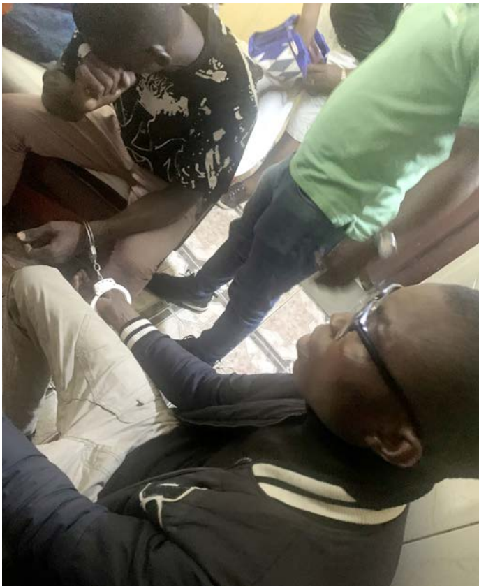
2 ivory traffickers arrested with 2 elephant tusks in Cameroon.

2 ivory traffickers arrested with 2 elephant tusks in Cameroon. One of them is a notorious regional trafficker at the center of criminal networks stretching to Chad, Congo and CAR. He is linked to several illicit activities including trafficking in precious stones and cars, in the sub region. He travelled over 500 km from the north of the country to Douala to organize the illegal trade of the tusks.