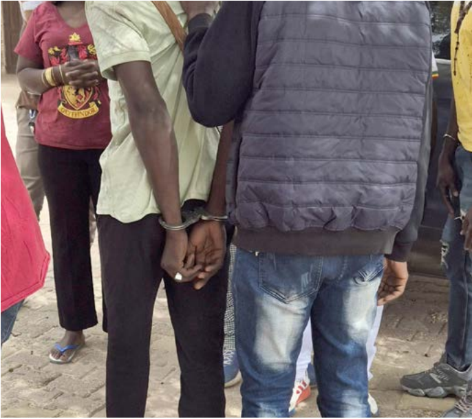
3 live animals' traffickers arrested with 2 young live hyenas in Senegal.

by the illegal trade as mystical animals for black magic. The traffickers travelled 3 hours with the young hyenas and put them in small cages so besides the wounds from the chains they were also wounded at their faces from the bars.