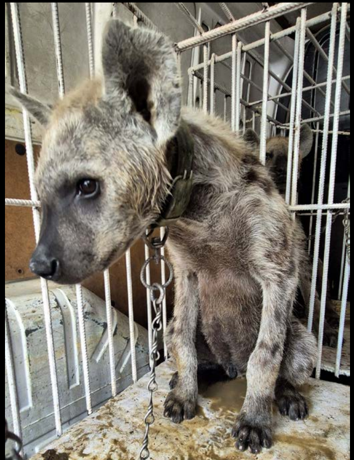
3 live animals' traffickers arrested with 2 young live hyenas in Senegal.