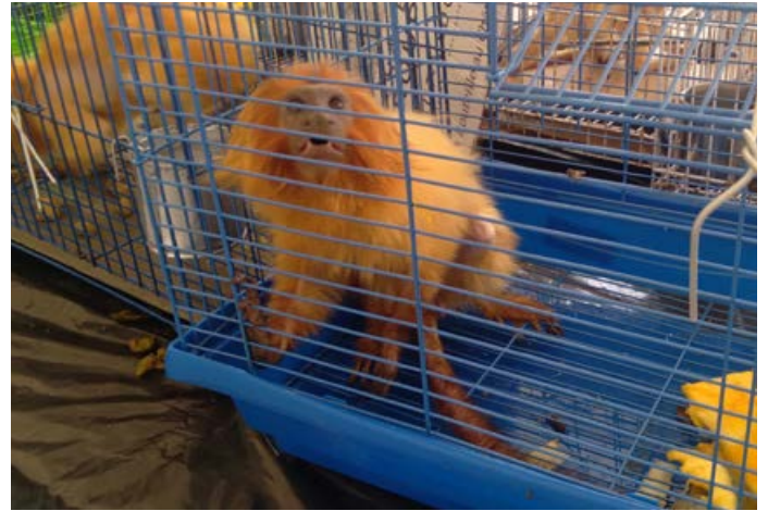
A shipment from Brazil of highly endangered 12 Lear's Macaws and 17 Golden Lion Tamarins on a sailing boat stopped in Togo.

ed of complicity of local wildlife officials. He came by motorcycle with the chimpanzee strapped to his back, and managed to cross safely several road-blocks with the chimp visible. The baby chimp exhibits a post-trauma behaviour pointing to the extreme abuse inflicted on him.