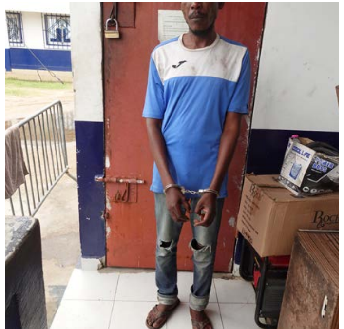
A fugitive ivory trafficker captured in Congo.

A fugitive ivory trafficker captured in Congo. He was wanted in connection to a past arrest operation. The team carried out multiple arrest attempts. Since the trafficker is very well connected with law enforcement, the arrest failed each time as he mysteriously disappeared before being captured. This time, after a year of efforts, he was finally apprehended.