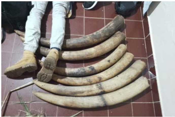
3 traffickers arrested with 6 elephant tusks weighing 33 kg in Gabon.

Following an arrest and seizure by the Gendarmerie, the EAGLE Togo Team assisted in establishing the illegality of the shipment including fraudulent CITES permits from Guyana. The Team also helped with the care for the fragile animals and connected the two sides of the illegal shipment, in constant collaboration with Freeland that coordinated the Brazil side with the Brazilian authorities. The Ministry of the Environment and Forest Resources (MERF) and the Brazilian Ambassador to Togo were integral in saving the animals and in reaching a good outcome. Brazil sent a large governmental delegation to coordinate the investigation, treat the endangered animals and take them back to Brazil.