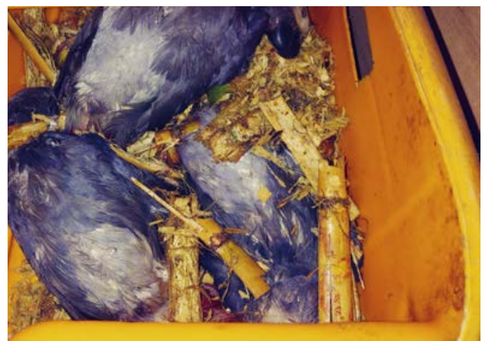
A trafficker arrested in Congo with 94 African Grey Parrots.

A trafficker arrested in connection with ivory trafficking in Congo. The trafficker was on the run after an arrest warrant was issued against him following the arrest of an ivory trafficker in November 2021 with 5 ivory pieces and 3 elephant tails. The Team fought off corruption attempts.