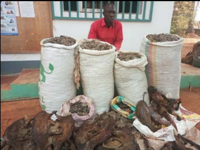
A trafficker arrested in Cameroon with 246 kg of pangolin scales