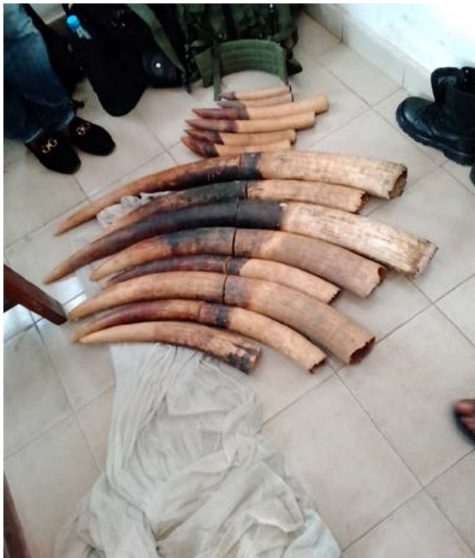
4 traffickers arrested in Congo with 14 elephant tusks.

A trafficker arrested in Cameroon with 246 kg of pangolin scales, and in a refrigerator more pangolins and monkey carcasses found. He activated several traffickers and poachers in the area, who supplied the illegal products. He had the storage facilities for keeping the big quantities of contraband he collected.