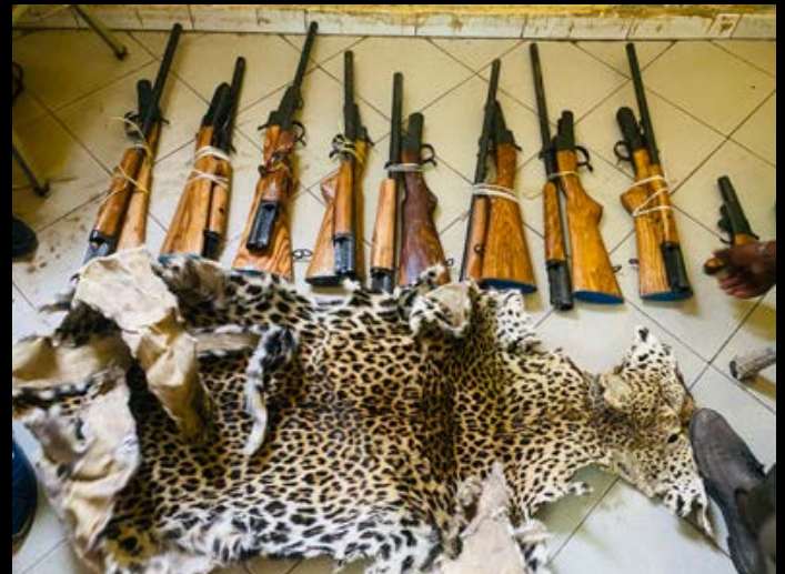
2 traffickers arrested with a leopard skin and nine 12-gauge shotguns in Senegal