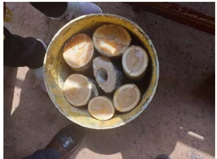
2 ivory traffickers arrested with 2 tusks cut in ten pieces at the East of the country

reas, Provincial Directors of Water and Forests, the Presidents of courts, State Counsels, the Director of Economic and Financial Affairs of the National Police, the Heads of the Judicial Police Units and others.