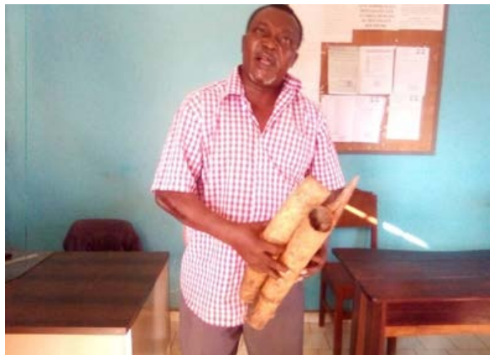
An ivory trafficker was arrested in Gabon with two tusks.

An ivory trafficker was arrested in Gabon with two tusks. He is Beninese, living in Gabon, he has been in the spot of authorities since 2015. He remains behind bars in the capital city awaiting trial.