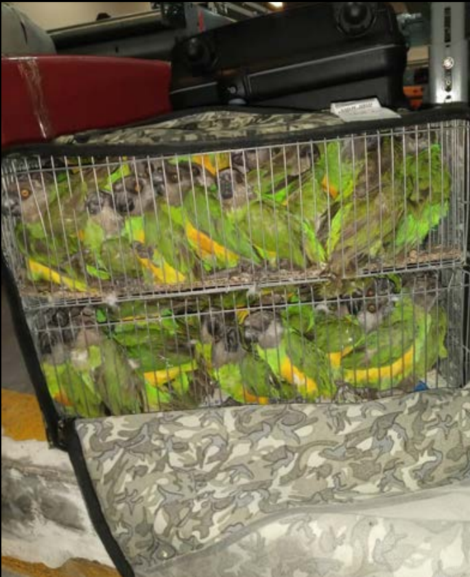
An Algerian parrot trafficker was arrested at the airport in Dakar with 131 Senegal parrots and Rose-ringed parakeets.