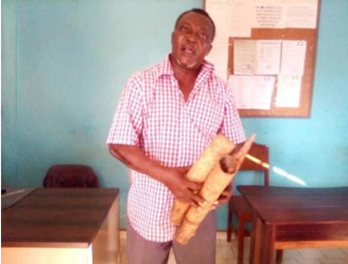
An ivory trafficker arrested at North-East of the country with two tusks.