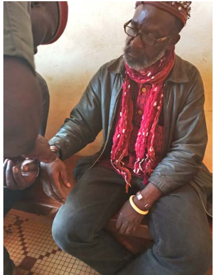
A trafficker was arrested with 5 large leopard skins in Cameroon.

2 leopard skin traffickers was arrested with a leopard skin in the central part of the country. They travelled to the place of transaction on a motorbike with the skin carefully concealed in a jute bag. They were swiftly arrested, and they remind behind bars awaiting trial.