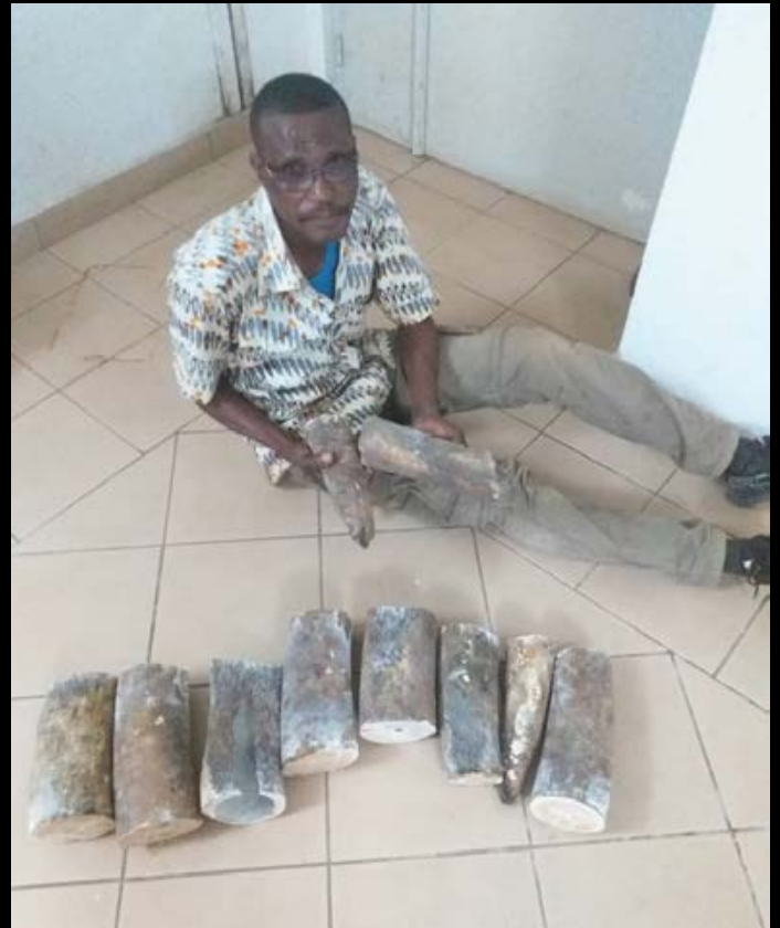
2 ivory traffickers were arrested with 2 tusks cut in ten pieces in Gabon.