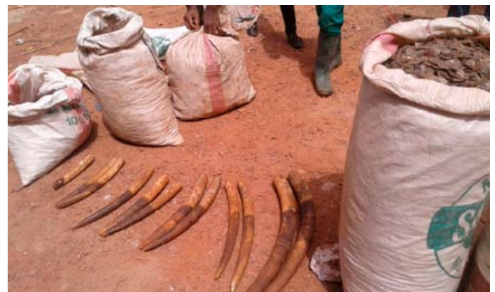
12 ivory tusks and 200 kg of pangolin scales.