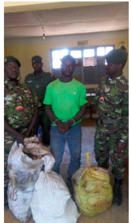
4 ape meat traffickers with 106 kg of meat were arrested in a series of following operations.