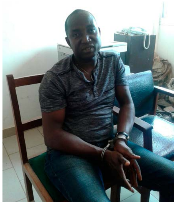
A significant Nigerian ivory trafficker arrested with 12 ivory tusks and 200 kg of pangolin scales.

4 ape meat traffickers with 106 kg of meat were arrested in Guinea in a series of following operations, one of them a head of a regional network of ape meat traffickers, involving also poachers and traffickers from Sierra Leone. 2 of them were arrested later after the issuing of an arrest warrant.