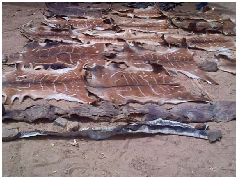
4 wildlife traffickers arrested in Benin with a shocking number of animal parts