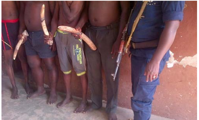
5 ivory traffickers arrested with 4 tusks,