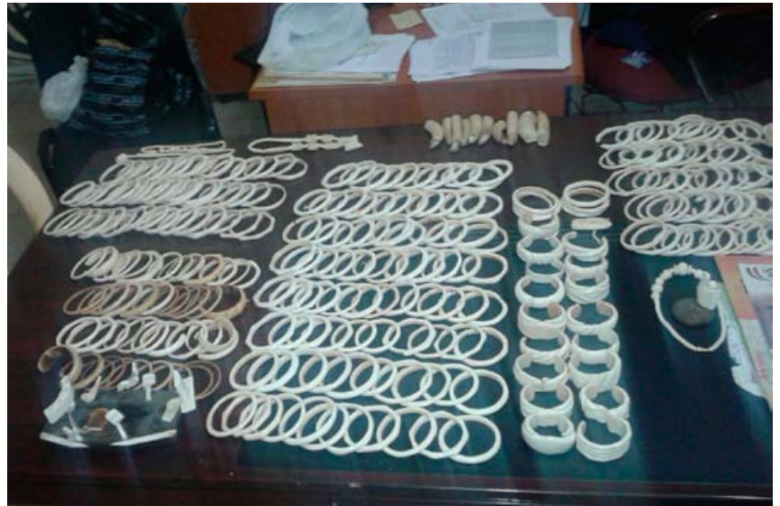
3 traffickers arrested during an attempt to sell 271 pieces of elephant ivory