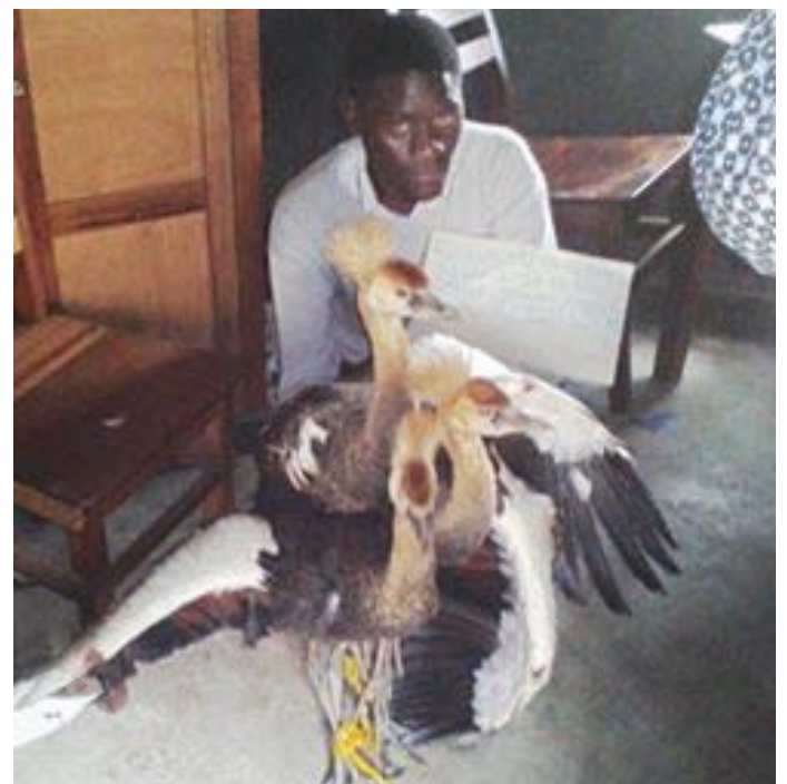
A bird trafficker was arrested with three Crowned Cranes