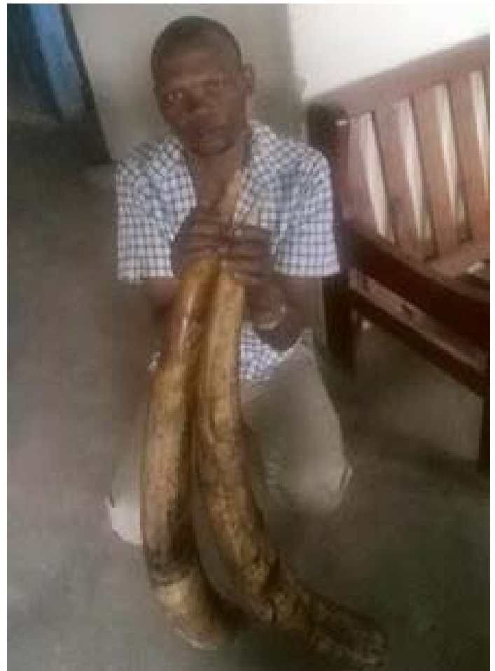
An ivory trafficker arrested with 2 tusks