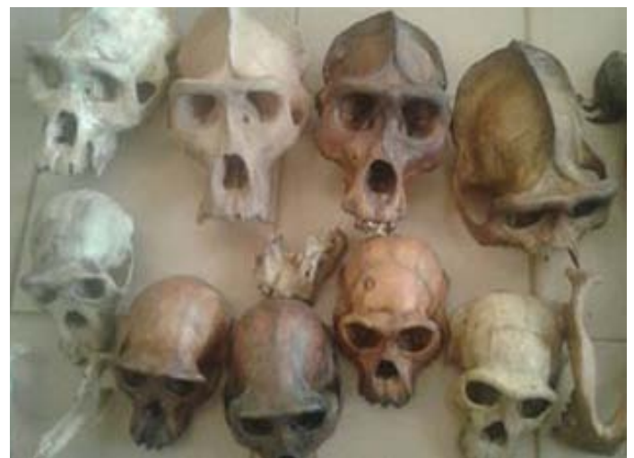
A trafficker with 5 chimps and 4 gorilla skulls arrested