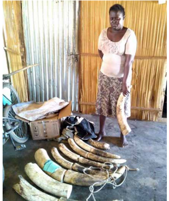
An ivory trafficker arrested with 63 kg of ivory and a bribe attempt was combated.