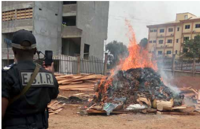
three tons of pangolin scales seized during wildlife law enforcement operations in the country were burned

ment continued with interviews conducted and advert for the position of internet investigator done.