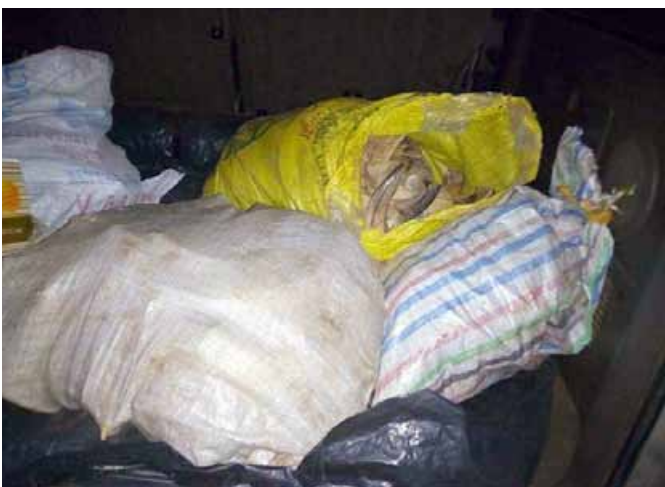
A Senior Presidential Adviser and two other traffickers were arrested with 183 kg of hippo teeth