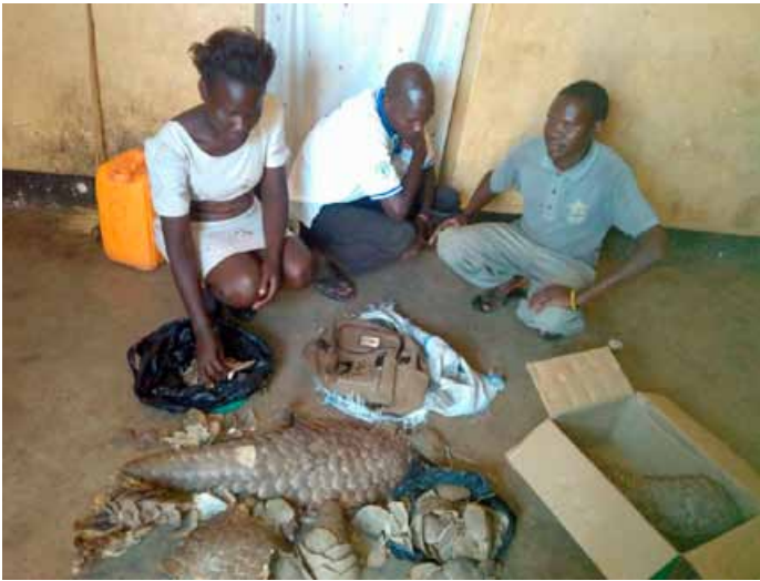
3 traffickers arrested in the North-East part of the country with live Giant pangolin and 10 kg of pangolin scales.