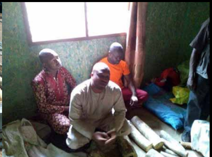
3 traffickers arrested, dealing in multi millions dollars illicit profits with connection to other major criminal syndicates in Africa