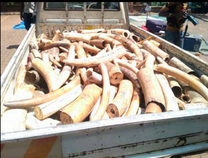
5 trucks were needed to transport 1.3 tons of ivory seized during a crackdown on a West African criminal syndicate in Uganda.