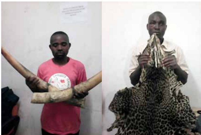
5 ivory traffickers arrested in Gabon in 3 different operations, one of them after being on the run for 5 years