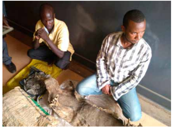
2 traffickers arrested in Kampala with 4.5 kg of pangolin scales and a skin of an aardvark.

rant was issued against him. 2 relatives of the trafficker, both police officers, tried to bribe the police to get her freed.