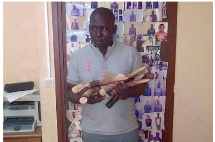
A Malian ivory trafficker arrested with 6 tusks weighting 10 kg.