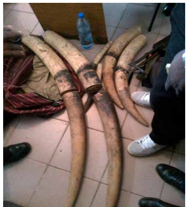
4 significant ivory traffickers arrested with 6 tusks in Congo