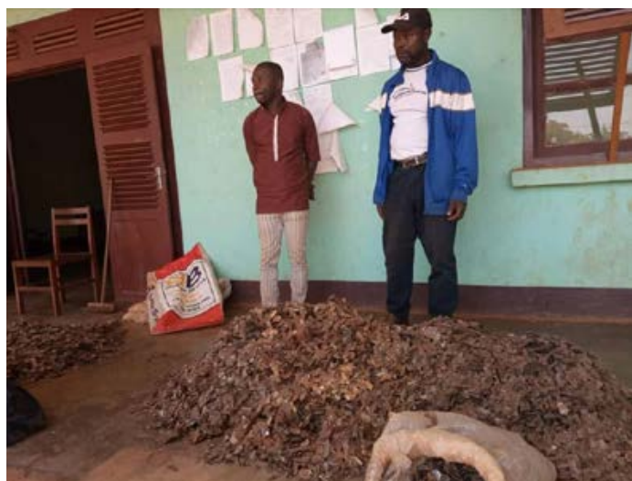
3 traffickers were arrested with 70 kg of pangolin scales in Cameroon