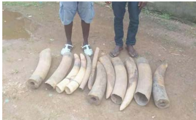
3 ivory traffickers were arrested in Gabon with 8 tusks

3 traffickers were arrested with 70 kg of pangolin scales in Cameroon. An ex-military man was among them; he used his position to protect the trafficking ring that was organized around one experienced pangolin scales trafficker. This seizure, a snapshot of the ongoing trade of these criminals, represents probably more than 200 slaughtered pangolins