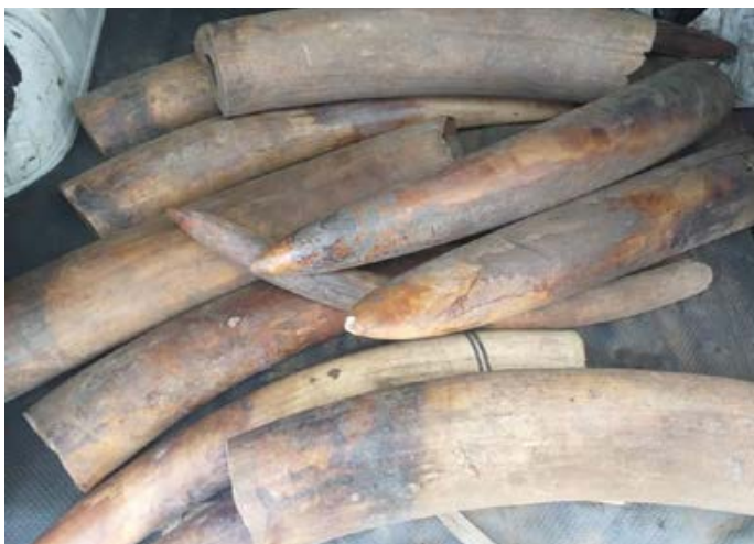
3 ivory traffickers arrested in the South of the country with 8 tusks