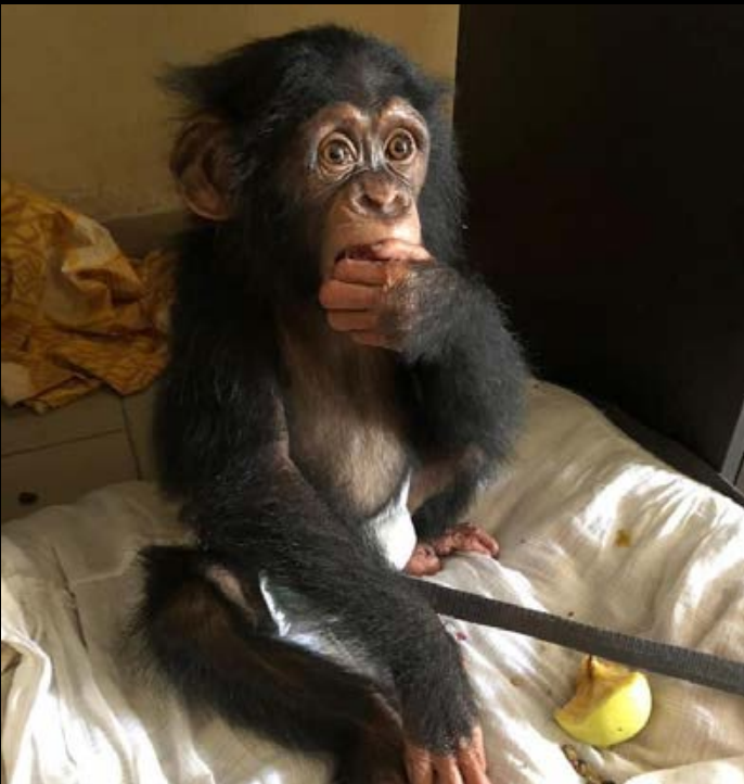
A major live-animal trafficker arrested and a live baby chimp rescued in Côte d'Ivoire