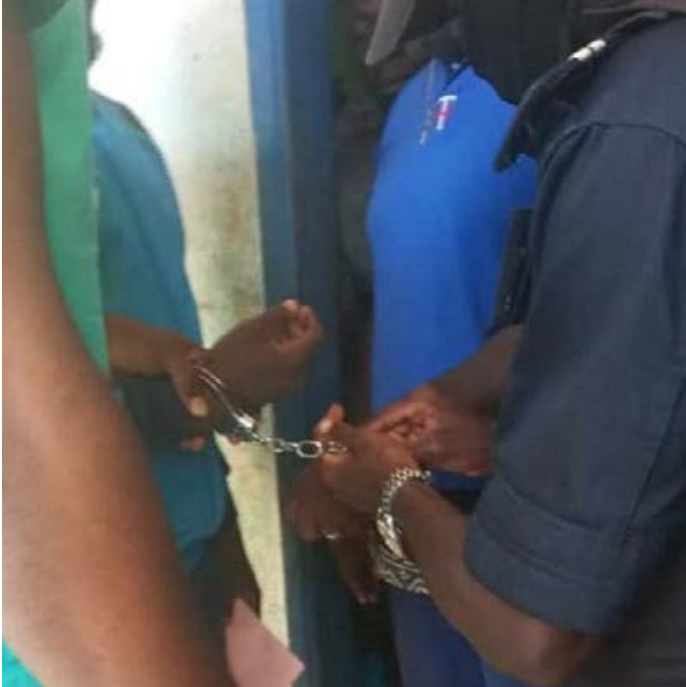
6 ivory traffickers arrested and a criminal gang of ivory traffickers crushed.