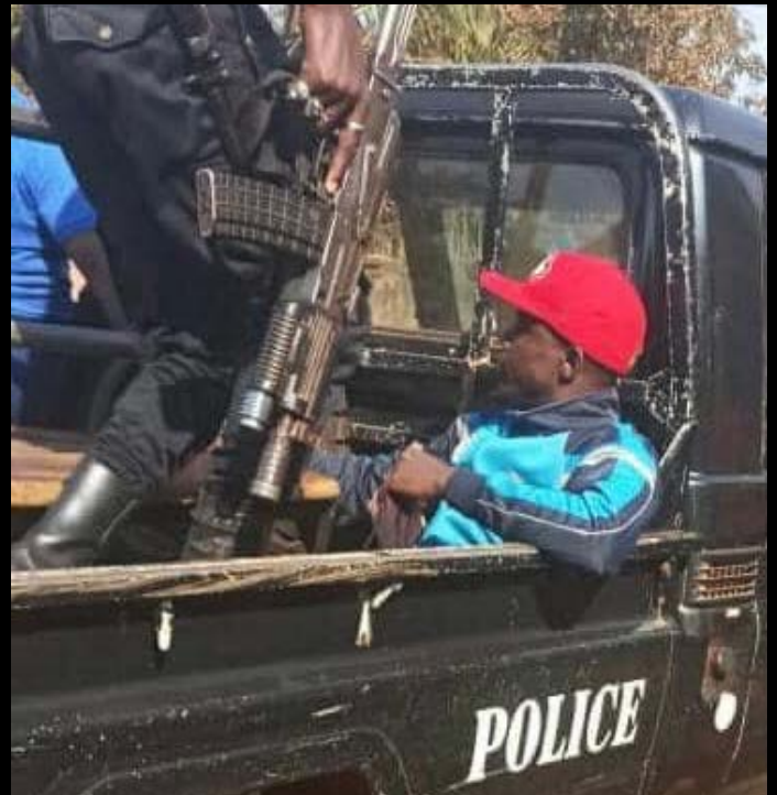
6 ivory traffickers were arrested and a criminal gang of ivory traffickers crushed in Cameroon.