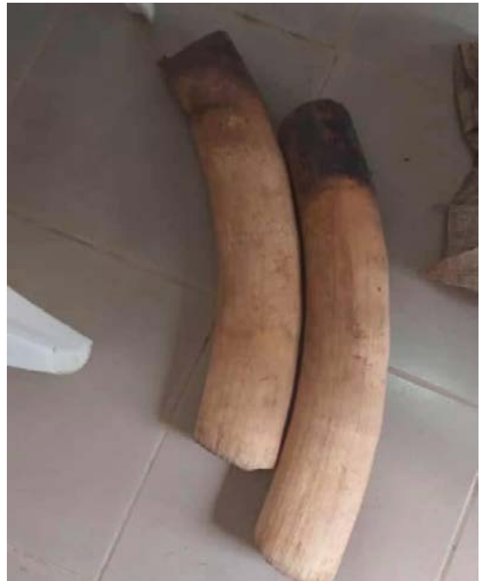
2 ivory traffickers arrested in the South of the country with 2 tusks