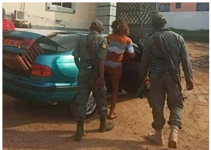
A live animal trafficker arrested and young mandrill rescued

■ A super volunteer finished her 3 months long training working with the various departments of the organization.