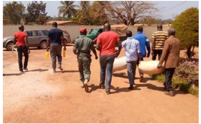
3 traffickers arrested with 70 kg of pangolin scales An ex-military man was among them, he used his position to protect the trafficking ring

used his position to protect the trafficking ring that was organized around one experienced pangolin scales trafficker. This seizure, a snapshot of the ongoing trade of these criminals, represents probably more than 200 slaughtered pangolins