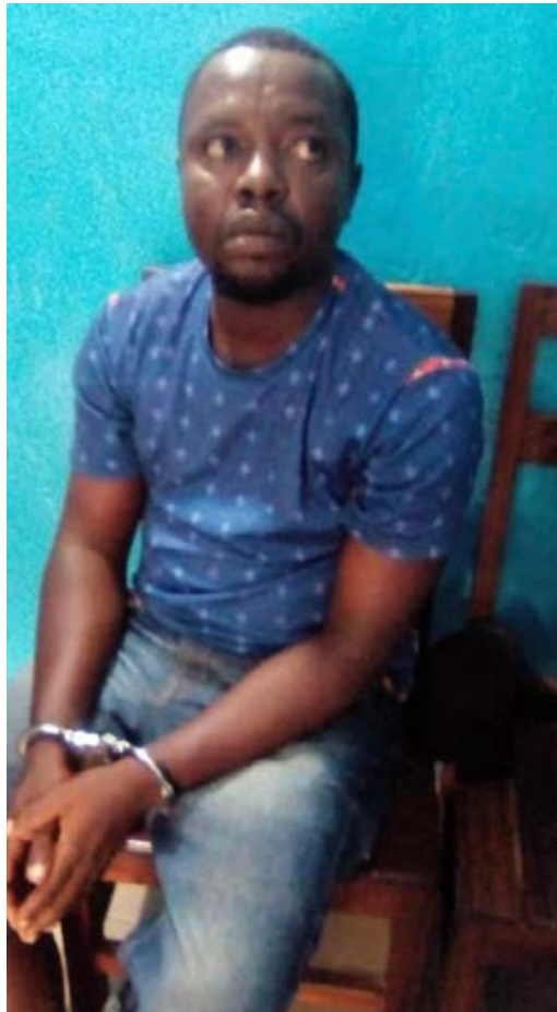
3 traffickers arrested with 18 African Grey Parrots