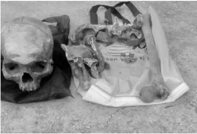
7 traffickers arrested with several human bones.