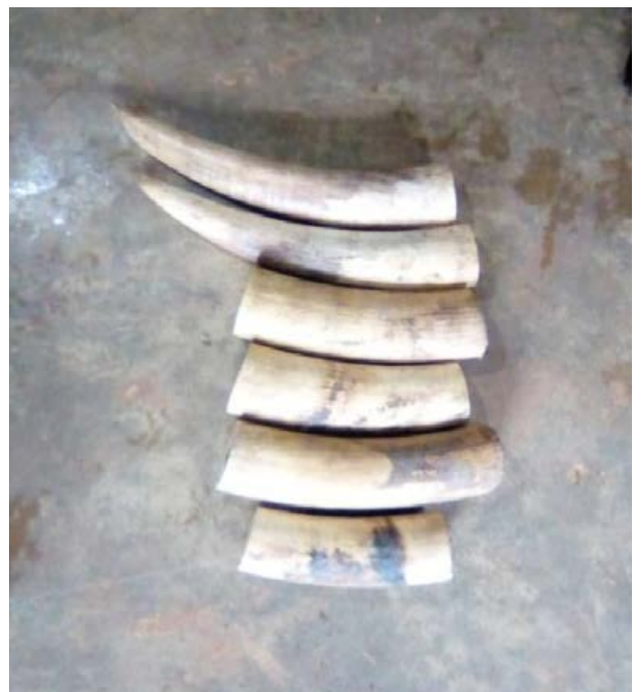
2 traffickers arrested with 2 elephant tusks, weighing just under 40 kg.