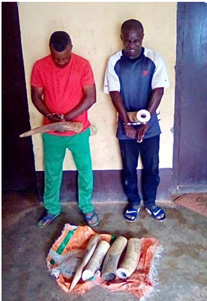
2 traffickers arrested with 2 elephant tusks, weighing just under 40 kg in Congo.

2 traffickers arrested with 2 elephant tusks, weighing just under 40 kg in Congo. One of the traffickers is a pastor and the second is a military man. The military man was extremely violent and tried to escape during the arrest. He attempted to corrupt officers when behind bars.