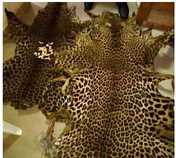
3 traffickers arrested in Gabon with 2 leopard skins and leopard teeth.

3 traffickers arrested in Gabon with 2 leopard skins and leopard teeth. The first trafficker, a Malian, was arrested attempting to sell the contraband. A follow up operation apprehended a Guinean and a Gabonese trafficker.