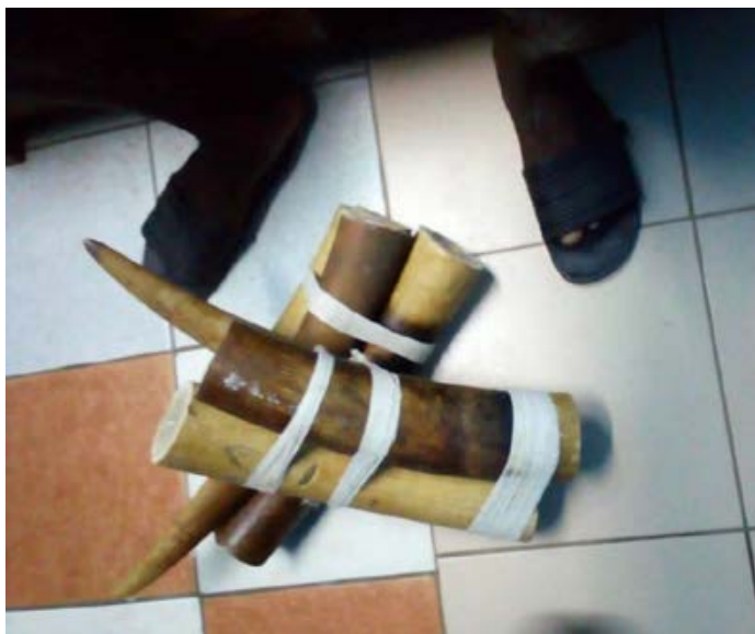
2 traffickers arrested with 2 elephant tusks.