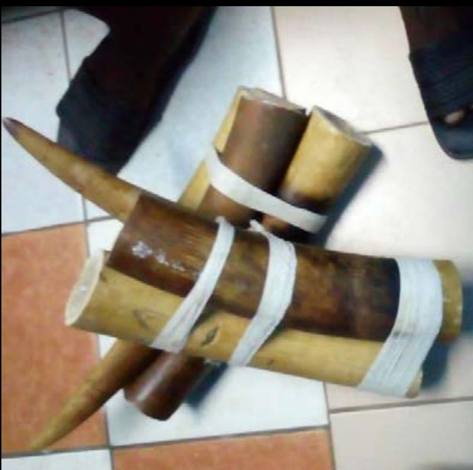
2 traffickers arrested with 2 elephant tusks in Gabon.