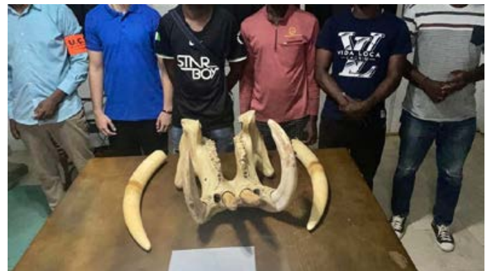
5 traffickers arrested in Cote d'Ivoire with 2 elephant tusks, 4 hippo teeth and a hippo jaw

2 traffickers arrested with 2 elephant tusks in Gabon. They arrived the scene of transaction with each carrying a backpack with concealed ivory. The tusks were cut into 6 pieces.