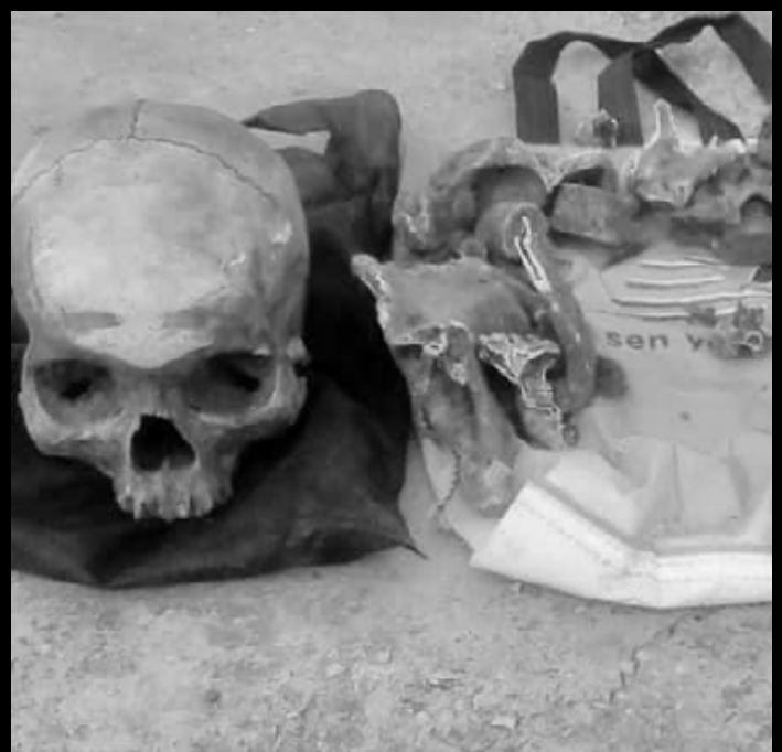
7 traffickers arrested with several human bones in Congo.