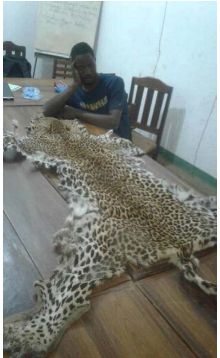
A trafficker arrested with a leopard skin.

Forests, the representatives of the US Embassy, the Program Officer, Governance Section at the European Delegation, several State Counsels and others.