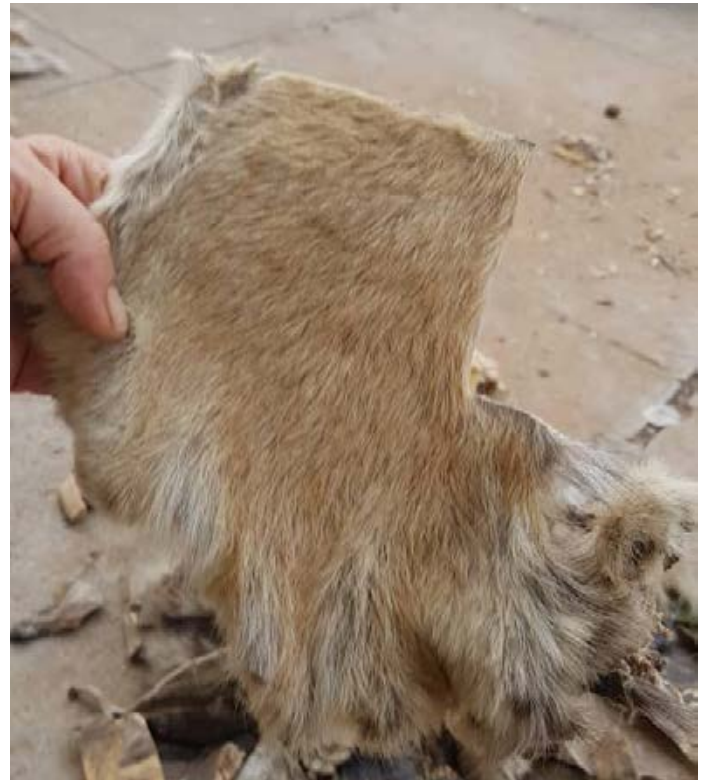
3 traffickers arrested with more than 500 wildlife skins, including at least 3 lions, several leopards cut into pieces and 5 more protected species.