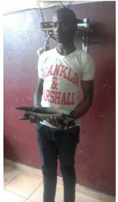
3 traffickers, 2 of them from Burkina Faso, arrested with two leopard skins and an ivory tusk.