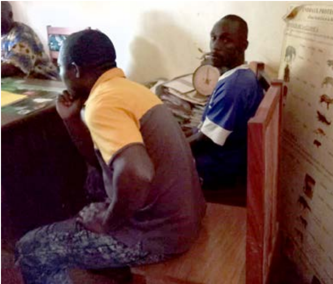
5 traffickers arrested with 31 kg pangolin scales in Cameroon.

2 traffickers arrested with 2 lion skins and 3 leopard skins. This operation marks the start of our latest replication in Burkina Faso. The traffickers collected the lion skins in the WAP complex (W - Arly - Pendjari National parks), at Burkina Faso, Niger and Benin border, the largest protected area still rich in wildlife in West Africa.