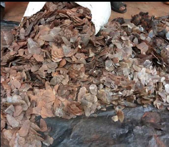
5 traffickers arrested with 31 kg pangolin scales in Cameroon.