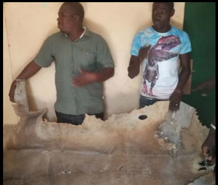
New EAGLE project launched in Burkina Faso with an arrest of 2 traffickers with big cat skins