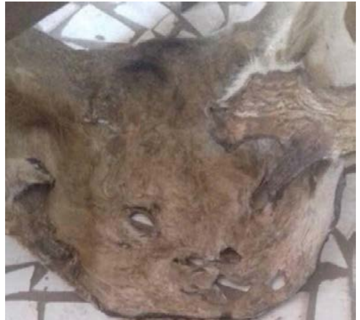
3 traffickers arrested with more than 500 wildlife skins, including at least 3 lions, several leopards cut into pieces and 5 more protected species in Senegal.

Harouna Traoré, a member of the notorious Traoré trafficking family, arrested in Guinea. Traoré family is one of the main international network, trafficking live animals in West Africa. They have been involved in ape trafficking for many years. 150 Senegal Parrots