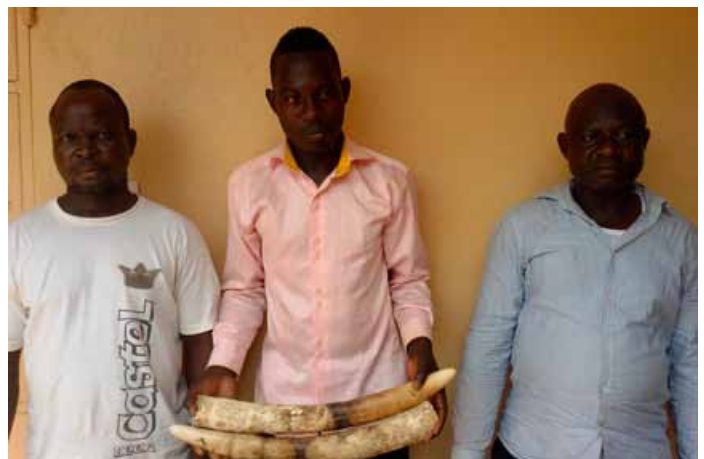
3 ivory traffickers arrested in Togo with 2 tusks