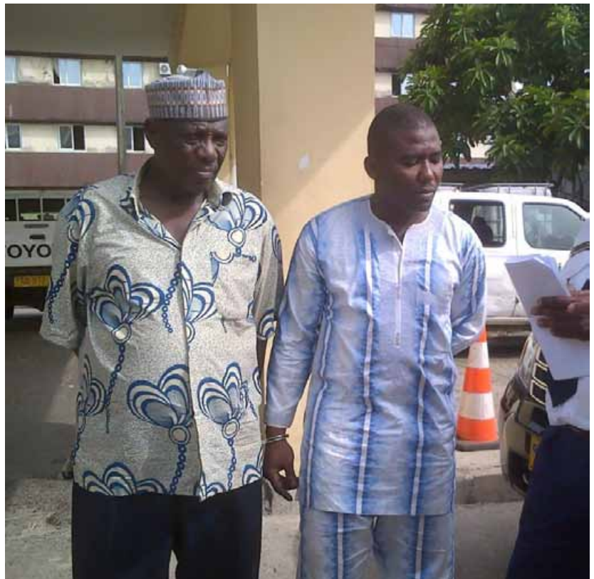
2 significant ivory traffickers arrested with 206 kg of ivory, one of them a forestry and wildlife official.