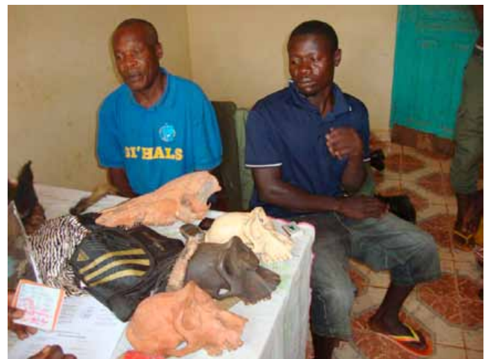
2 traffickers arrested with 3 gorilla skulls, a chimp skull, an elephant tail, and other contraband in Cameroon

4 Vietnamese traffickers were arrested in Uganda at the Entebbe International Airport in November, dur-