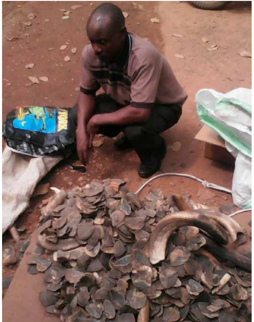
A trafficker arrested with 24 kg of hippo teeth and 20 kg of giant pangolin scales.