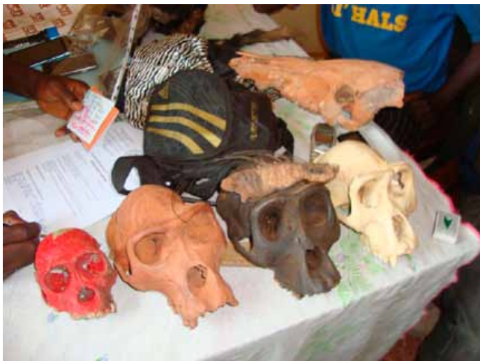
Ape trafficker arrested claiming red paint is put on one skull as black magic rendering the contraband invisible.