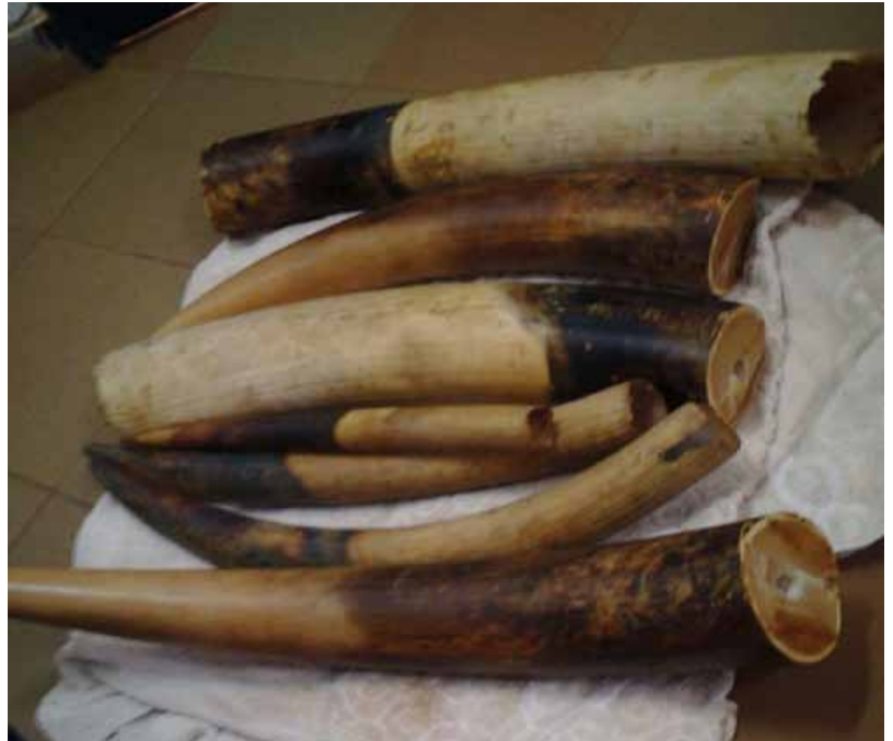
5 traffickers arrested with 35 kg of ivory