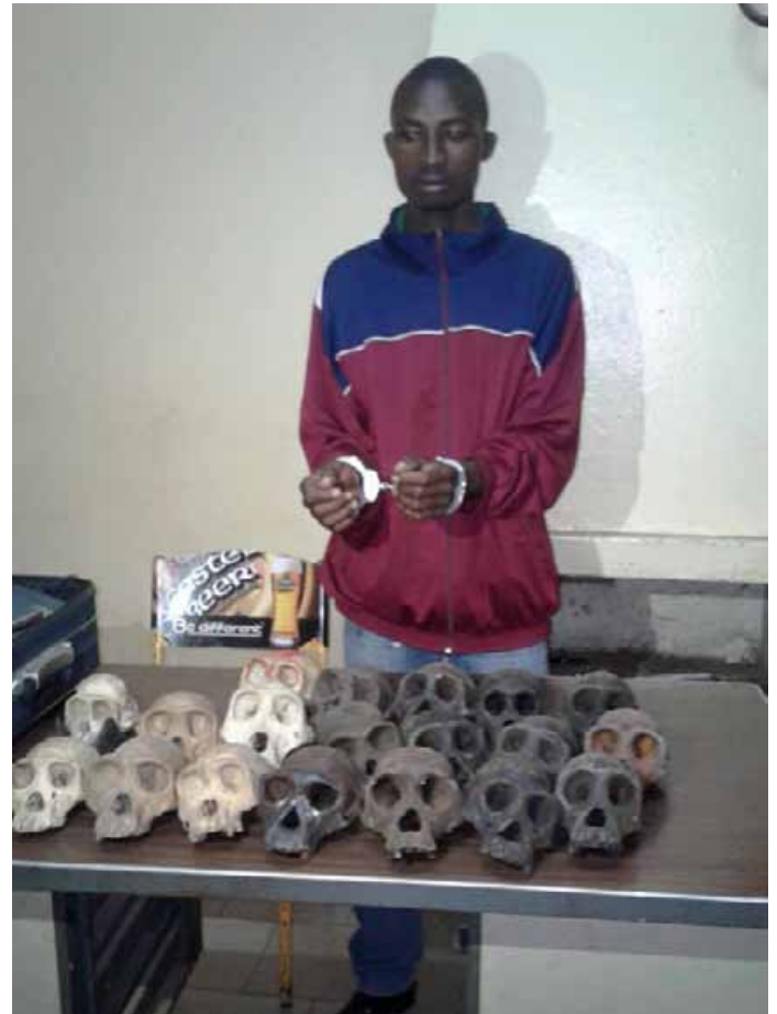
19 chimpanzee skulls seized from arrested trafficker who ferried products from the south to Cameroon's capital for business.