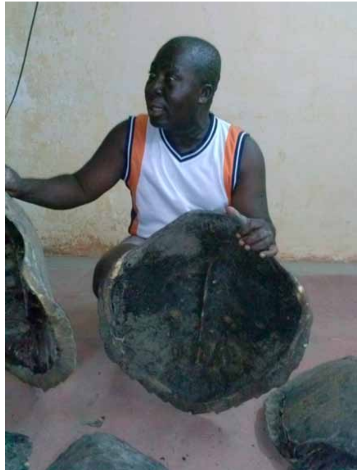
A cross-border trafficker arrested with 12 sea turtle shells on the border between Ghana and Togo.