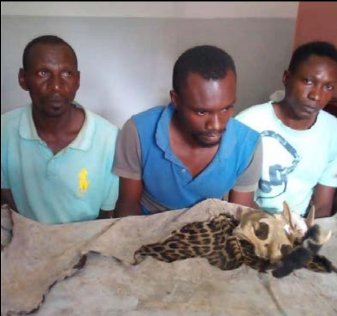
3 traffickers were arrested with a leopard skin and skull in Congo.