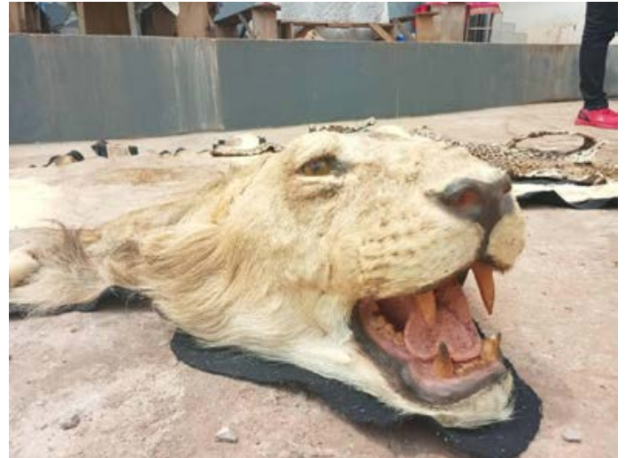
2 traffickers were arrested with a lion skin and a leopard skin in Cameroon.

2 traffickers were arrested with a lion skin and a leopard skin in Cameroon. The first trafficker, an owner of two craft shops, was arrested during an attempt to sell the skins. He was arrested with a travelling bag