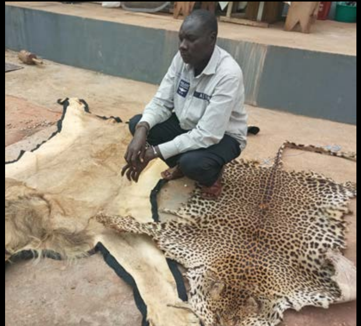
2 traffickers were arrested with a lion skin and a leopard skin in Cameroon.