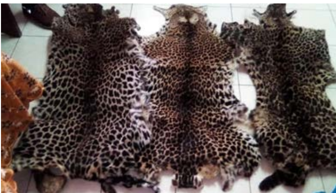
3 traffickers were arrested with 3 leopard skins in Gabon.

3 traffickers were arrested with 3 leopard skins in Gabon. The first one, a woman of Benin nationality was arrested in the act, during an attempt to sell the skins on a market in capital city. She concealed the