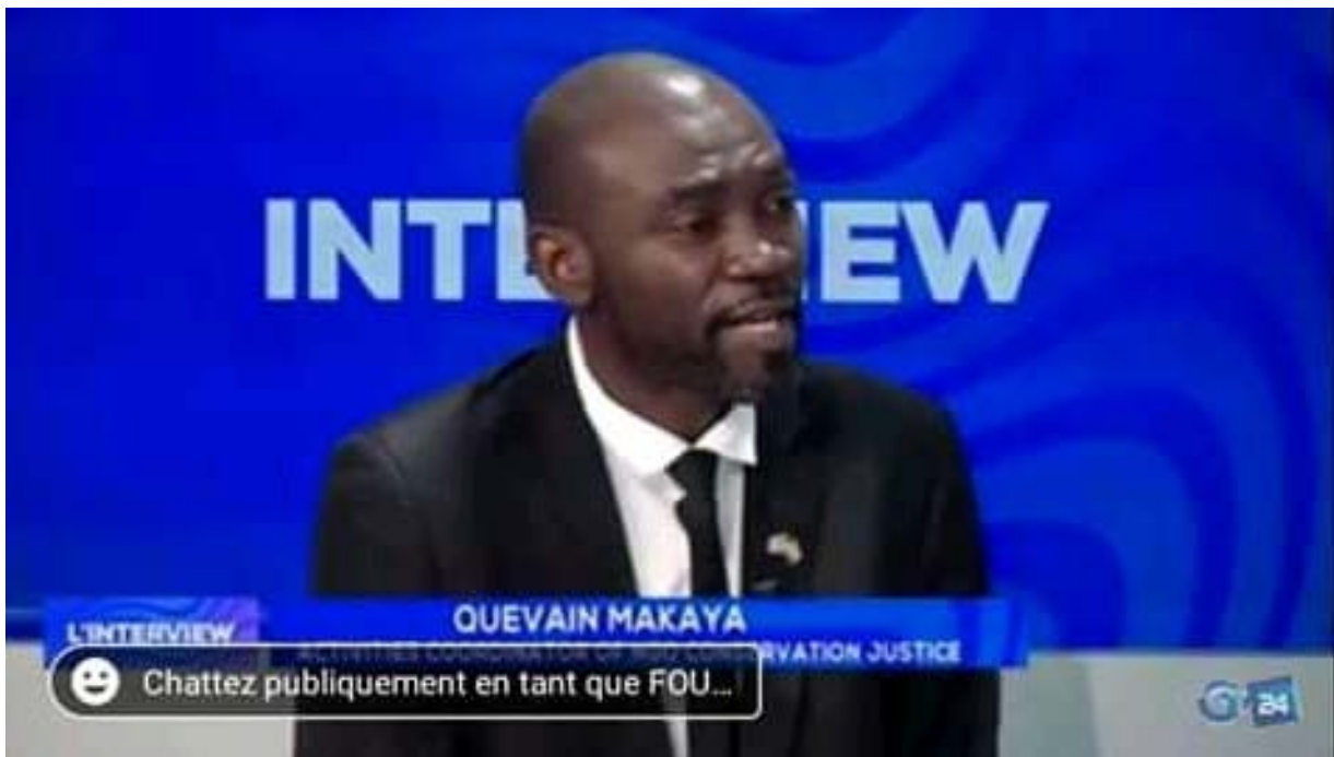
The Activities Coordinator of AALF Gabon granted an interview to Gabon-24 television channel on wildlife trafficking in Gabon.