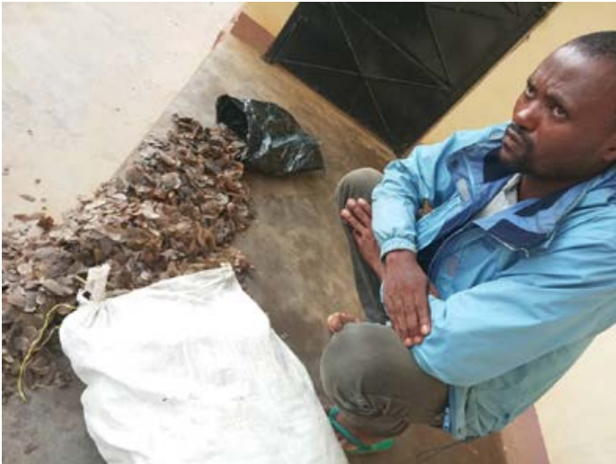
A trafficker was arrested in Cameroon with 23kg of pangolin scales.

3 traffickers were arrested with 2 elephant tusks in Gabon. The first two, one Senegalese and one Nigerian, were arrested while they tried to sell the tusks, carefully concealed in a television cardboard box. After arrival to the police station they denounced a third trafficker, also a Nigerian, who was arrested a few hours later.