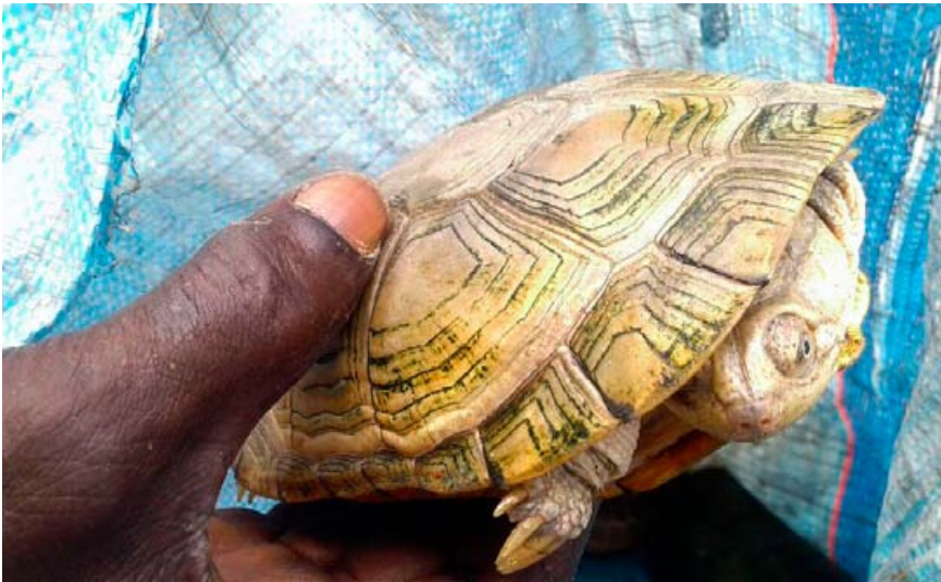
African Helmet Turtles are relatively small omnivorous sweet water turtles that live in fresh and stagnant water bodies throughout Sub-Saharan Africa.

become intensively trafficked. They are often sold to Chinese as a delicacy, but they are also exported to Europe and USA where they are kept as popular pets. All the sweet water turtles are fully protected in Senegal. The seized turtles were sent to a rehabilitation centre and later will be released in the Niokolo-Koba National Park.