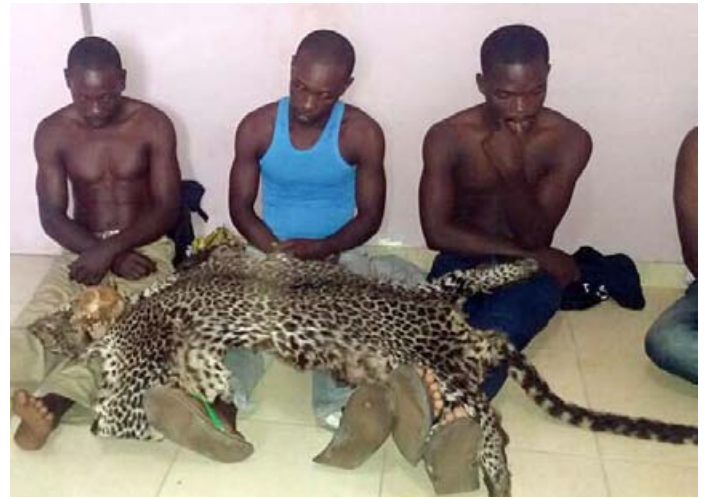
4 traffickers were arrested with 2 leopard skins and a chimp skull.