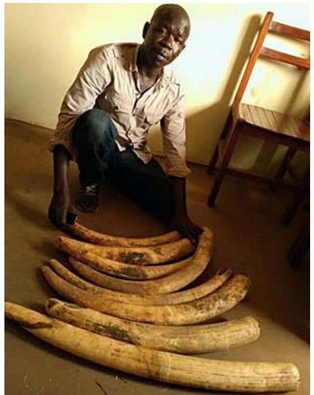
An ivory trafficker was arrested in the capital of Uganda with 20.5 kg of ivory.

2 traffickers were arrested with 128 kg of Giant Pangolin scales in Cameroon. One of them is a repeat offender – a receipt for a mere payment of a fine for wildlife trafficking was found on him.