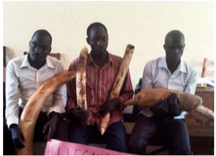
3 ivory traffickers arrested with 36 kg of ivory near Congolese border.