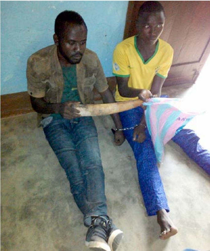
2 ivory traffickers arrested with one tusk