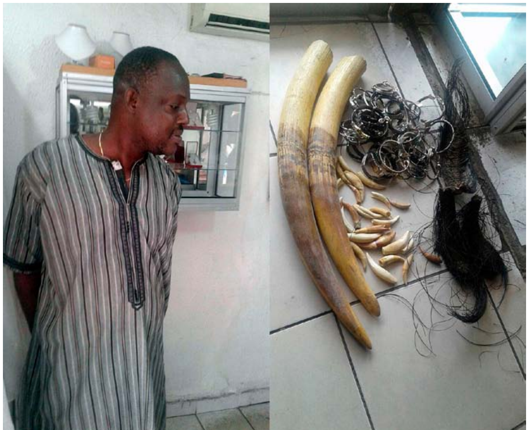
An ivory trafficker arrested in his jewellery shop. The house search revealed 2 tusks, 24 leopard teeth, 50 elephant hair bracelets and 3 elephant tails.

small shop with jewellery, famous for products derived from protected animals. In addition to gold, silver, diamond and bronze, he was trading ivory, leopard teeth and other parts of protected animals to produce necklaces, bracelets and other jewel-