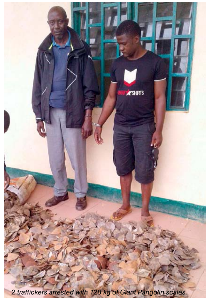
2 traffickers arrested with 128 kg of Giant Pangolin scales.

■ A programme to train LAGA members on first aid by the Cameroon Red Cross continued, the second trainee completing his course in August.