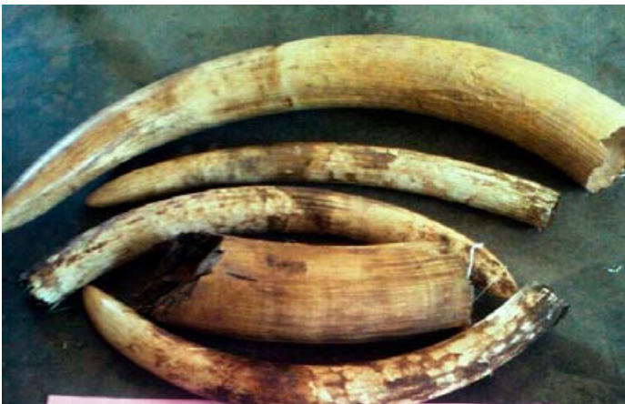
3 ivory traffickers arrested with 36 kg of ivory near Congolese border.