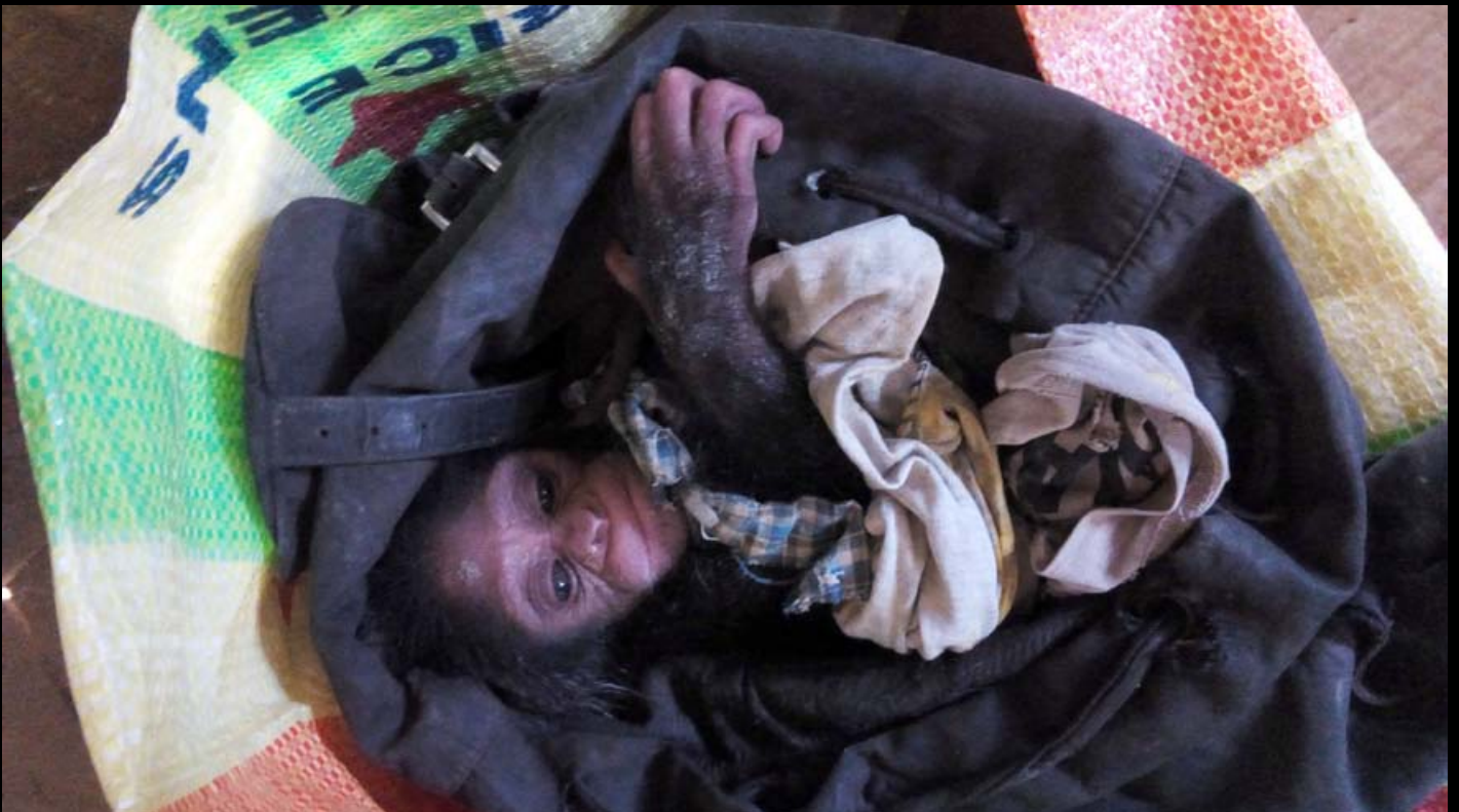
A baby chimp was rescued and a wildlife trafficker arrested in Cameroon. He trafficked the animal concealed in a handbag placed inside a large plastic sack. He was also trafficking 35 kg of pangolin scales.