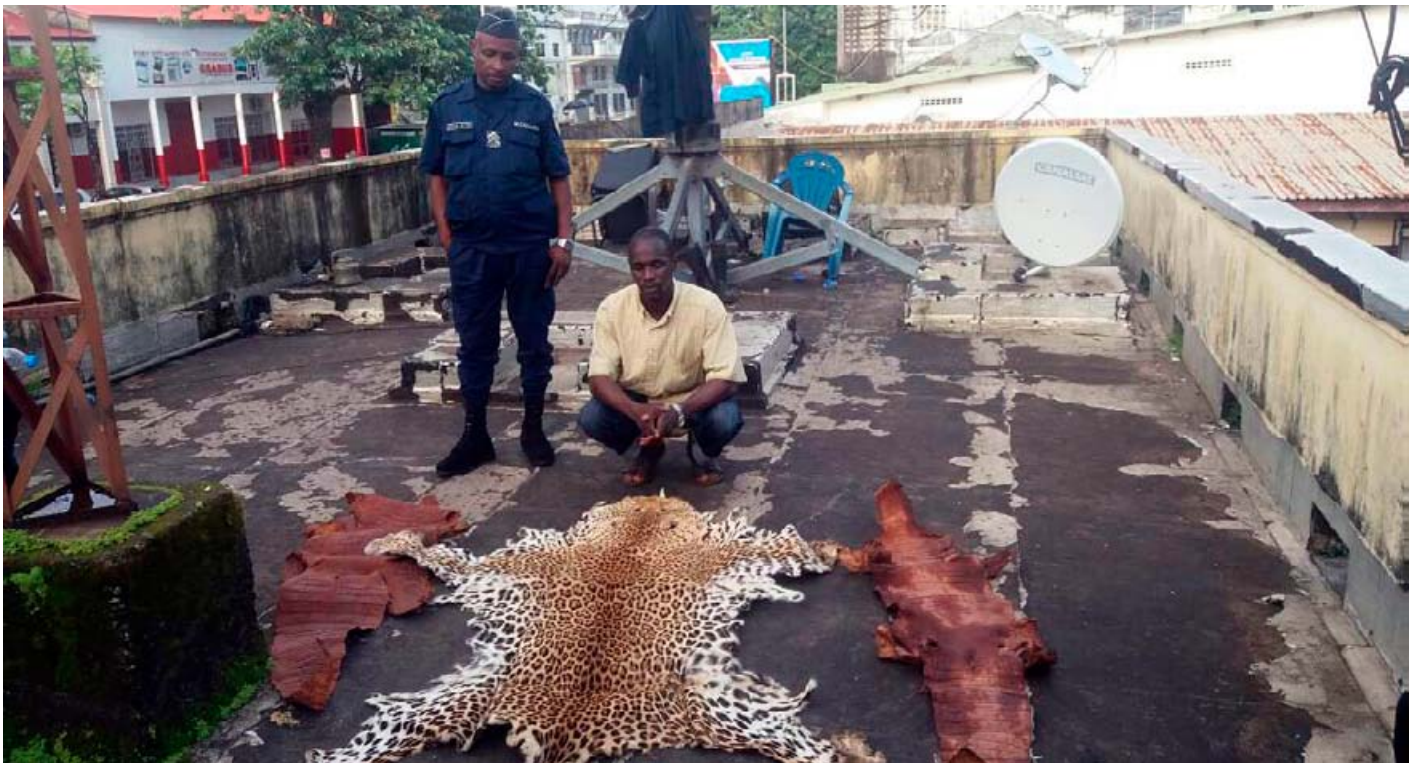
A trafficker arrested with a leopard skin and two crocodile skins in Conakry