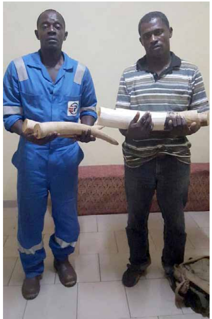
2 ivory traffickers arrested with 2 tusks, one of them a notorious trafficker