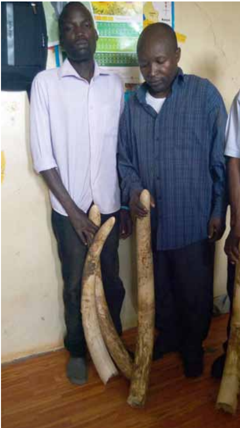
2 significant ivory traffickers arrested with 4 tusks weighting 30 kg.