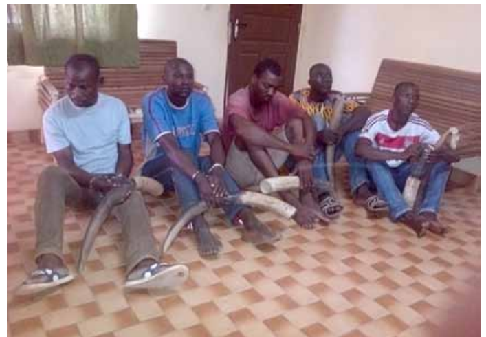
A gang of ivory traffickers was crashed in Gabon

3 ape skulls traffickers were arrested in Cameroon in 2 operations. In the first operation 2 traffickers were arrested with 6 gorilla skulls, 15 mandrill skulls and other contraband. In the second operation a trafficker was arrested with 4 chimpanzee skulls, 8 sea turtle shells and 5 kg of pangolin scales.