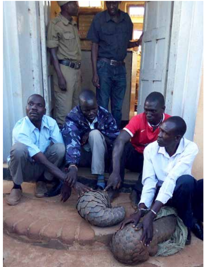
4 traffickers including another corrupt police officer arrested with two live Giant Pangolins.