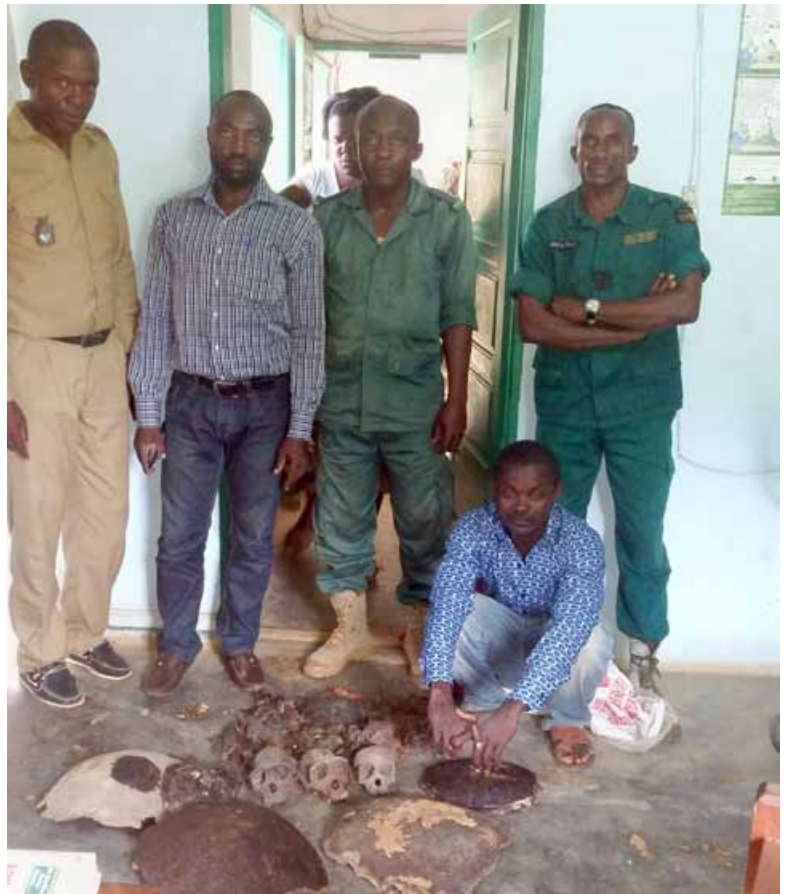
Major trafficker in chimpanzee skulls, sea turtle shells and pangolin scales interrogated after his arrest