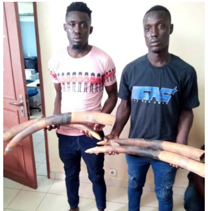
2 ivory traffickers arrested with 6 ivory tusks in the capital city.