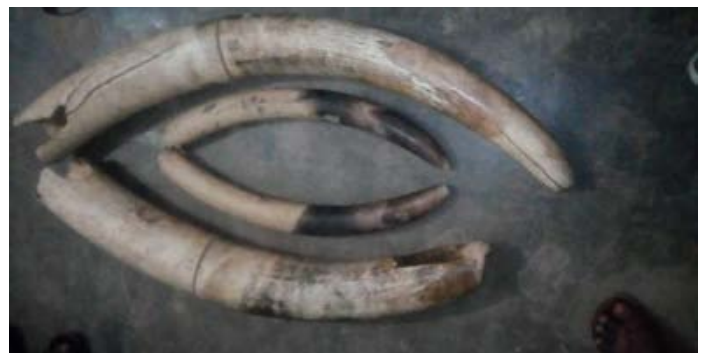
3 traffickers, one of them Nigerian, arrested with 4 tusks in Benin.

2 ivory traffickers arrested with 2 tusks in the capital city of Côte d'Ivoire. One of them a wood carver, the other one an art teacher and former art student, they arrived with the contraband well concealed in a bag into a hotel where they were swiftly arrested. The investigation showed their links to high officials of the country.