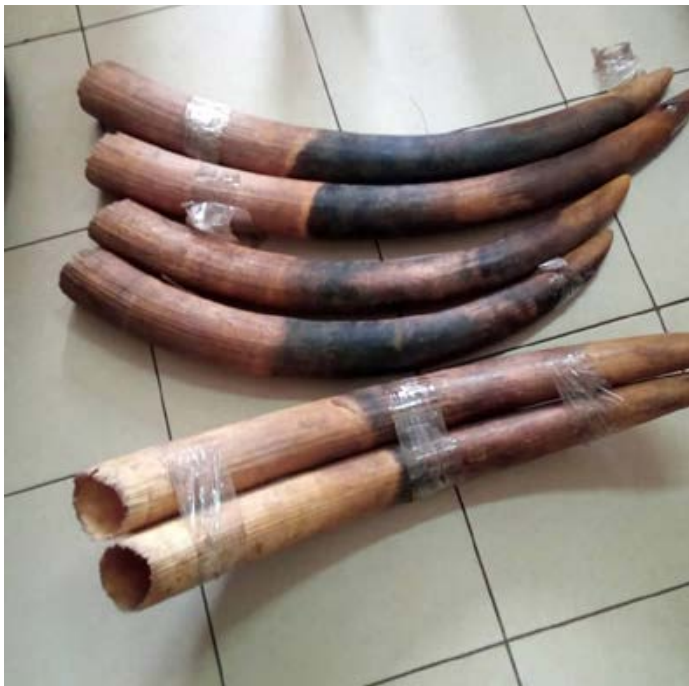
2 ivory traffickers arrested with 6 ivory tusks in the capital city.