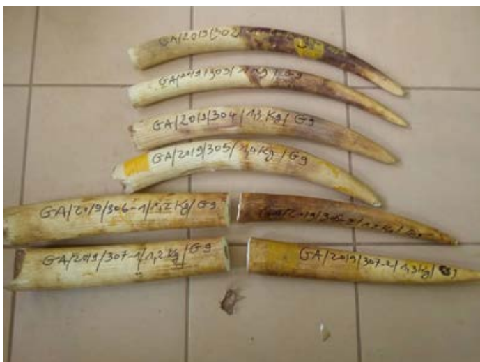
An ivory trafficker arrested with 6 tusks at the North of the country.