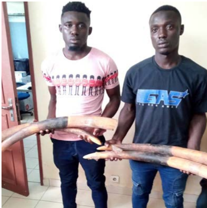
2 ivory traffickers were arrested with 6 ivory tusks in Gabon.

2 ivory traffickers were arrested with 6 ivory tusks in Gabon. They were arrested when they were transporting the ivory, concealed in a suitcase, by car to the place of transaction. They are behind bars awaiting trial, facing a sentence of 10 years in jail according to the new Gabon legislation. An ivory trafficker arrested with 6 tusks at the North of the country. He got the tusks from traffickers operating near Cameroonian border and intended to sell them in the provincial capital but was swiftly arrested in the act.