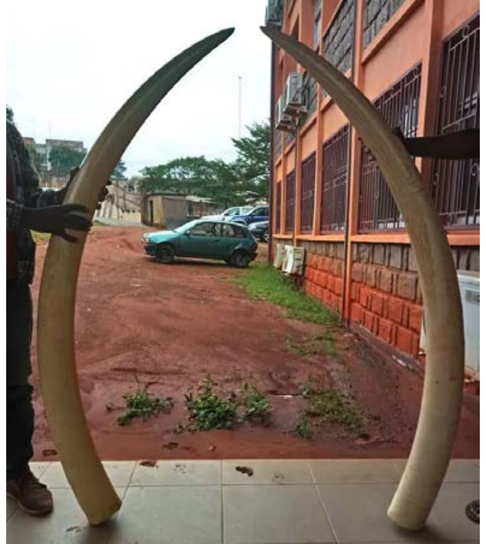
5 ivory traffickers including a son of former Minister of Finance were arrested with two large tusks in the capital city of Cameroon.

5 ivory traffickers including a son of former Minister of Finance were arrested with two large tusks in the capital city of Cameroon. The ex-minister's son was transporting the tusks, weighing 53 kg and measuring close to 2 m in length, in his car together with the other four traffickers. Right before they intended to offload the contraband, they were swiftly arrested in a police ambush. One of them attempted to escape but was quickly arrested too. The trafficking ring is connected to the syndicate of pangolin scales and ivory traffickers who were arrested in Douala in March 2019. Tusks of this size are rarely seen nowadays as poachers massacre younger and younger elephants for the tusks.