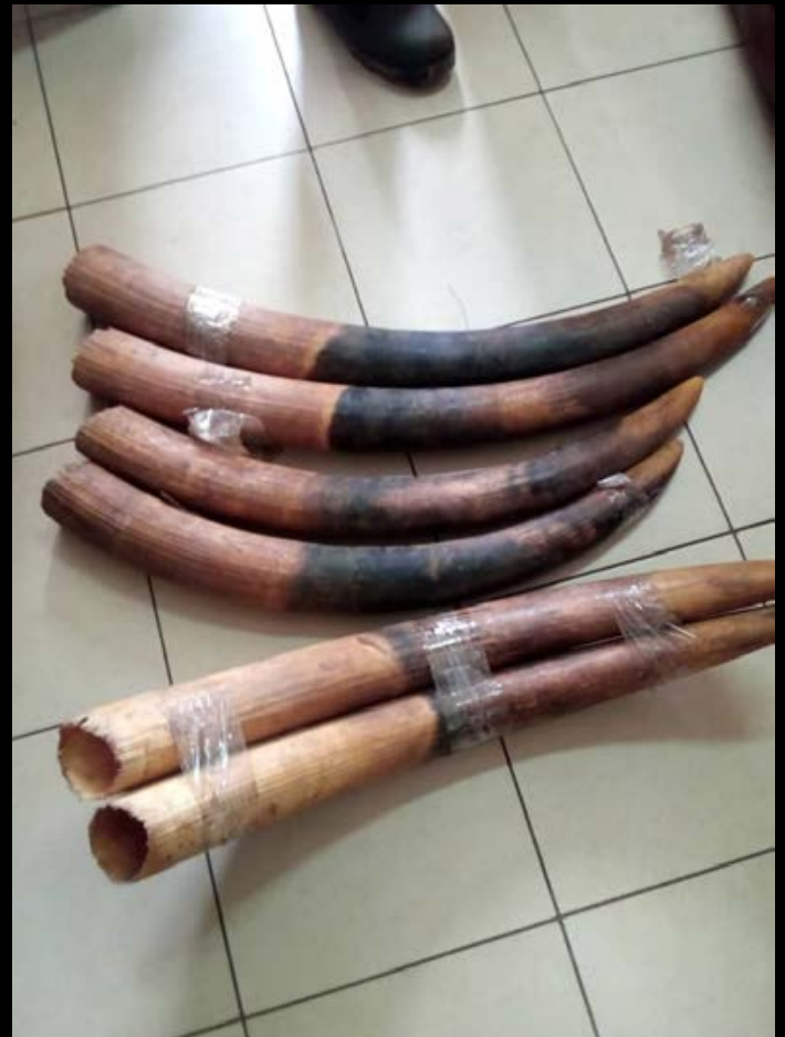
5 ivory traffickers including a son of former Minister of Finance were arrested with two large tusks in the capital city of Cameroon.