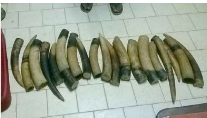
3 ivory traffickers arrested with 2 tusks and 18 ivory pieces.