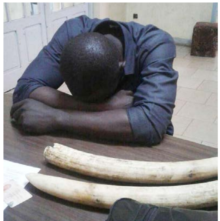
2 ivory traffickers arrested with 2 elephant tusks