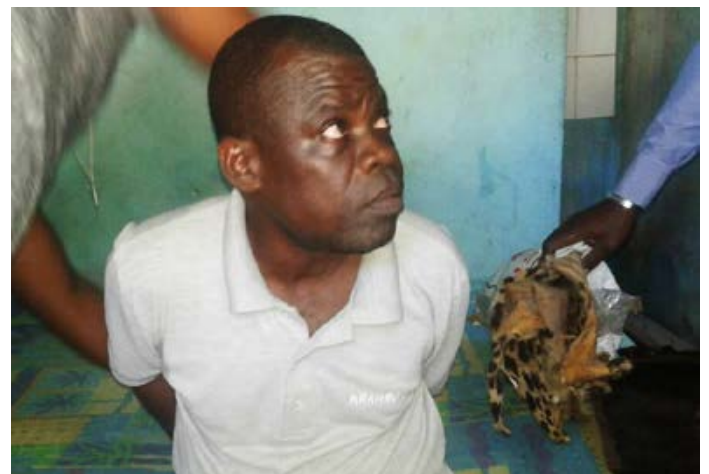
3 traffickers arrested with 2 ivory tusks and a leopard skin.

with representatives of USFWS, WCS, GEF, US Forest Service, FAO, WWF, UNESCO and other international institutions.