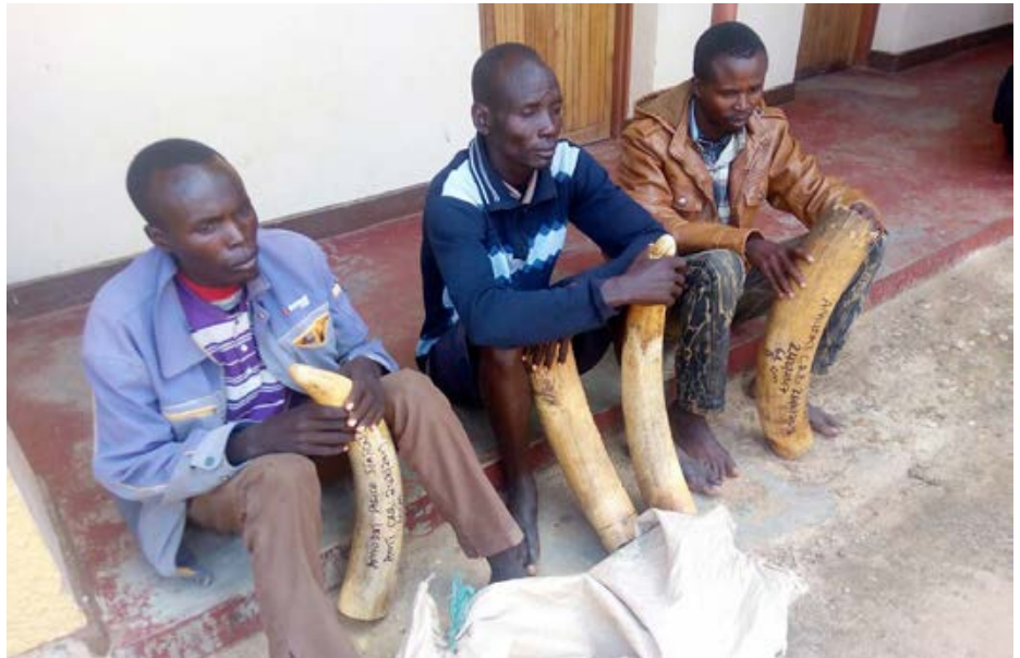
3 traffickers of Kenyan nationality arrested with 2 large tusks, weighing 47 kg.