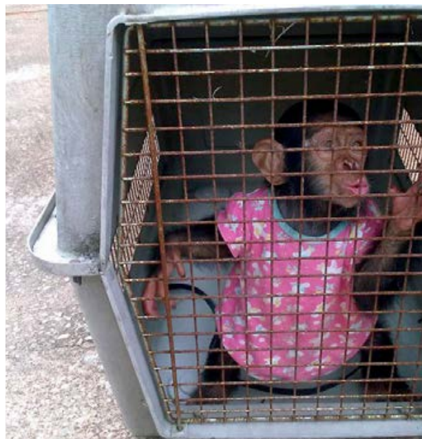
2 traffickers arrested and a 4-month-old baby chimp rescued.