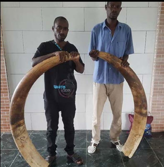
4 traffickers including a corrupt custom officer were arrested in Ivory Coast with 53 elephant tails and more than 52 kg of ivory.