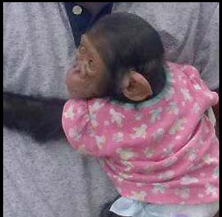
2 traffickers arrested and a 4-month-old baby chimp rescued in Gabon.