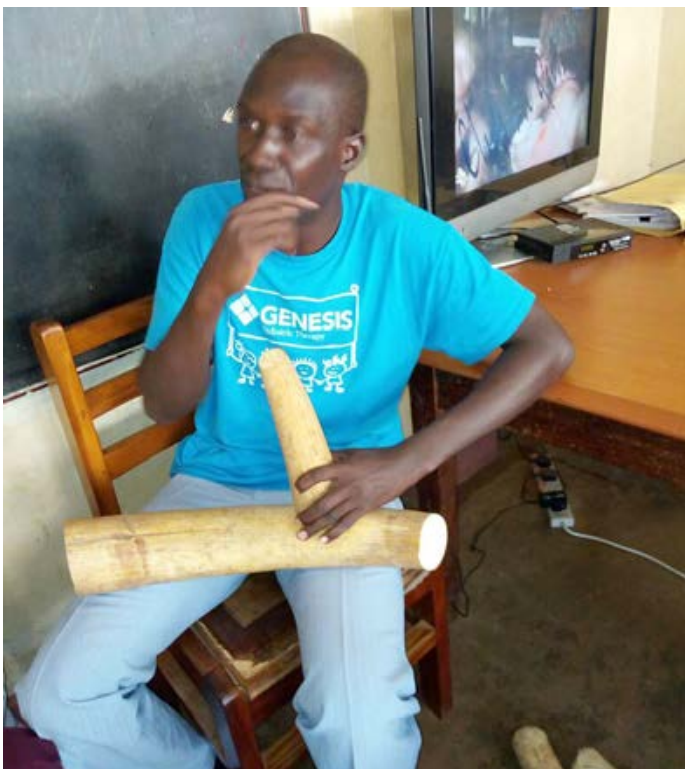
An ivory trafficker with 2 large tusks arrested