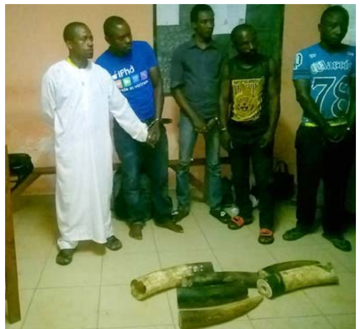
5 ivory traffickers arrested with 2 tusks in the East of the country.