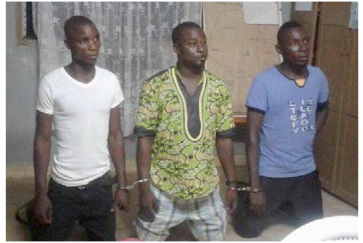
5 leopard skin traffickers arrested in the South-west of the country.

leopard skin. First one was arrested during the attempt to sell the contraband. He immediately denounced two other traffickers, sisters, who supplied the contraband. They were arrested in their home the same day. All three of them are behind bars, awaiting trial.