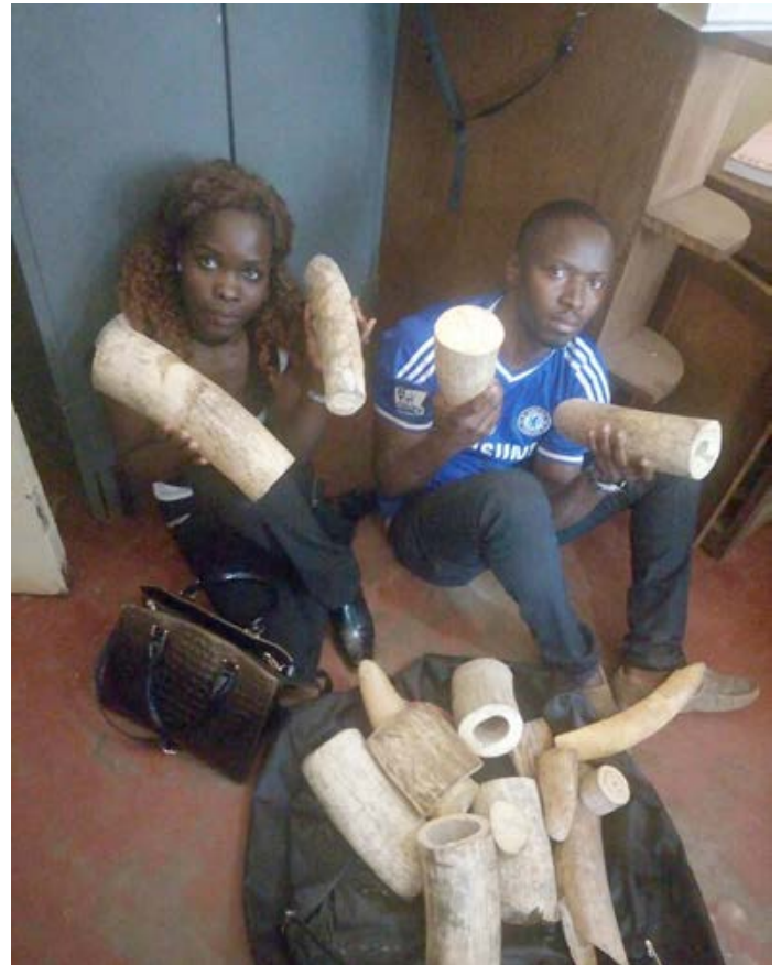
2 ivory traffickers arrested in the capital city with 47 kg ivory.

restaurant, where they attempted to carry the illegal deal, while the woman is an office assistant with an NGO, operating in agriculture. Connection to South Sudan and DRC is being investigated.