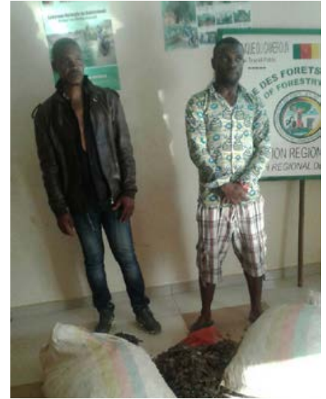
2 traffickers arrested with 2 leopard skins and pangolin scales. 2 traffickers arrested with over 50 kg of pangolin scales.

shortly after returning to Yaounde with the ivory, concealed in a plastic bag. He is a taxi driver and uses his own taxi to traffic the contraband. He is connected to a ring of poachers who supply him with ivory.