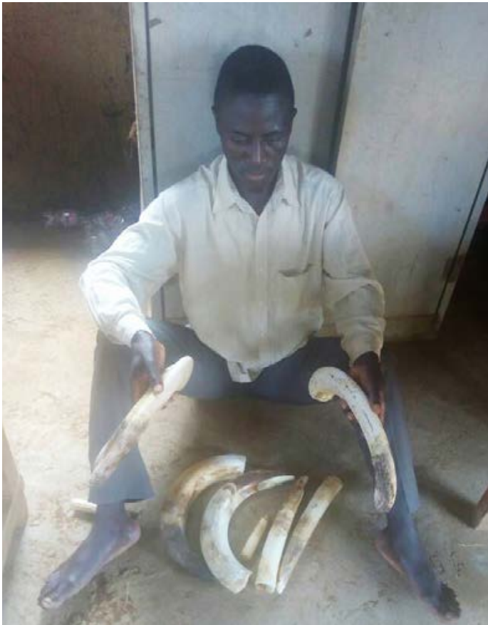
A corrupt Uganda Wildlife Authority ranger arrested with hippo teeth