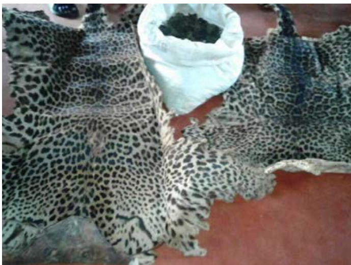
2 traffickers were arrested in Cameroon with 2 leopard skins and pangolin scales.

2 traffickers arrested and a 4-month-old baby chimp rescued in Gabon. They tried to market the chimp online, clothing the male chimp in a pink dress to attract buyers.