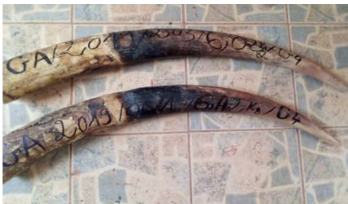
4 ivory traffickers arrested including a corrupt prefet (prefect) in Gabon.