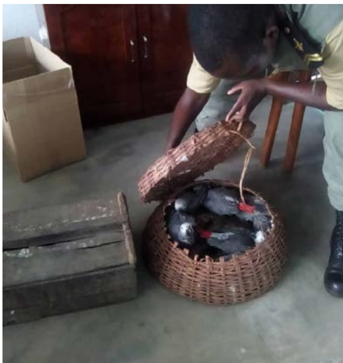
LAGA legal team provided a support to the Customs, who have arrested a longtime Ghanaian parrot trafficker with 18 African Grey Parrots.

repeat offender had been already arrested twice for the same offence and released by officials with no prison sentence. In 2015, he was arrested in the South with a consignment of African Grey Parrots and released. In 2017, he was arrested with an accomplice in Yaoundé with over 200 parrots but was released again, so he felt free to continue the illegal capture and sale of parrots. He is connected to an international group specialized in the illegal export of parrots to Europe, Asia and other African countries.