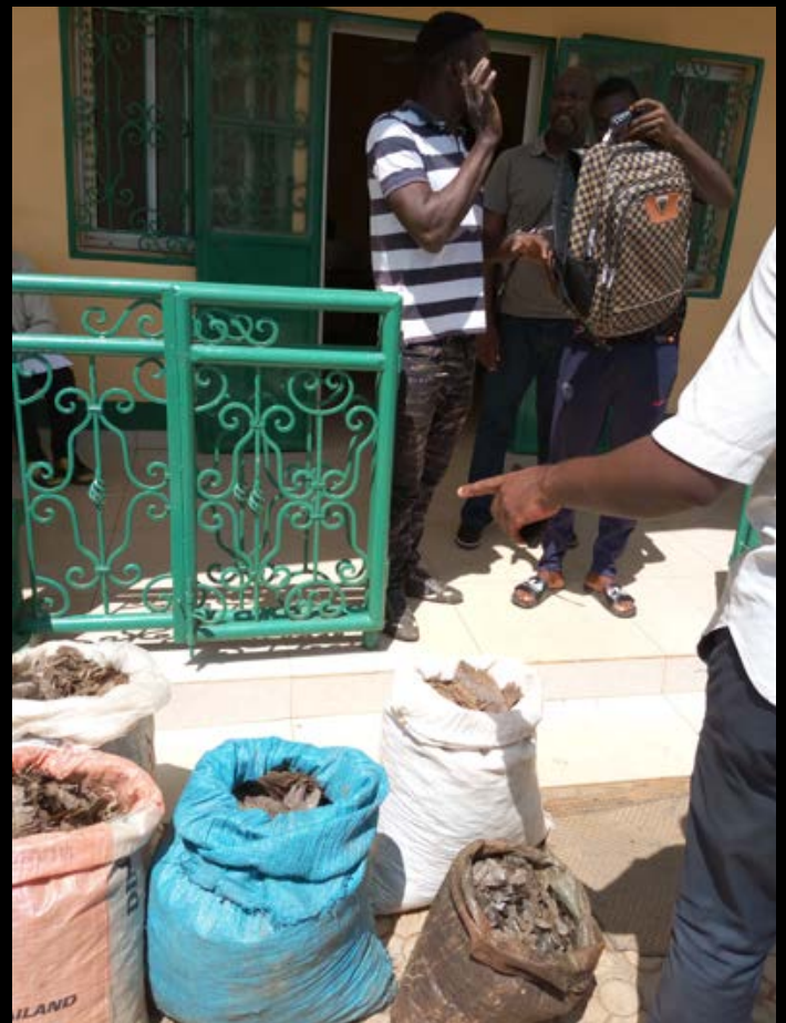
4 traffickers arrested with 100 kg of pangolin scales in Cameroon.