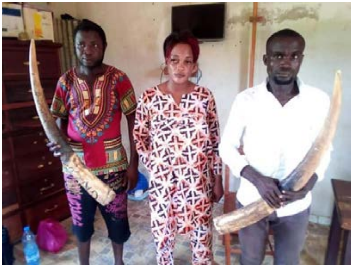
4 ivory traffickers arrested including a corrupt prefect (prefect) in Gabon.

4 ivory traffickers arrested including a corrupt prefect (prefect - a local authority high official, one level below a governor) in Gabon. A woman trafficker was arrested in the act selling 2 ivory tusks. She arrived at the place of transaction in a car, belonging to a prefect (prefect) of Bagnio in Mayumba. She turned out to be his mistress, and his involvement in ivory trafficking has been exposed quickly during the interrogation, so he was arrested in his home soon after. Two other traffickers were denounced during the interrogation, one of them a repeat offender, already prosecuted twice for trafficking and poaching, he was the one who supplied the tusks. Both were arrested the next day. The prefect (prefect) acted in an astonishing hypocrisy, ensuring that the AALF operation team his full support for law enforcement during an arrest of another ivory trafficker just a month earlier.