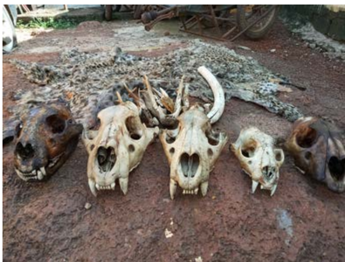
A corrupt policeman arrested with 5 lion skulls, a leopard skin and an ivory tusk.