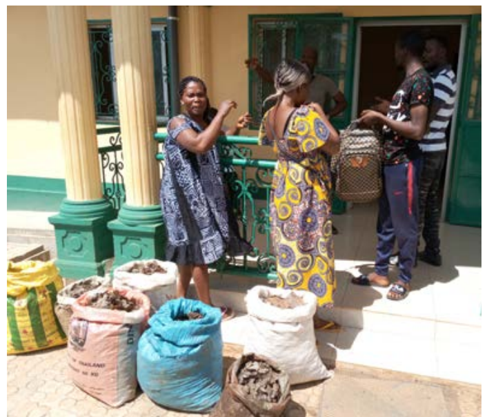
4 traffickers arrested with 100 kg of pangolin scales in Cameroon.

2 traffickers arrested with two tusks in Gabon. The first one, a Burkina Faso national, was arrested after being monitored by the operation team entering a hotel with the contraband concealed in a black bag. He denounced the other trafficker, who was swiftly arrested nearby.