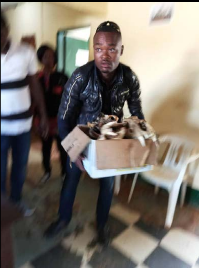
A corrupt policeman arrested with 5 lion skulls, a leopard skin and an ivory tusk in Cameroon.