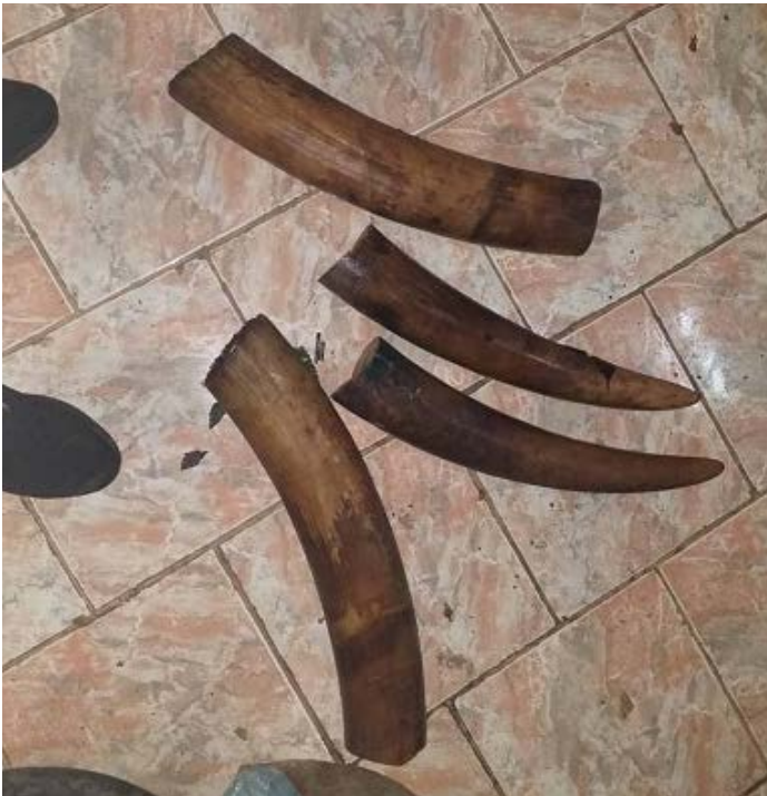
2 traffickers arrested with two tusks.