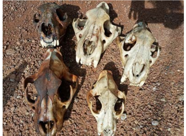
A corrupt policeman arrested with 5 lion skulls, a leopard skin and an ivory tusk in Cameroon.

A corrupt policeman arrested with 5 lion skulls, a leopard skin and an ivory tusk in Cameroon. He has been central for wildlife trafficking in the north of the country where the last remaining lions are. Being on a duty at the Bouba Ndjida National Park, instead of protecting endangered animals he organized a poaching ring around the National Park and was protecting poachers and traffickers. He used his police cover and credentials to transport the wildlife contraband for more than 1,000 km to the capital city where he intended to sell it.