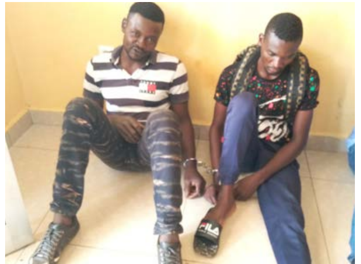
4 traffickers arrested with 100 kg of pangolin scales in the West of the country.

was protecting poachers and traffickers. He used his police cover and credentials to transport the wildlife contraband for more than 1,000 km to the capital city where he intended to sell it.