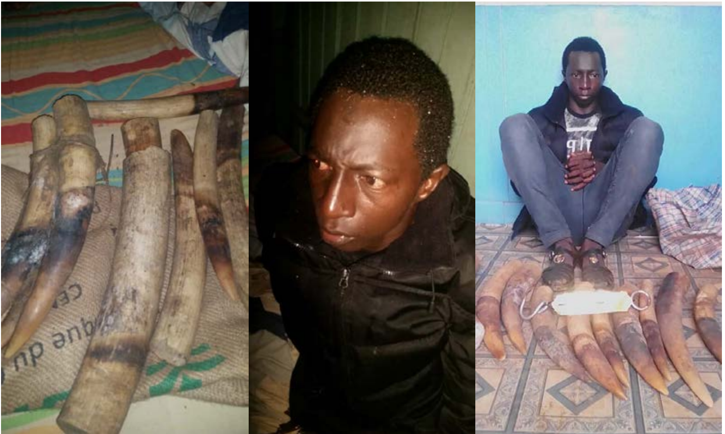
An ivory trafficker arrested in the North of Congo with 9 tusks.