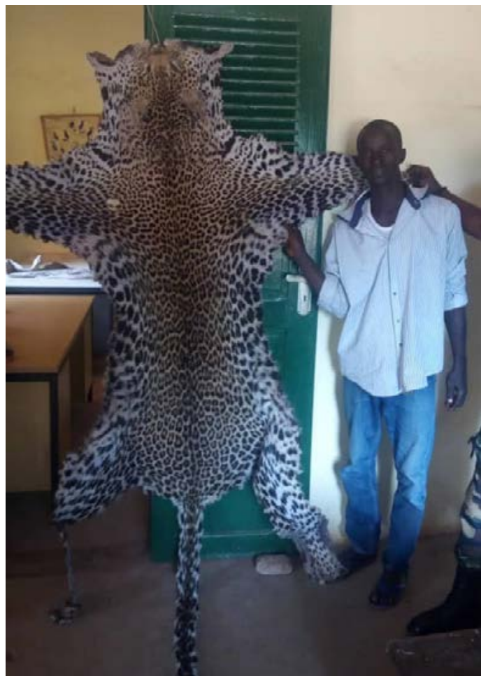
A trafficker arrested with a leopard skin in Upper Guinea.