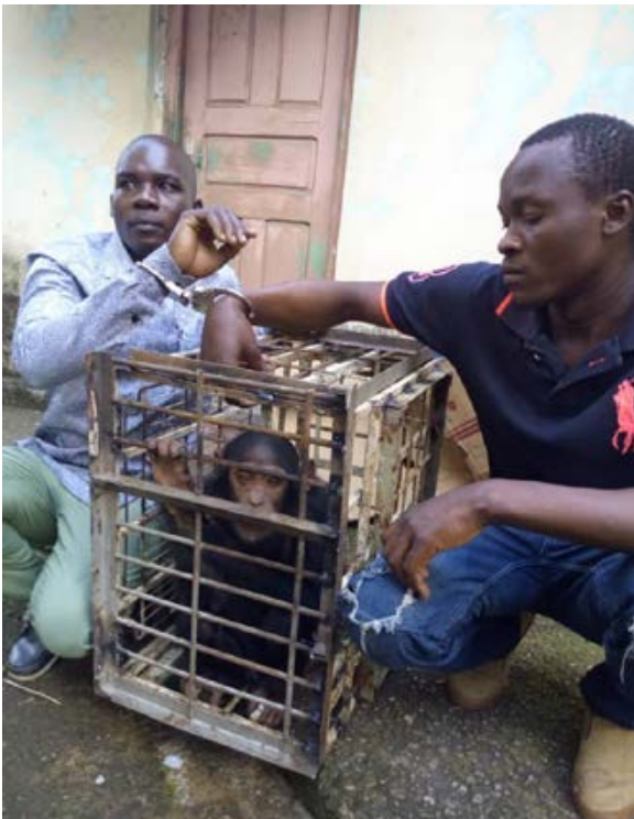
2 ape traffickers arrested and a juvenile male chimp rescued in Douala, Cameroon.

using the logging trucks operating in the region. He also used his mobile phones shop as a cover for the criminal activities, collecting the ivory from a ring of poachers, concealing it in his shop and then re-selling it. Trafficking with corrupt policemen, he hoped for impunity, however he has been arrested in the act and he remains behind bars awaiting trial.