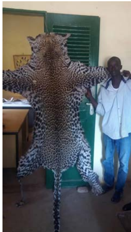
A trafficker arrested with a leopard skin in Upper Guinea.

A trafficker arrested with a leopard skin in Upper Guinea. The taxi-driver, who had been involved in trafficking leopard skins between Mali and Guinea regularly, was arrested during an attempt to sell the skin of a very large leopard in a hotel.