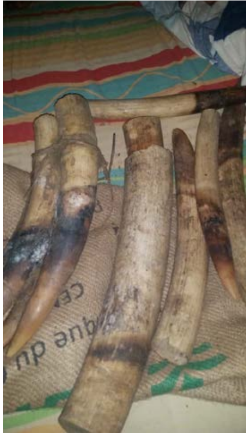
An ivory trafficker arrested in the North of Congo with 9 tusks.

An ivory trafficker arrested in the North of Congo with 9 tusks. He carried the ivory on a motorcycle concealed in a bag to evade detection. He is a notorious trafficker well known to authorities and well connected, trafficking ivory for years in several countries, especially Cameroon and Nigeria,