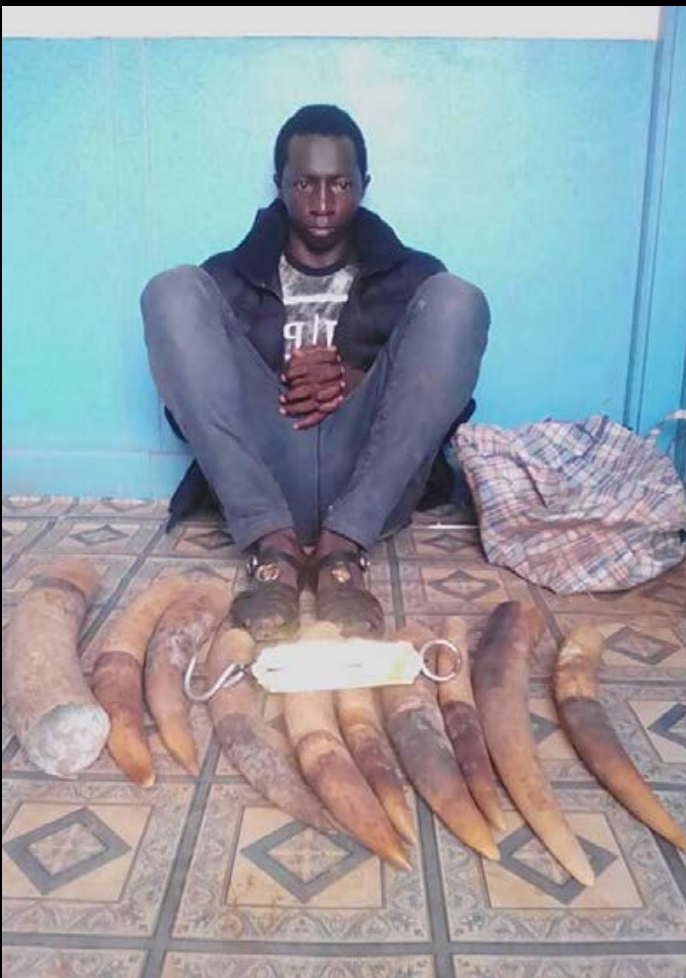
An ivory trafficker arrested in the North of Congo with 9 tusks.