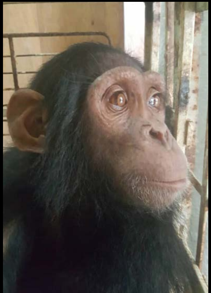
2 ape traffickers arrested and a juvenile male chimp rescued in Douala, Cameroon.