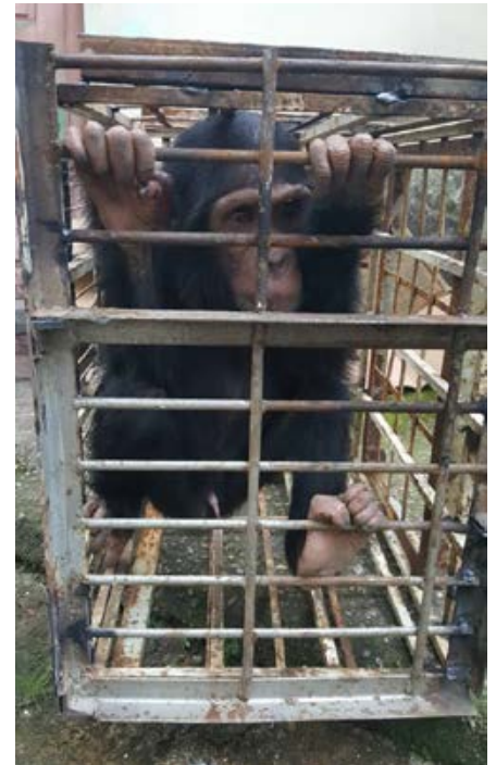
2 ape traffickers arrested and a juvenile male chimp rescued in Douala, Cameroon.