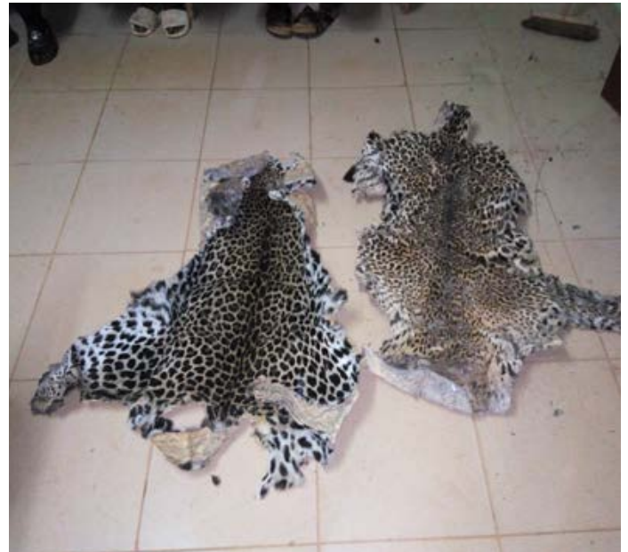
2 traffickers arrested with two leopard skins