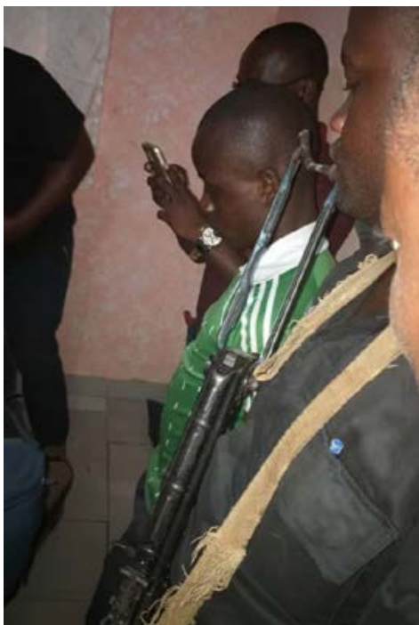
A trafficker arrested with 4 elephant tusks. He carried the contraband concealed in a suitcase