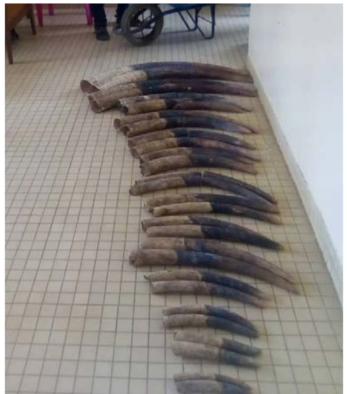
14 ivory traffickers were arrested in Congo in 3 operations. 6 traffickers were arrested with 41 tusks weighing 90 kg.

2 traffickers were arrested with a leopard skin and 3 crocodile skins in Benin. One of them is a seller of animal skins, using his business as a cover for illegal trafficking in protected species. They were arrested in the act in a hotel room.