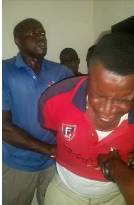
6 traffickers arrested with 41 tusks weighing 90 kg.