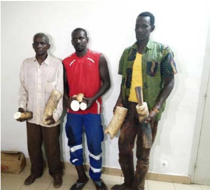
3 Senegalese ivory traffickers arrested with 2 tusks, cut to 8 pieces