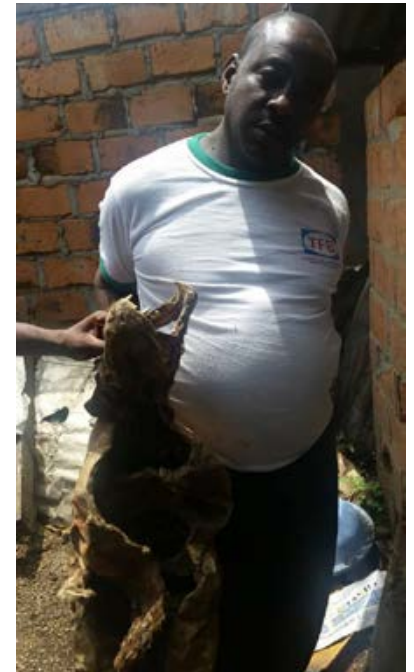
7 traffickers arrested with 3 large tusks, weighing more than 45 kg, 4.5 kg of giant pangolin scales and a leopard skin

■ A legal adviser and an investigator continued their test period.